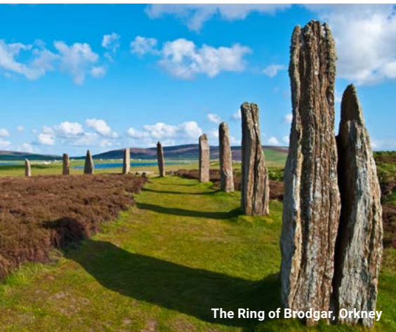
The Ring of Brodgar, Orkney