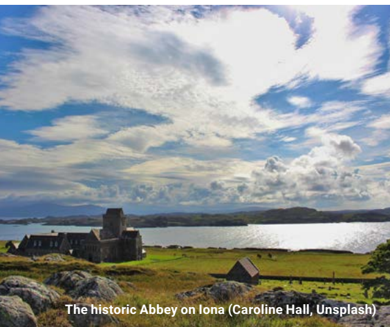
The historic Abbey on Iona