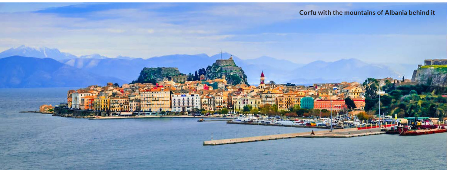
Corfu with the mountains of Albania behind it

All itineraries subject to change according to local conditions.