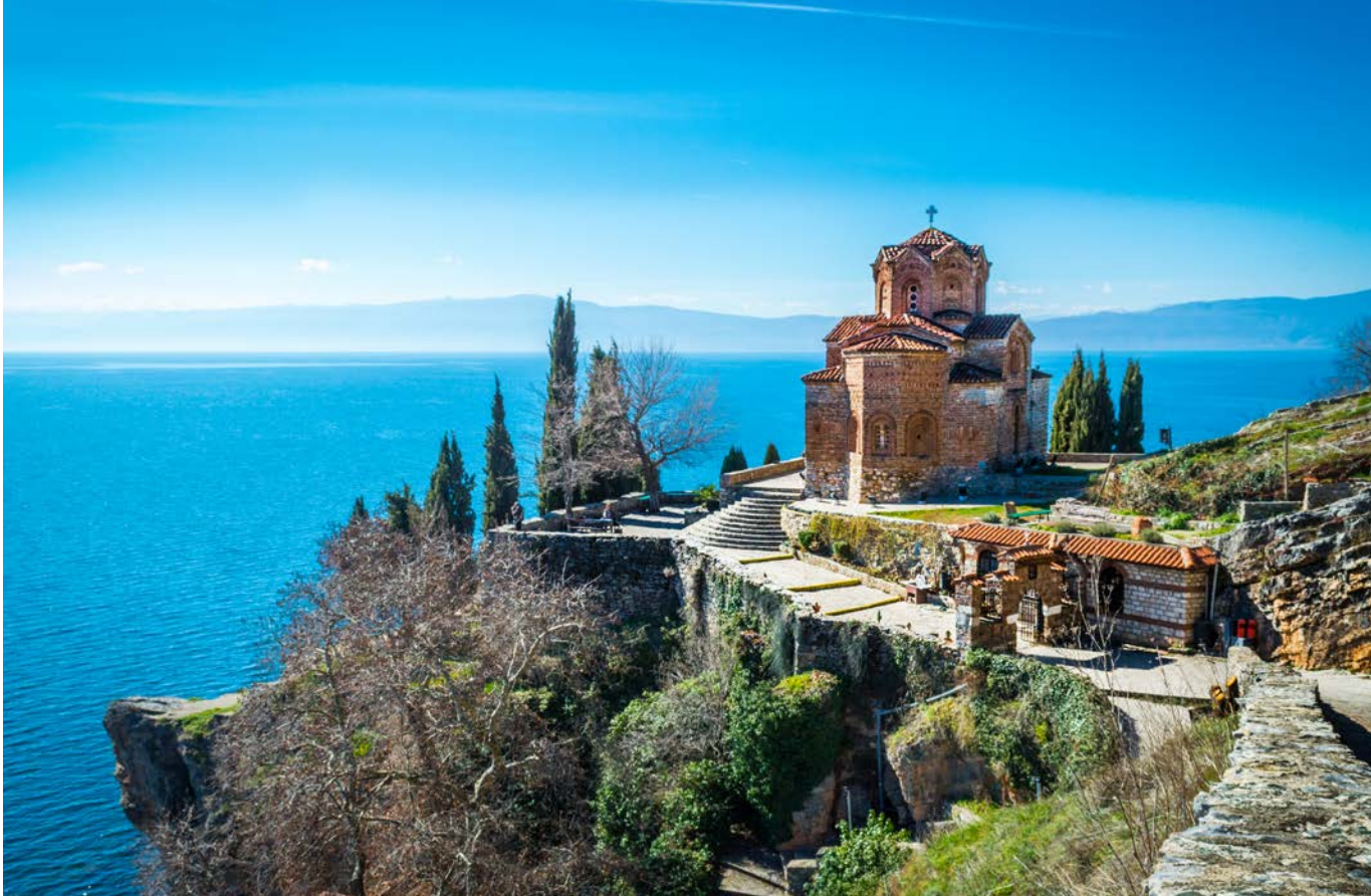
Lake Ohrid, Macedonia