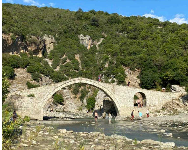
Katiut Bridge over the springs at Bënja

This tour requires reasonable physical fitness. Participants will need to walk across uneven and rough ground on archaeological sites as well as being able to comfortably manage a number of walks through towns and cities.