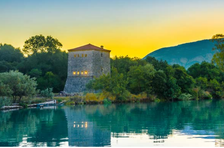
The Venetian tower in Butrint, Albania