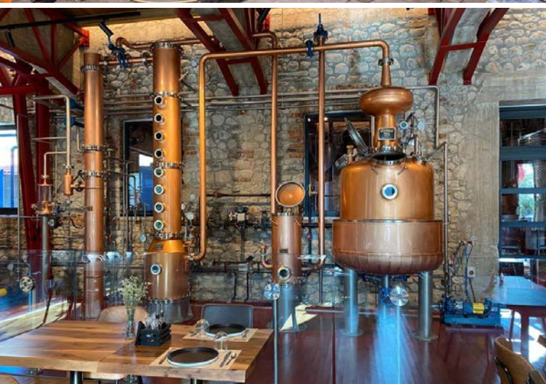
An ancient oak tree containing a freshwater spring in Leskovik (top); The cooper and cognac maker in Këlcyra; Gin distillery in Leskovik (above)

The cost of the tour sharing a room is USD $3,612