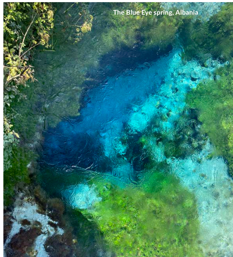
The Blue Eye spring, Albania

Eve: Meet with a noted local writer, who will join us for dinner to talk about Gjirokastër and its history.