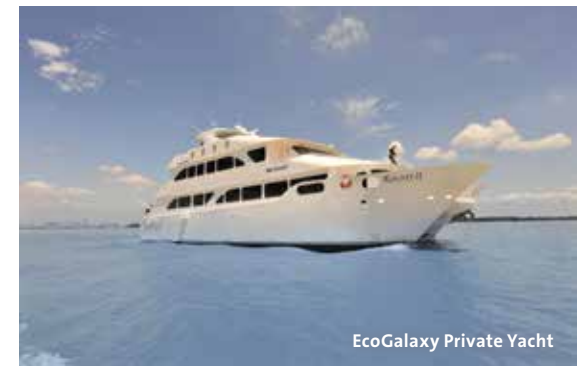
EcoGalaxy Private Yacht

This EcoGalaxy Galápagos Catamaran has eight cabins and will take a maximum of sixteen passengers (fifteen participants plus tour leader). The large catamaran has spacious cabins with large windows and well equipped bathrooms. The catamaran includes a lovely sundeck with day beds, a terrace for sundowners, a large dining room and lounge with bar. There is a dedicated area where guides provide background on the daily island tours, wildlife and suggestions on additional walks, sightseeing, birdwatching, snorkelling etc. There are eight crew including a chef and bilingual naturalist guide.