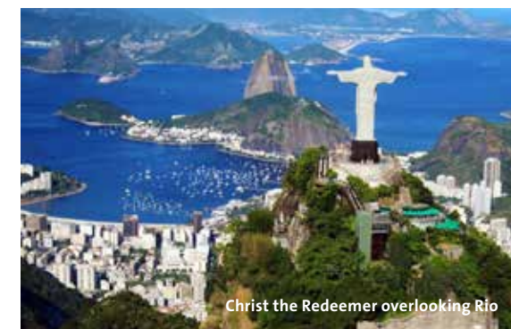
Christ the Redeemer overlooking Rio

Travel from effortlessly spectacular Rio de Janeiro to the jungle and thundering Iguazu Falls, to finish in cosmopolitan Buenos Aires. Take in the history, the architecture and the natural beauty of these two countries while participating in ophthalmology professional visits in both Rio de Janeiro and Buenos Aires. Professional visits to university hospitals, private hospitals and medical clinics will investigate ophthalmology and eyecare in Brazil and Argentina. The tour is suitable for all eyecare professionals. A pre-tour extension in Rio de Janeiro includes the Carnival Champion's Parade and a post-tour extension explores Patagonia.