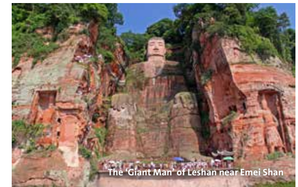
The 'Giant Man' of Leshan near Emei Shan

This tour gives you insight into China's ancient history as well as contemporary issues in medicine and society. A wide range of professional visits and talks show how Western medicine and Traditional Chinese Medicine are integrated in practice in China. From imperial Beijing journey to the Silk Road city of Xi'an. Travel by high-speed train to Chengdu, known for its arts, teahouses and pandas. Continue to the rural beauty of Emei Shan, one of the most sacred mountain sites in China, and relax at a stylish resort. The tour ends in Shanghai, a dynamic city with a glamorous Art Deco heart.