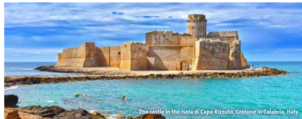
The castle in the Isola di Capo Rizzuto, Crotona in Calabria, Italy

Throughout the cruise enjoy private excursions that delve beyond the ordinary. Cruise the Corinth Canal from Athens, visiting Delphi en route; explore ancient ruins from Butrint to Taormina; walk around medieval and Renaissance towns that effortlessly exude charm, take a sunset cruise past the famous volcano of Stromboli and relax over delicious Italian lunches.