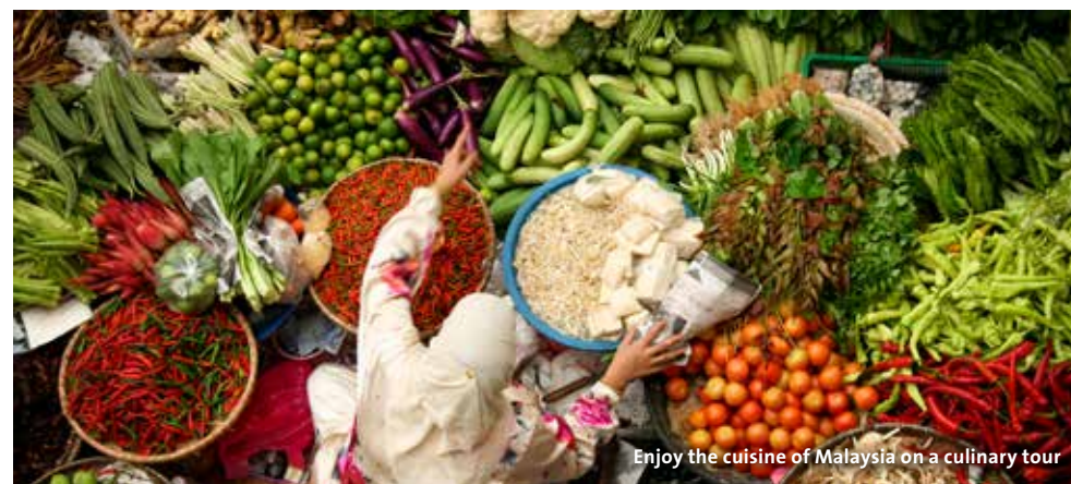
Enjoy the cuisine of Malaysia on a culinary tour

We try to ensure that you enjoy the best of a country's cuisine; drinks as well as food. We also try to be as local as possible. Many of our regular meals add to the cultural experience of our tours. These could include a meal at the Koto charity in Hanoi, a caipirinha on a Brazilian beach, a cup of chá in a relaxed Sichuan teahouse, Kobe beef in Kobe or tasty samples on a culinary walking tour of the Spice Bazaar in Istanbul. On many of our tours to India, Vietnam and China we offer an optional cookery class and on others, like Kuala Lumpur in Malaysia (pictured), we offer culinary tours. On our Cuisine and Culture Cruise we take a gulet to sample delicious local dishes along the coast of Turkey, as well as in the gastronomic centre of Istanbul.