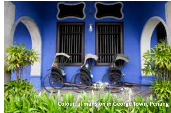
Colourful mansion in George Town, Penang