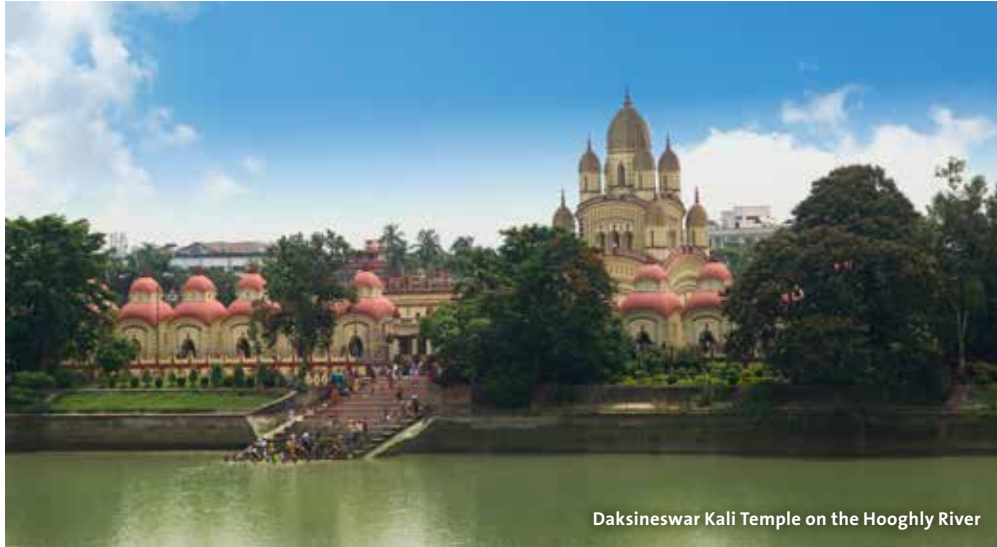
Daksineswar Kali Temple on the Hooghly River

The Hooghly River is the main artery running through the history of Bengal. Bengal was once the richest province in India, its lush soil producing indigo, opium and rice crops and its exquisite textiles known as 'woven wind'. This progressive, wealthy and cultured land drew people from all over the world and Islam, Hinduism, Jainism and Christianity all flourished here. The long history of this province leaves a legacy of magnificent temples, buildings and parks. This tour to Kolkata and along the mighty Hooghly offers an unparalleled view of the rich history of the great