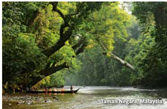
Taman Negara, Malaysia

This exciting new tour combines a full dental professional programme with a richly rewarding cultural experience. From the vast jungles of Borneo and the riverine city of Kuching, travel to the Malay Peninsula, the modern city of Kuala Lumpur and the colonial charm of Malacca. Travel by boat into the world's oldest rainforest in Taman Negara and the colonial tea estates of the Cameron Highlands. Spend the night in a luxury natural spa resort surrounded by jungle clad mountains. Take the train and ferry to colourful George Town, a UNESCO World Heritage Site. Along the way enjoy the blend of European heritage with Malay, Chinese and Indian culture and cuisine