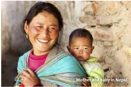
Mother and baby in Nepal