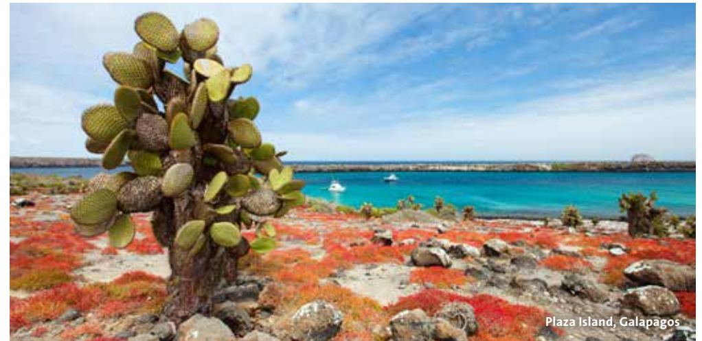
Plaza Island, Galápagos