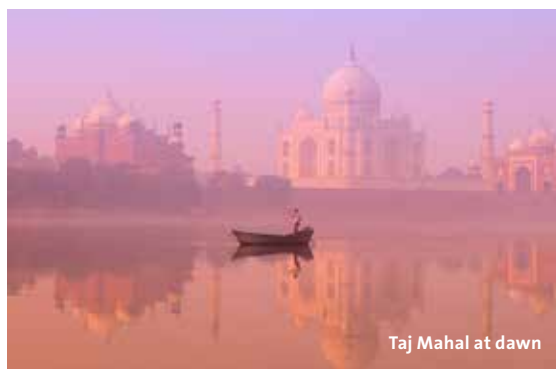
Taj Mahal at dawn

Learn about paediatrics and child health care across India from the north to the south. Visit a wide range of NGOs, hospitals and clinics; meet with fellow professionals and explore the culture, cuisine and landscapes of India. Travel from Delhi, where Mughal and colonial history rub shoulders. Continue to the pink city of Jaipur in Rajasthan via Agra, dominated by the majestic Taj Mahal. Continue to Karnataka for the garden city of Bangalore, the most vibrant techno-hub in South India, and elegant Mysore, city of palaces, silk and sandalwood. Continue to the cool hill stations of Ooty and Coonoor and finish in multicultural Cochin, to cruise the tranquil Kerala backwaters on a rice barge.