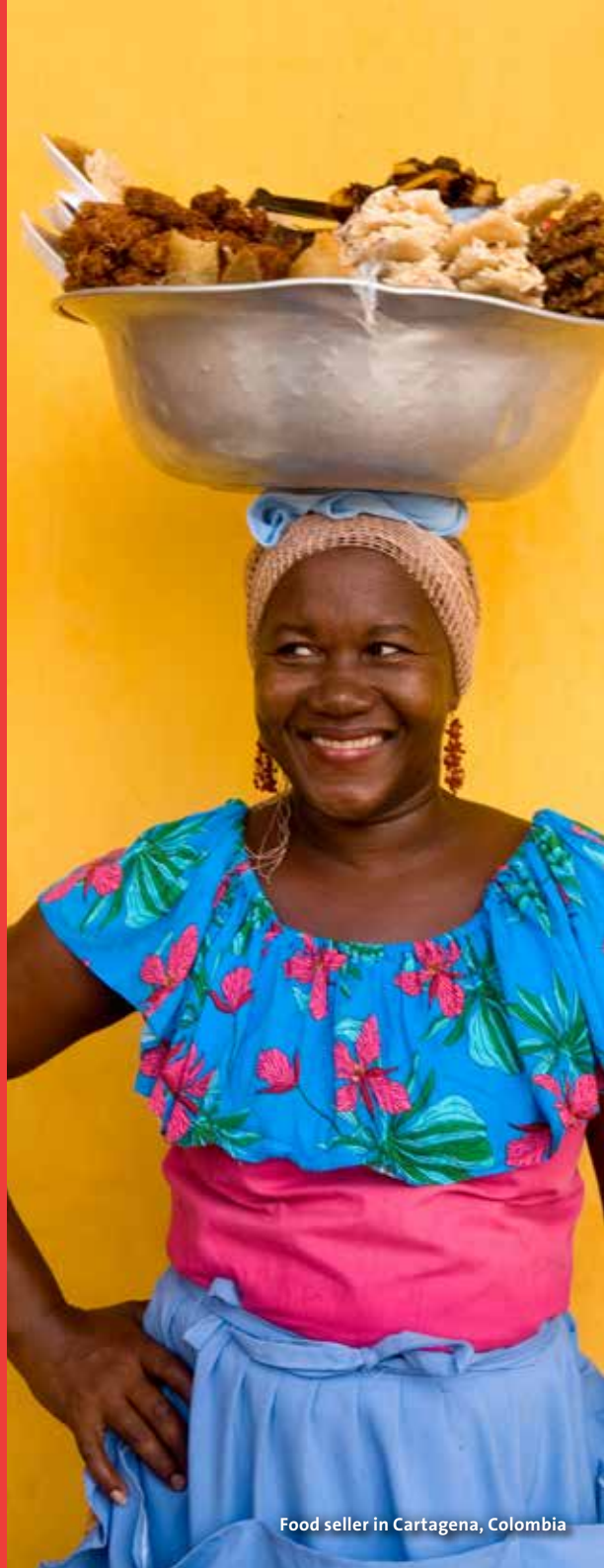
Food seller in Cartagena, Colombia

If you do not wish to receive further information from us, please email info@jonbainestours.co.uk with the subject line Unsubscribe .