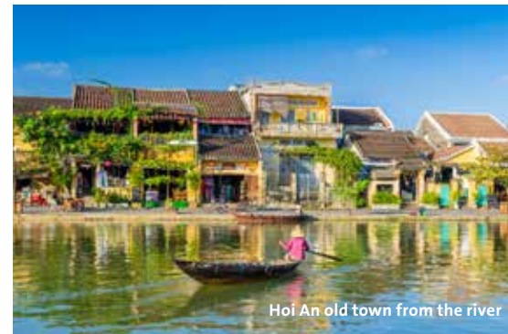
Hoi An old town from the river

This tour examines the development and current practice of pharmacy in Vietnam. Pharmacy has a long history in Vietnam and traditional medicines are still used today. Visits include the university in Hanoi to learn how pharmacists are trained, a retail and hospital pharmacy and the FITO Pharmacy Museum, which shows the historical development of pharmacy in Vietnam, including a visit to its pharmaceutical factory. The professional programme is balanced with a wide range of cultural visits, with ample opportunity to experience the beauty, culture and history of Vietnam and its fabulous cuisine.