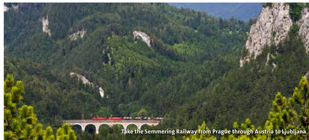
Take the Semmering Railway from Prague through Austria to Ljubljana

Tours are a journey, an experience and an adventure – and the transport should be part of that. We try to include as much variety as possible. Internal flights are often necessary and save time, but to really see a country, overland is best. We like to include a rail journey, and we love to walk – the best way to get to know a town or city centre. Wandering the streets allows for browsing, listening and musing; stopping for that spontaneous drink, or unusual snack, or that surreal purchase. To spice up our tours we also travel by rickshaw, ox cart, jeep, ferry, cable car, rice barge and bus. Bon voyage!