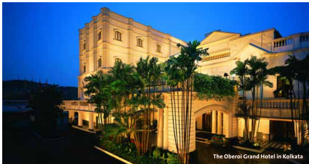
The Oberoi Grand Hotel in Kolkata

When it comes to accommodation we like charm, comfort, a central location and good service. So where possible we stay in buildings that belong to the culture of the country we are travelling in. Sometimes, however, period charm means cold rooms, intermittent plumbing and unresponsive staff - in which case we will book that reliable, architecturally uninspiring modern building. We also like variety; a selection of hotels from the city grand dame, to the contemporary boutique, to the bungalow, to the unusual (a boulder hotel, a fort hotel or perhaps a rice barge). A good bar area for the group to gather of an evening is also important. On our cruises, we aim to use smaller boats and ships. What they lack in glitz they make up for in service and style.