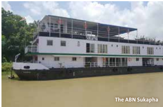
The ABN Sukapha

The ABN Sukapha has been chartered exclusively for our group. It contains 12 air-conditioned cabins, all of which have French balconies and en suite bathrooms. There is a spa, a saloon with a library and a spacious sundeck at the very top. Fabrics on board have been handwoven by Bodo tribal villagers; the comfortable rattan chairs are locally sourced and made. Food on board is a mixture of Assamese (milder than most Indian cuisine) and continental, with wines, beer and spirits on offer.