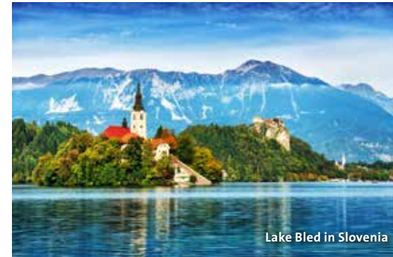
Lake Bled in Slovenia