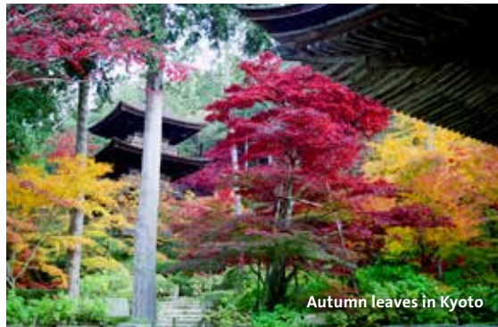
Autumn leaves in Kyoto