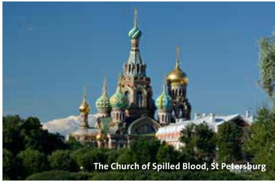
The Church of Spilled Blood, St Petersburg