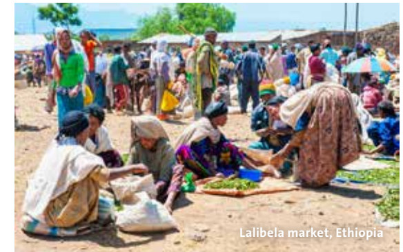
Lalibela market, Ethiopia