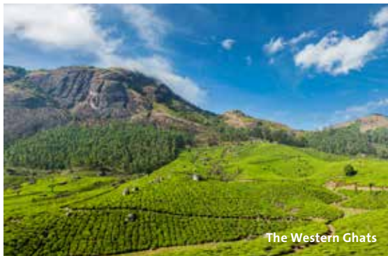
The Western Ghats