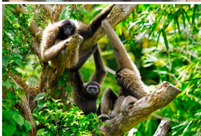
Iban girl in Sarawak (top); Food market, Malay District, Kuala Lumpur; Concubine Lane, Ipoh; Gibbons in Bako National Park (above)