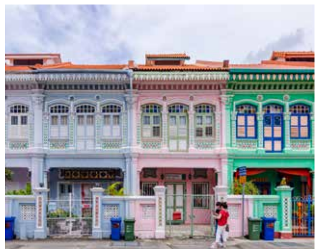
Tea plantation in the Cameron Highlands (top); Colourful George Town, Penang (above)