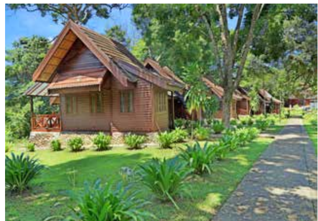
The geothermal pool at Banjaran Hot Springs (top); Rainforest Lodge, Taman Negara National Park (above)