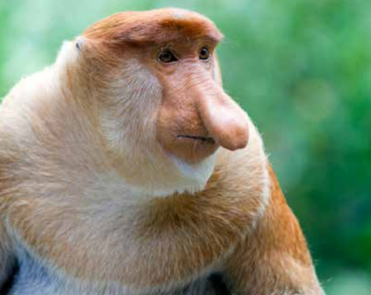
Proboscis monkey, Bako National Park, Sarawak