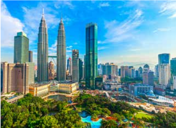
Longhouse, Sarawak (top); Kuala Lumpur skyline (above)

Drive to the Semenggoh Wildlife Centre to view semi-wild orangutans in a natural setting the next morning. Continue to Anah Rais, a longhouse Bidayuh village set beside a beautiful stream, and learn about the culture of the Land Dayaks. Take a short walk with a specialist guide to learn about traditional medicinal plants and village life today. Return to Kuching and enjoy a sunset cruise with drinks on the Kuching River.