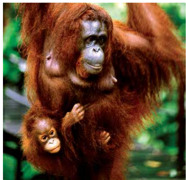
Orang utans, Semenggoh, Sarawak