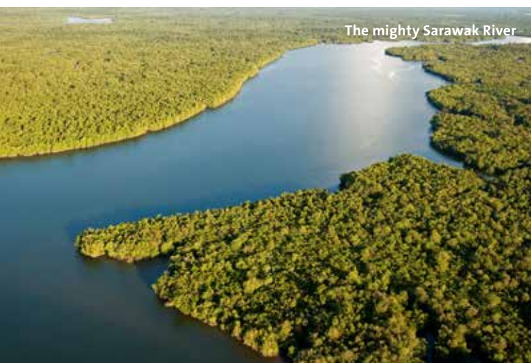
The mighty Sarawak River

Felicity McCormack, Optometry Tour to China, April 2019