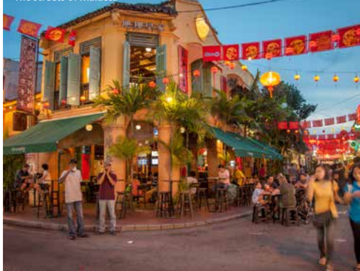
The streets of Malacca