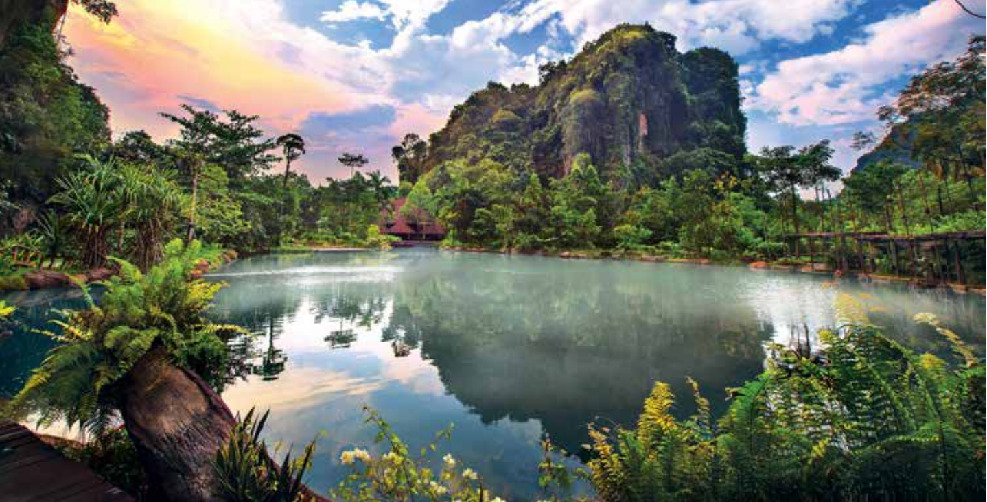
The magnificent Banjaran Hot Springs

Explore Sarawak in Borneo and journey up the Malay Peninsula to experience the history, culture and wildlife of the region, alongside a wide-ranging professional itinerary that examines local optometry and eyecare. Learn about the background to the fast-developing area of optometry and eyecare in Malaysia; see the particular challenges of reaching indigenous populations in remote areas, and look at the government-supported medical tourism industry.