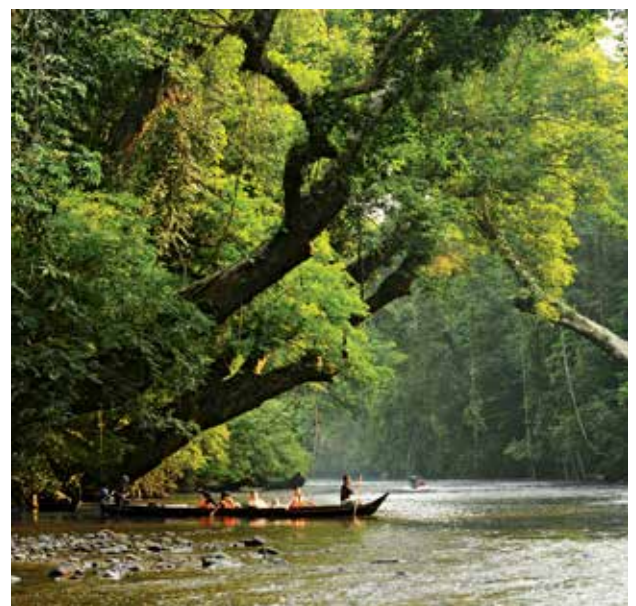
Take the boat upriver in Taman Negara

Depart Kuala Lumpur and travel into the interior to take a traditional long wooden boat into Taman Negara National Park, the world's most ancient rainforest. Transfer to the rainforest lodge. In the afternoon take a boat up a tributary river with the option to swim in the fresh water. In the evening take part in a nocturnal jungle walk.