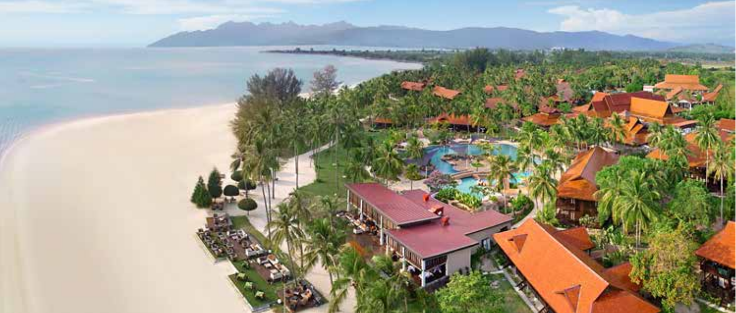
The beaches of Langkawi