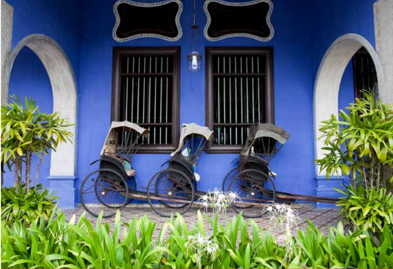
Rickshaws outside mansion, George Town, Penang