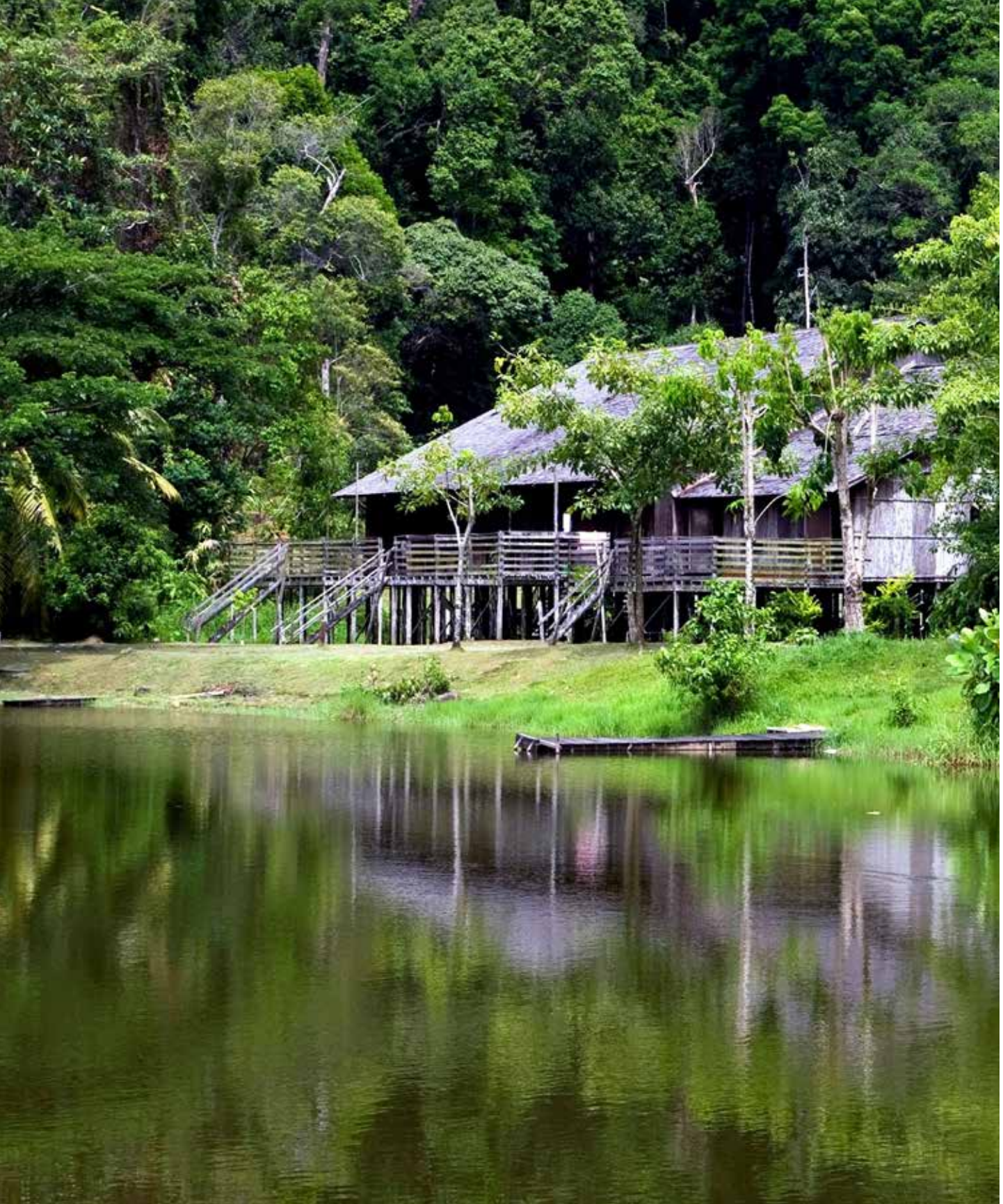
A traditional longhouse by Sarawak River