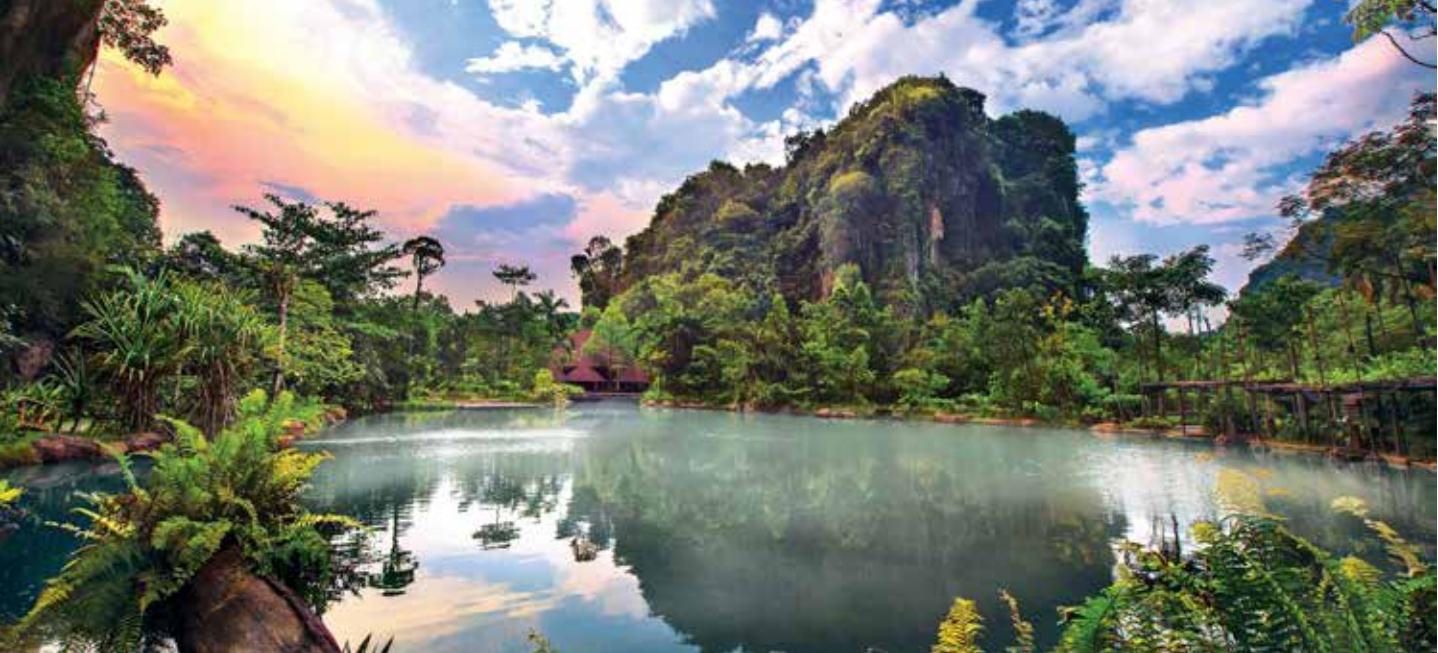
Banjaran Hot Springs Retreat