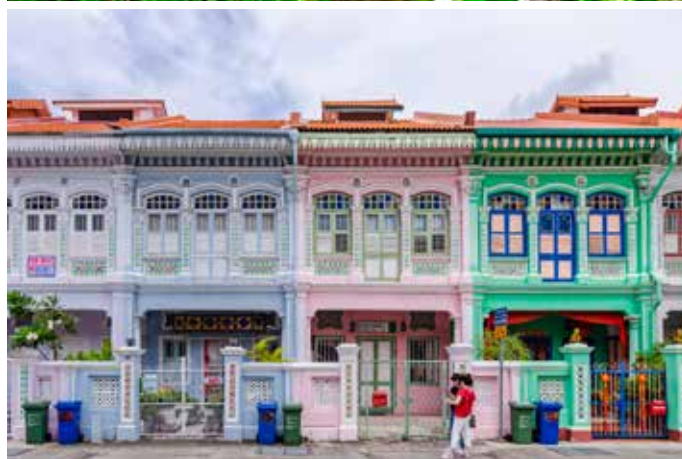
Kuching riverfront (top); Cheong Fatt Tze Mansion, Penang; Gibbons; The colourful streets of Penang (above)

All the flights and flight-inclusive holidays in this brochure are financially protected by the ATOL scheme. When you pay you will be supplied with an ATOL Certificate. Please ask for it and check to ensure that everything you booked (flights, hotels and other services) is listed on it. Please see our booking conditions for further information or for more information about financial protection and the ATOL Certificate go to: www.atol.org.uk/ATOLCertificate