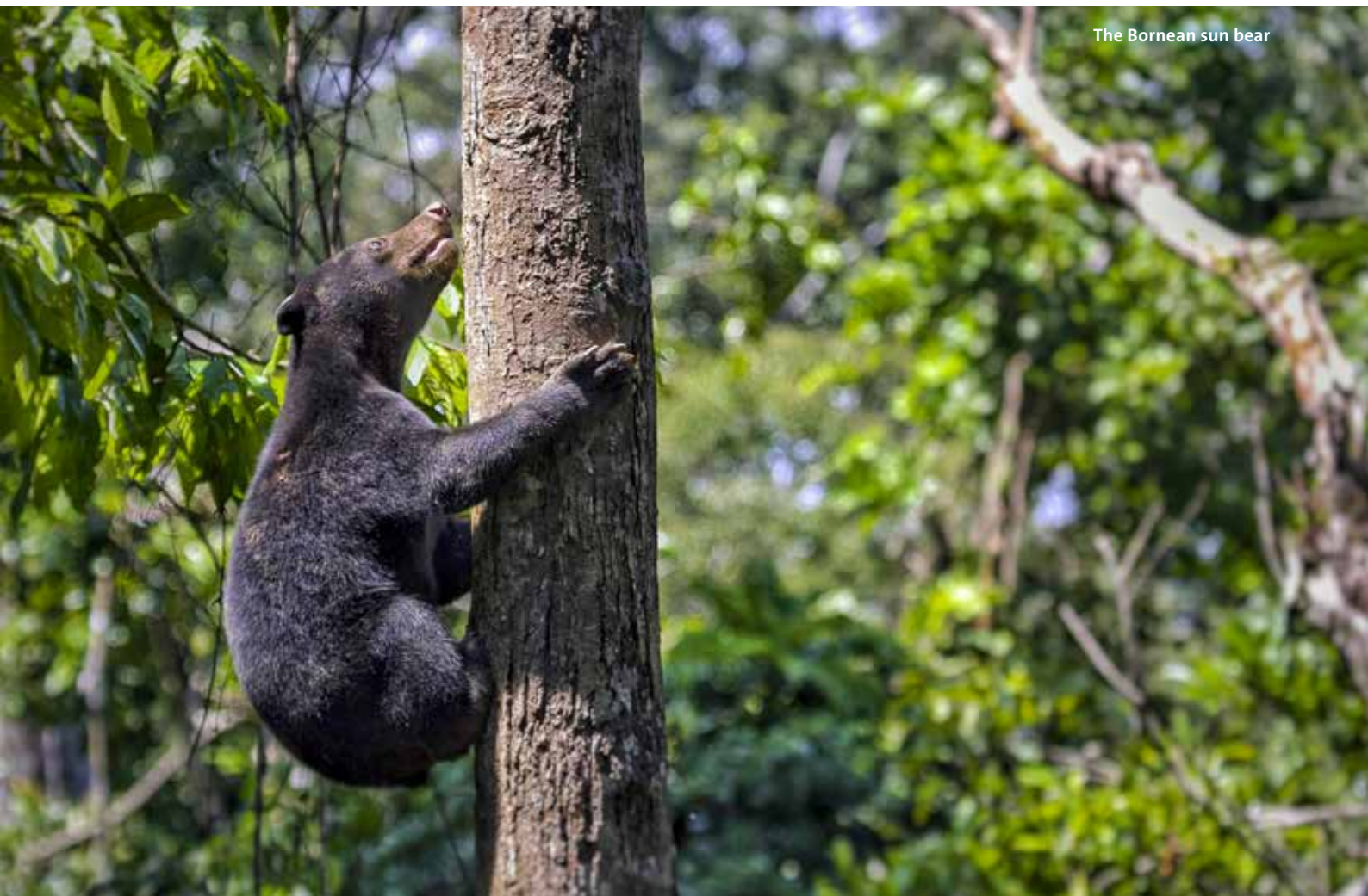
The Bornean sun bear