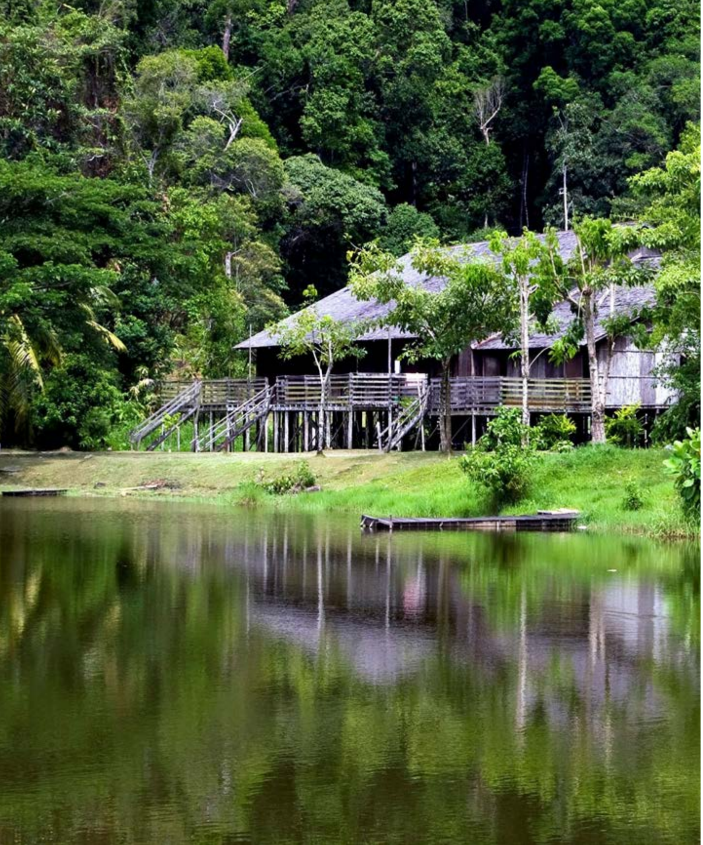
A traditional longhouse by Sarawak River