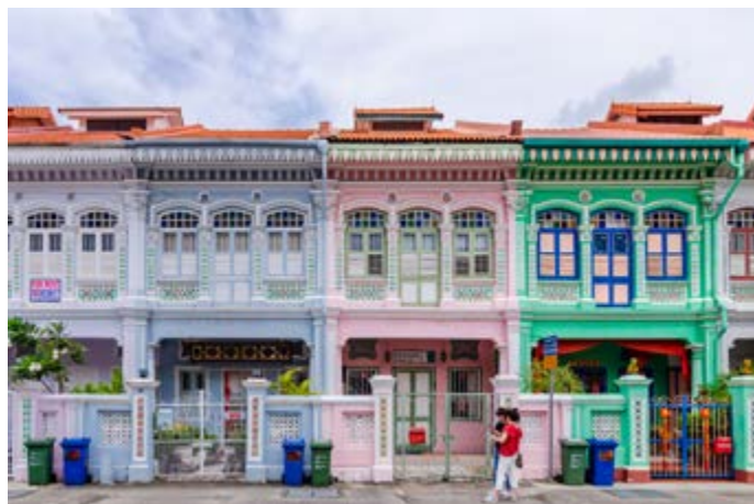
Kuching riverfront (top); Cheong Fatt Tze Mansion, Penang; Gibbons; The colourful streets of Penang (above)

All the flights and flight-inclusive holidays in this brochure are financially protected by the ATOL scheme. When you pay you will be supplied with an ATOL Certificate. Please ask for it and check to ensure that everything you booked (flights, hotels and other services) is listed on it. Please see our booking conditions for further information or for more information about financial protection and the ATOL Certificate go to: www.atol.org.uk/ATOLCertificate