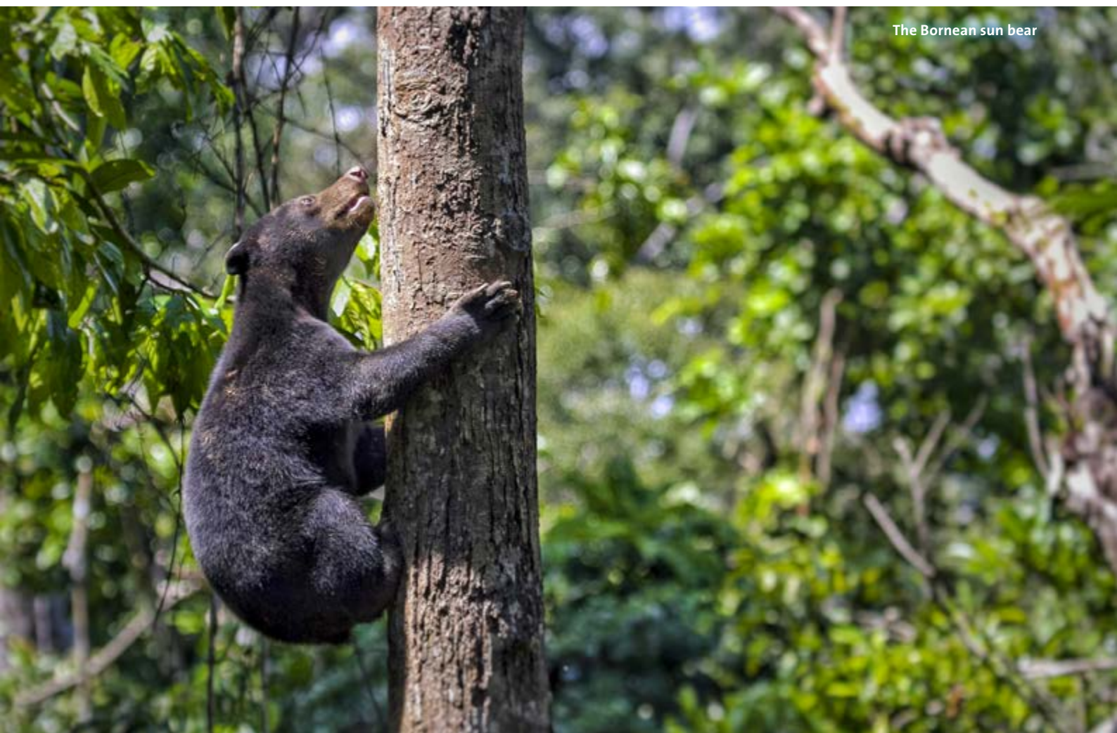
The Bornean sun bear