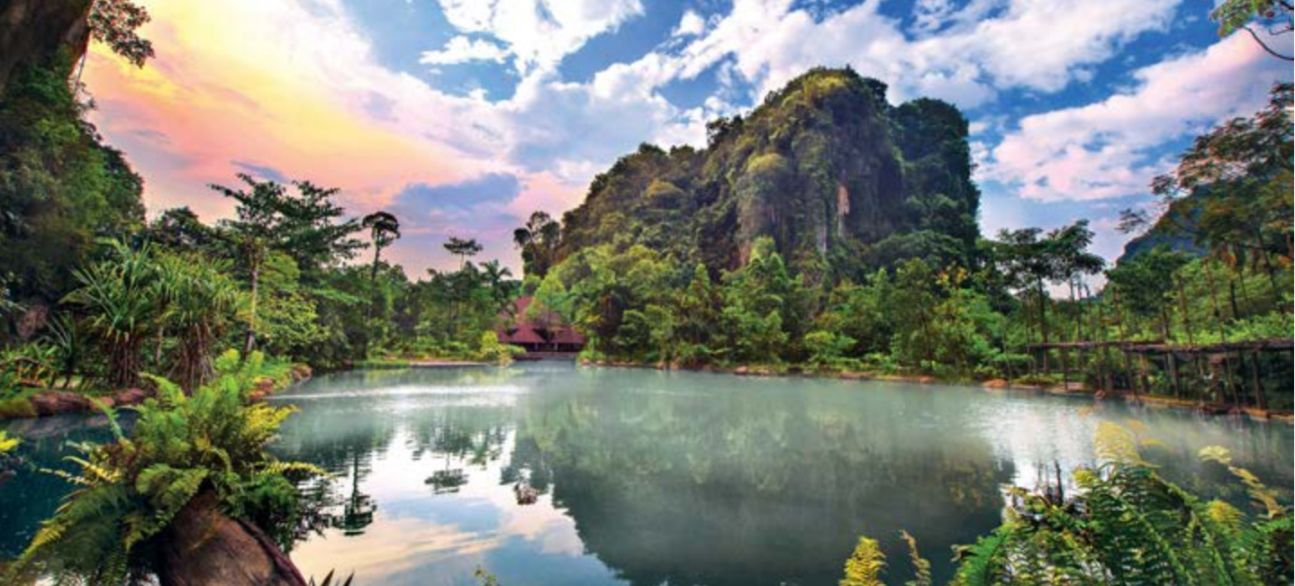
Banjaran Hot Springs Retreat