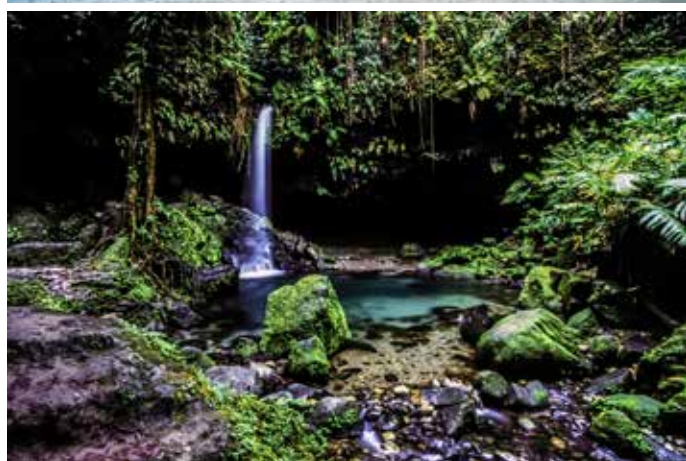
The beach at Bonaire (top); Nelson's Dockyard, Antigua; Tortola; Trois Pitons National Park, Dominica (above)

All the flights and flight-inclusive holidays in this brochure are financially protected by the ATOL scheme. When you pay you will be supplied with an ATOL Certificate. Please ask for it and check to ensure that everything you booked (flights, hotels and other services) is listed on it. Please see our booking conditions for further information or for more information about financial protection and the ATOL Certificate go to: www.atol.org.uk/ATOLCertificate