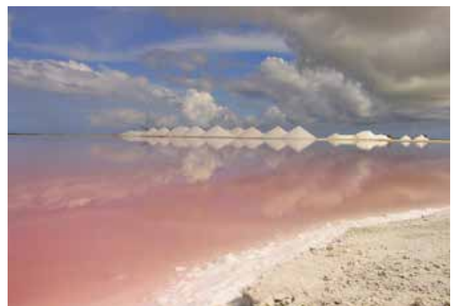
The salt pans on Grand Turk

All itineraries are subject to change according to local conditions.