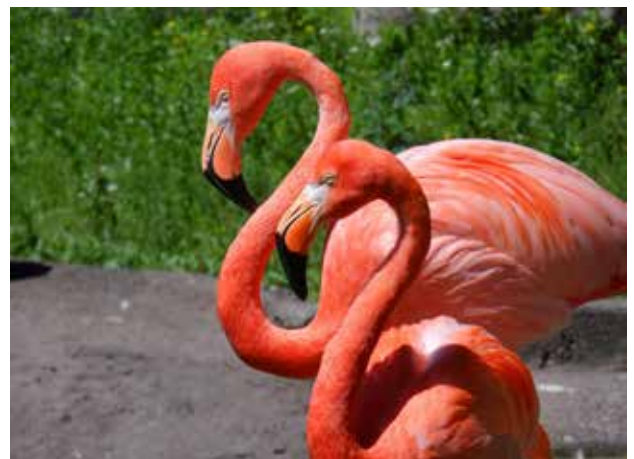
Willemstad, Curacao (top) ; See the flamingos on Bonaire (above)