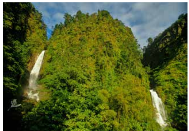
Brimstone Hill, St Kitts (top); Trafalgar Falls, Dominica (above)