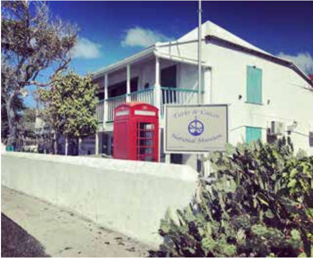
Turks and Caicos National Museum, Grand Turk