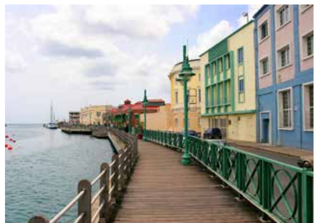
The promenade at Bridgetown, Barbados

Dock at St George's on the spice island of Grenada. Built by the French in 1799, this is one of the most picturesque towns in the Caribbean. Visit the well-preserved Fort Frederick with