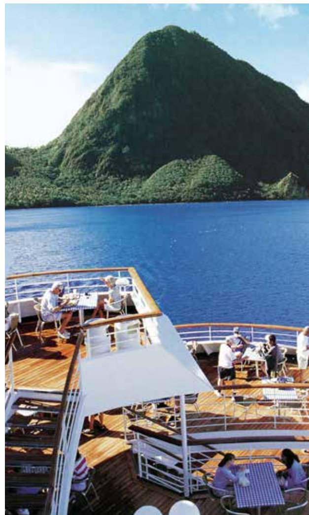
On deck Braemar

Paul Siklos, Medical History in Italy , 2016