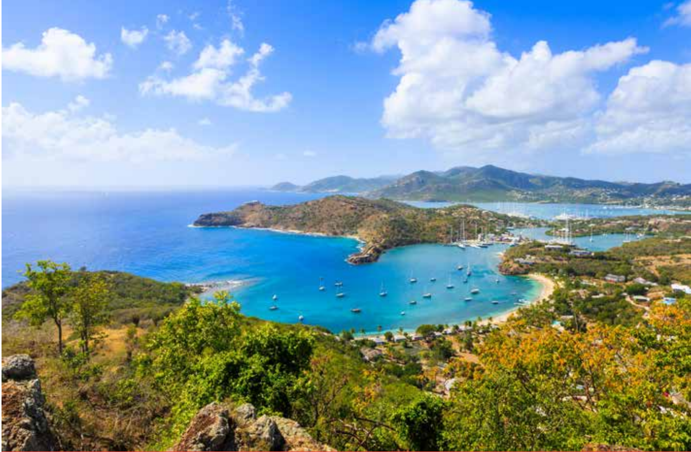
Nelson's Dockyard and Falmouth Harbour, Antigua