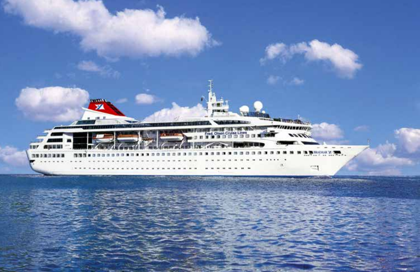
Braemar at sea