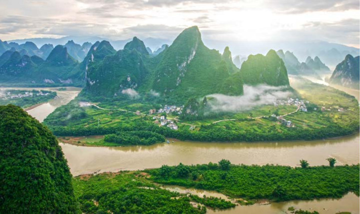
Li River winding through Guangxi Province