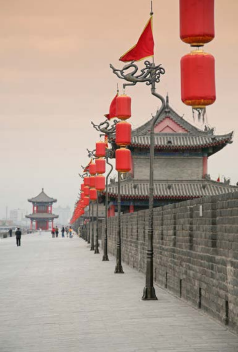
Walk along Xi'an's old city walls