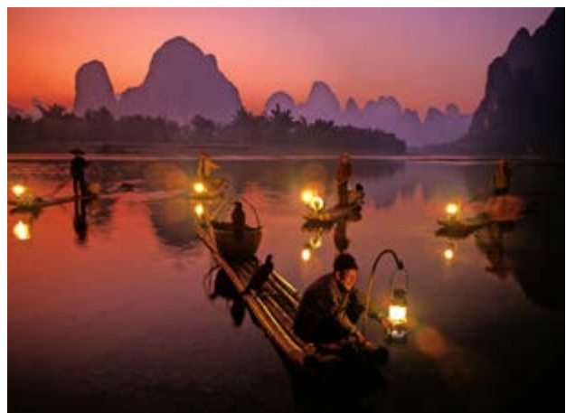
Tongli water town (top); Cormorant fishing (above)