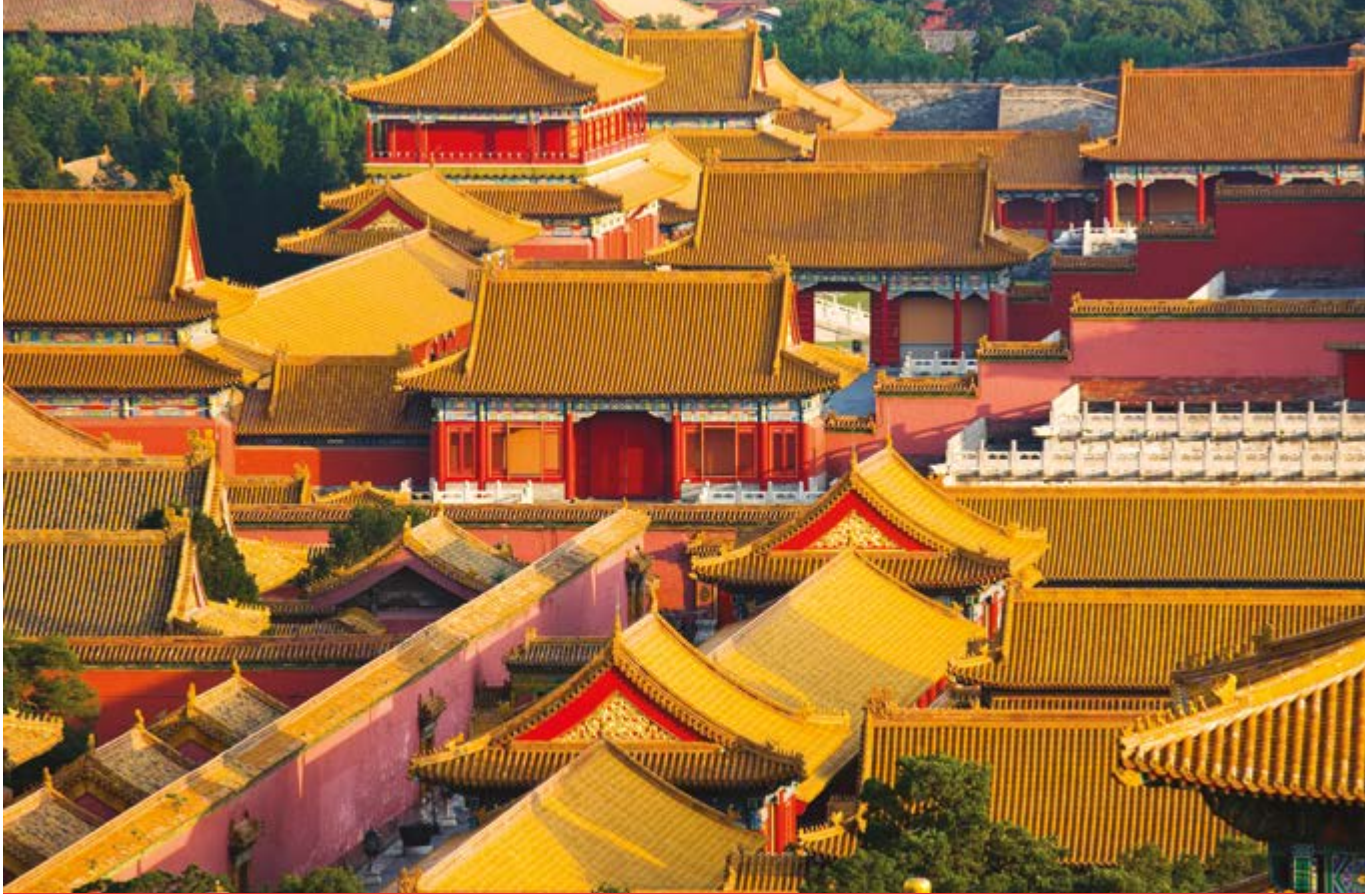
Forbidden City rooftops