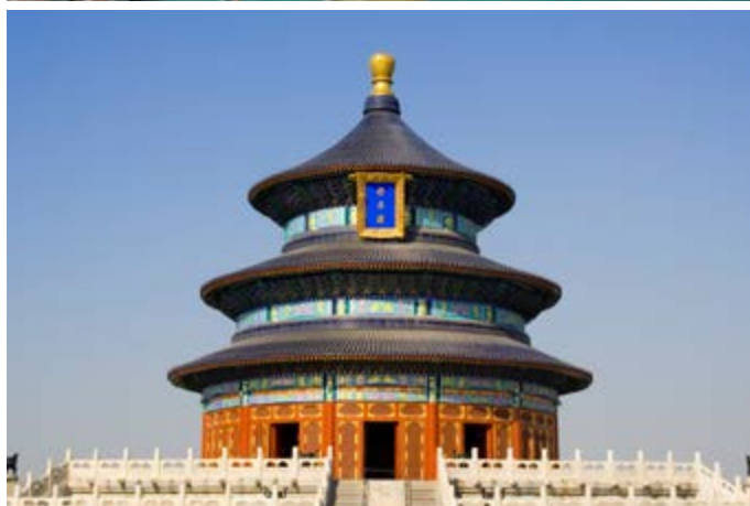
Beijing Acrobats (top); Great Wall; Traditional Chinese Medicine pharmacy; Temple of Heaven, Beijing (above)