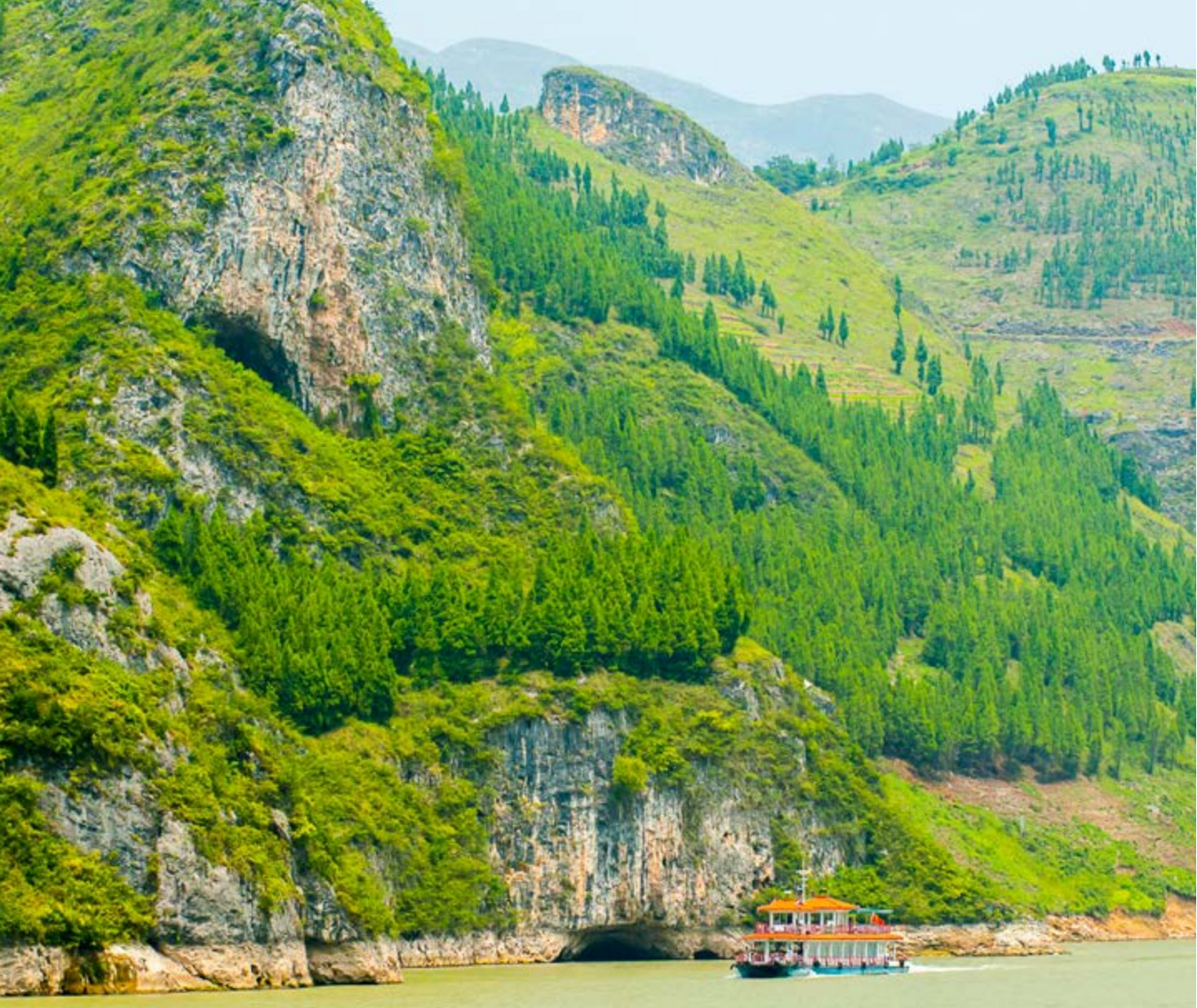
Towering cliffs along the Yangtze River

This tour takes you on a journey through China's history, culture and cuisine while integrating a full dental professional programme. It encompasses the ancient and cutting-edge modernity as you travel from the great imperial city of Beijing to the Silk Road city of Xi'an, home of the Terracotta Warriors and magnificent city walls. Embark on a cruise along the great Yangtze River, which has wound through some of China's most stunning scenery as a major transport route for thousands of years, to finish in dynamic Shanghai, with its elegant Art Deco heart.