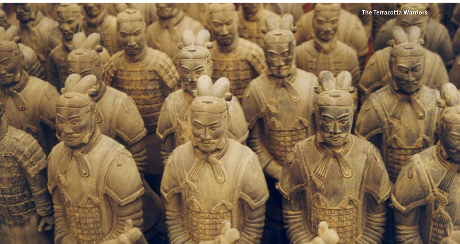
The Terracotta Warriors