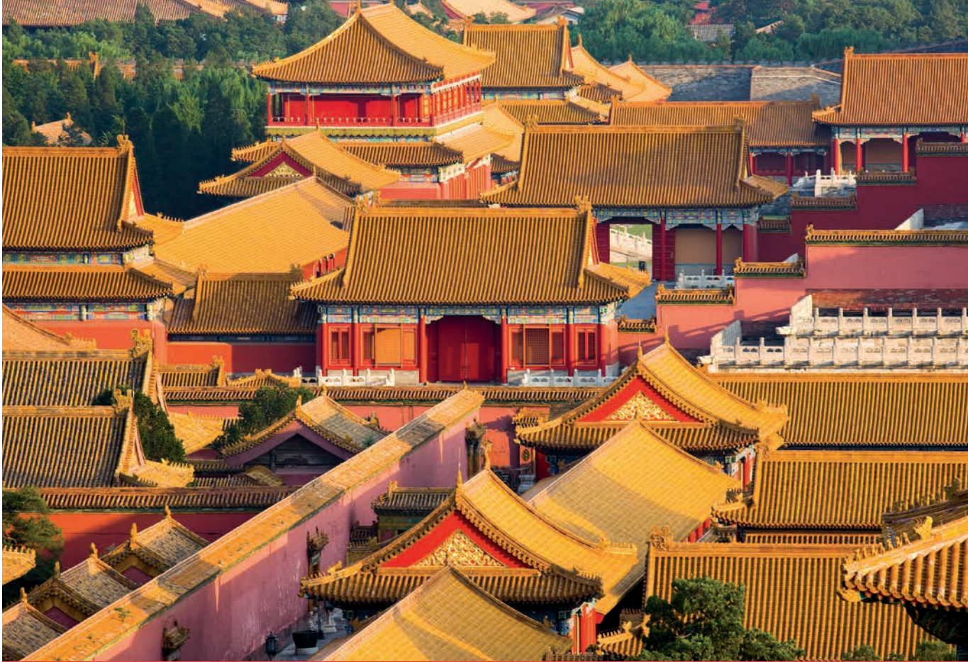
The burnished rooftops of The Forbidden City, Beijing