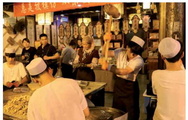
The Terracotta Warriors, Xian (top); The night market in the old Muslim quarter in Xian (above)