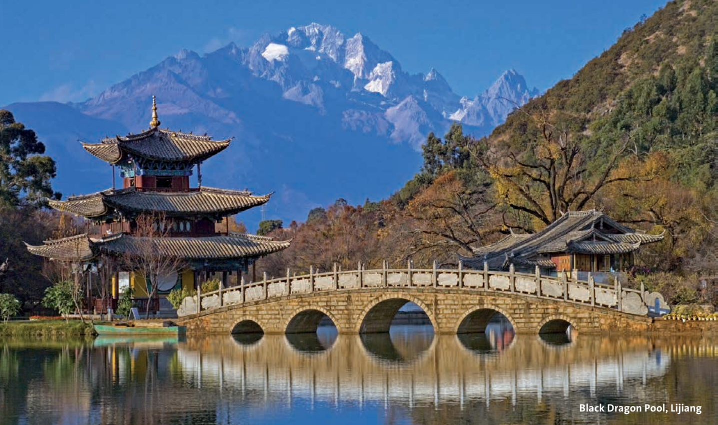
Black Dragon Pool, Lijiang