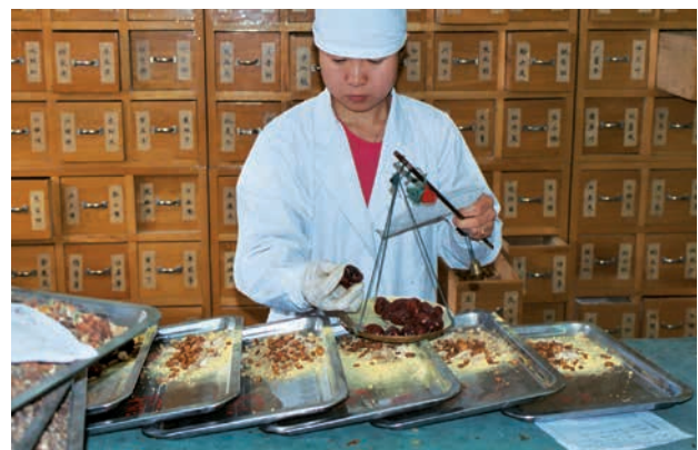
A traditional herbal pharmacy, Beijing

Spend the next day sightseeing, beginning with a visit to the vast expanse of Tiananmen Square and the impressive Forbidden City, once barred to all but the inner royal circle. Afterwards take a walking tour of one of the traditional hutong districts of old Beijing, the oldest areas in the city. Later in the evening there is the option to watch the gravity-defying Beijing Acrobats.