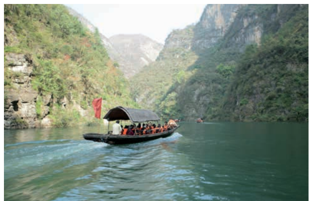
Potala Palace, Tibet (top); Cruise through the Lesser Gorges on the Yangtze River (above)