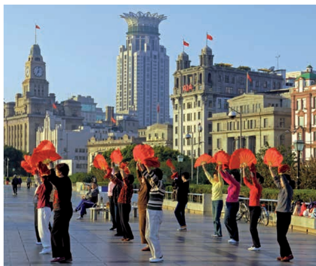
Arrive in Yangshuo (top); A waterwheel on the Li River; A canal in Suzhou; Fan tai chi on the Bund, Shanghai (above)