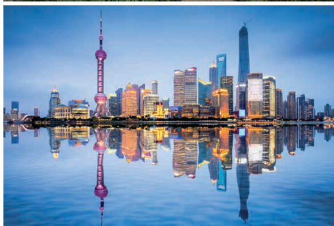
The Beijing Acrobats (top); The ancient city walls of Xian; A moon gate in a Suzhou garden; Shanghai by night (above)

All the flights and flight-inclusive holidays in this brochure are financially protected by the ATOL scheme. When you pay you will be supplied with an ATOL Certificate. Please ask for it and check to ensure that everything you booked (flights, hotels and other services) is listed on it. Please see our booking conditions for further information or for more information about financial protection and the ATOL Certificate go to: www.atol.org.uk/ATOLCertificate