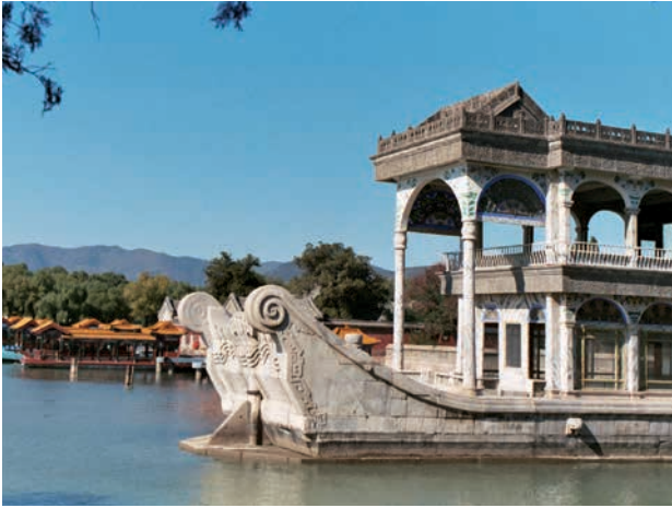
The marble 'boat' at the Summer Palace, outside Beijing

Make your first professional visit the following morning to visit Tong Reng Tang, an ancient pharmacy founded in 1669 that prescribes both Western and Chinese medicine and is today located in the heart of old Beijing.