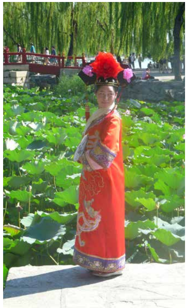
Traditional dress at the Summer Palace

NB: All itineraries are subject to change according to local conditions. This itinerary is ground only and departure and arrival dates may differ.