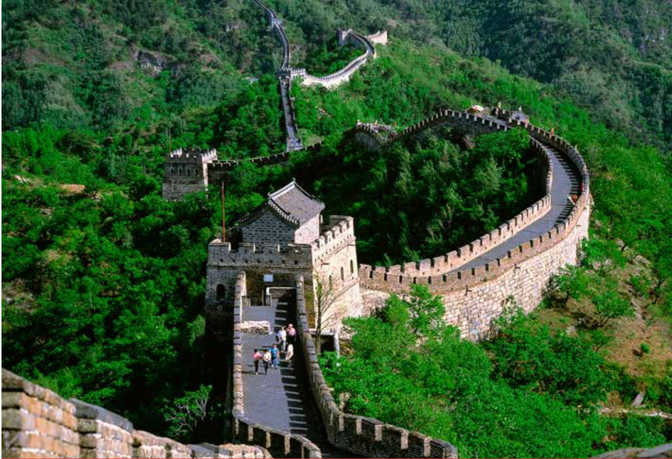
The Great Wall