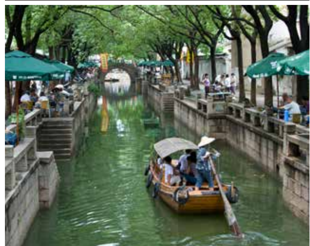
Cormorant fishermen on the Li River (top); Tongli water town (above)