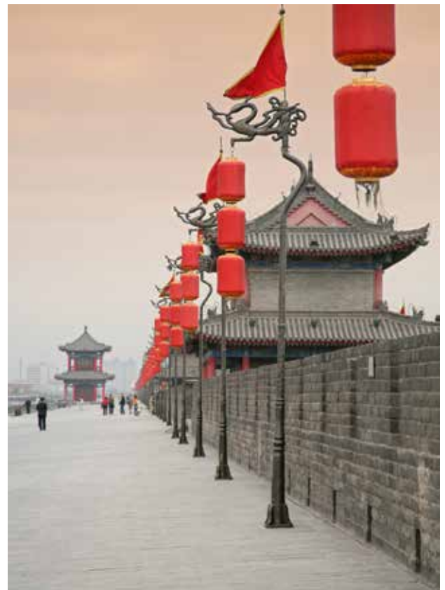
Xi'an city walls

The following day the ship cruises through the Three Gorges, where the Yangtze carves a green ribbon through enormous rock walls. Board a small boat and cruise into the peaceful Lesser Gorges on clear water amidst majestic soaring cliffs and towering hillsides. Pass through Qutang Gorge, the shortest, narrowest and possibly most impressive of the Lesser Gorges, and Wu Gorge, one of the most beautiful