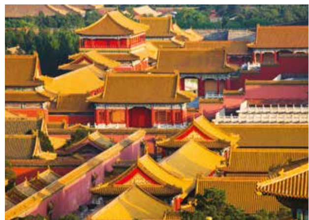
The Forbidden City, Beijing

The following morning visit the beautiful Summer Palace and a teahouse. In the afternoon