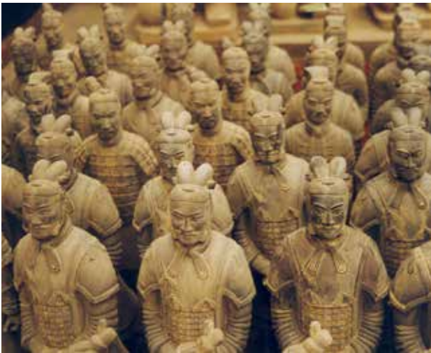
The Terracotta Warriors

drive out to visit the iconic Great Wall where there is plenty of time to explore at your leisure. In the evening enjoy a traditional Peking Duck dinner.