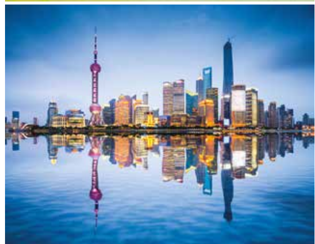
Muslim Street market, Xi'an (top); Sichuan teahouse; Towering Yangtze cliffs; Shanghai skyline (above)