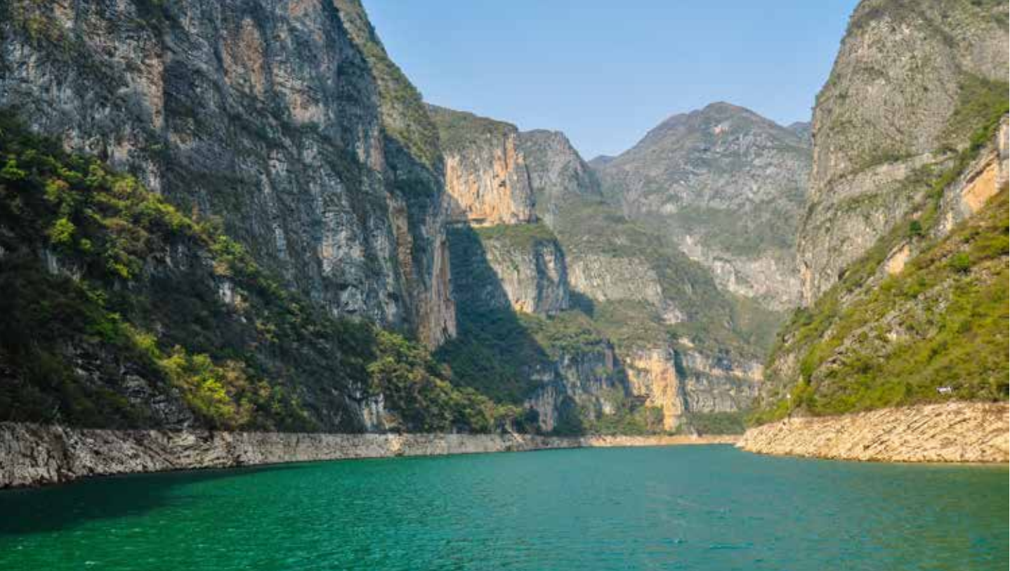
Cruise along the Three Gorges

This tour takes you on a journey through China's history, landscapes and culture while integrating a full dental professional programme. Journey from imperial Beijing onto the Silk Road city of Xi'an. Travel by high speed train into Sichuan where you will embark on a three-night cruise along the great Yangtze River, winding past some of China's most stunning scenery. The tour ends in the dynamic city of Shanghai.