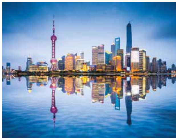
Muslim Street market, Xi'an (top); Sichuan teahouse; Towering Yangtze cliffs; Shanghai skyline (above)