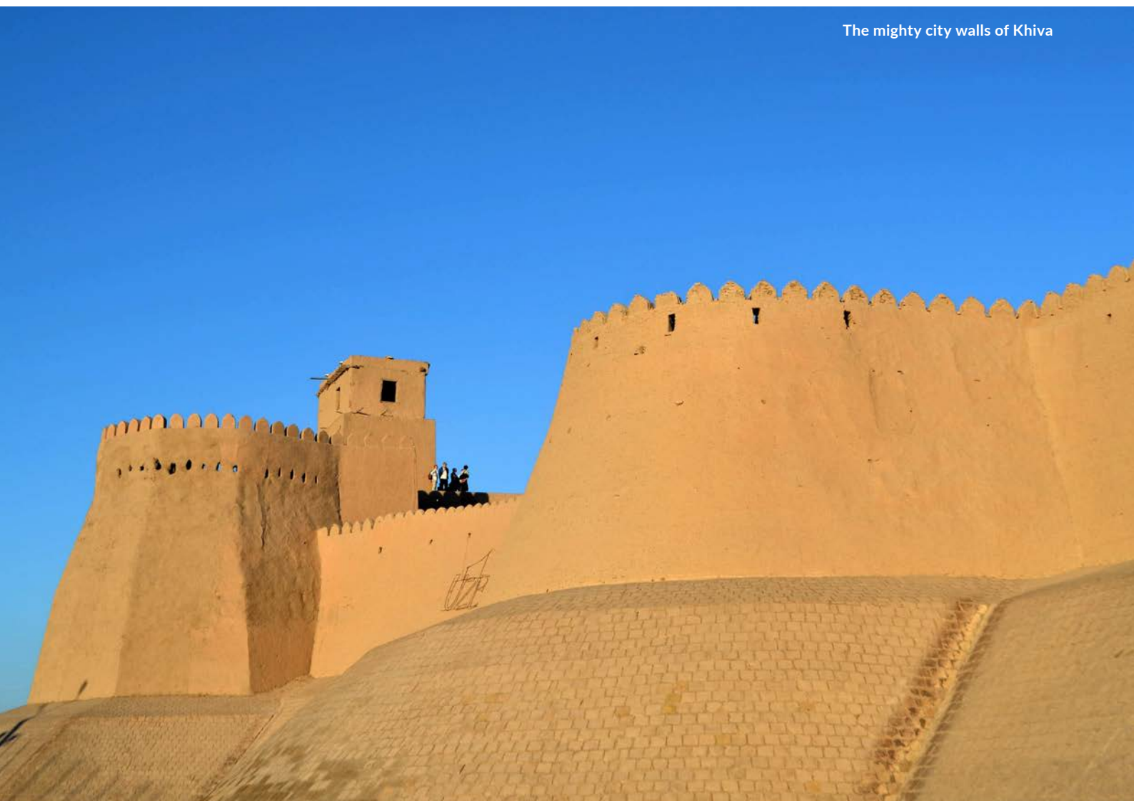
The mighty city walls of Khiva

Ashok is also an experienced and popular tour leader.