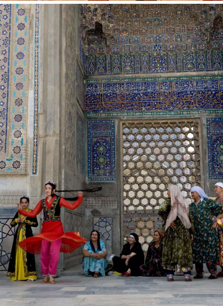
Samarkand dome (top); A dancer in Samarkand (above)

The ground only cost of the tour (excluding international flights and transfers) is USD $4,519