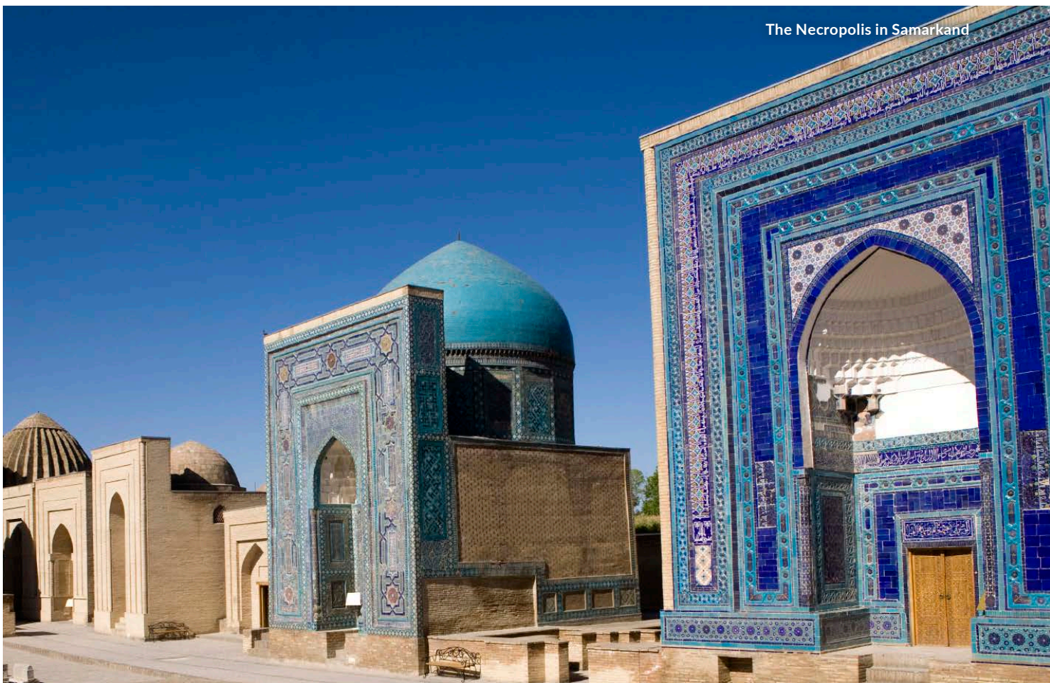
The Necropolis in Samarkand

NB: All itineraries are subject to change according to local conditions.