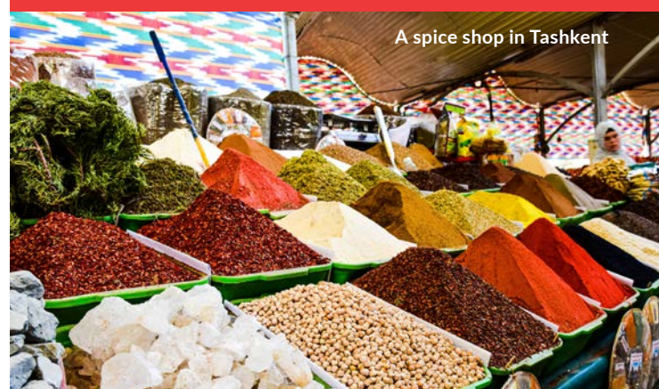
A spice shop in Tashkent