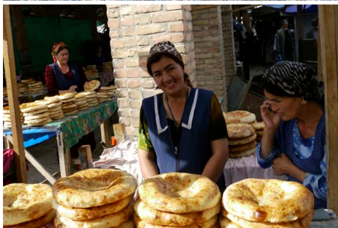
Traditional pottery in Bukhara (top); Lyab-i Hauz, Bukhara; The Registan in Samarkand; A local bread seller (above)