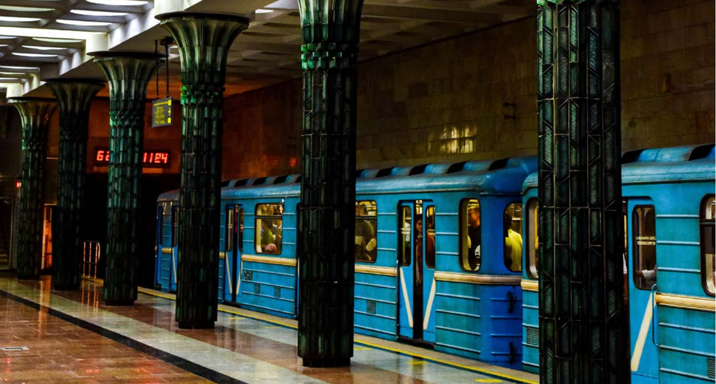
The Tashkent metro