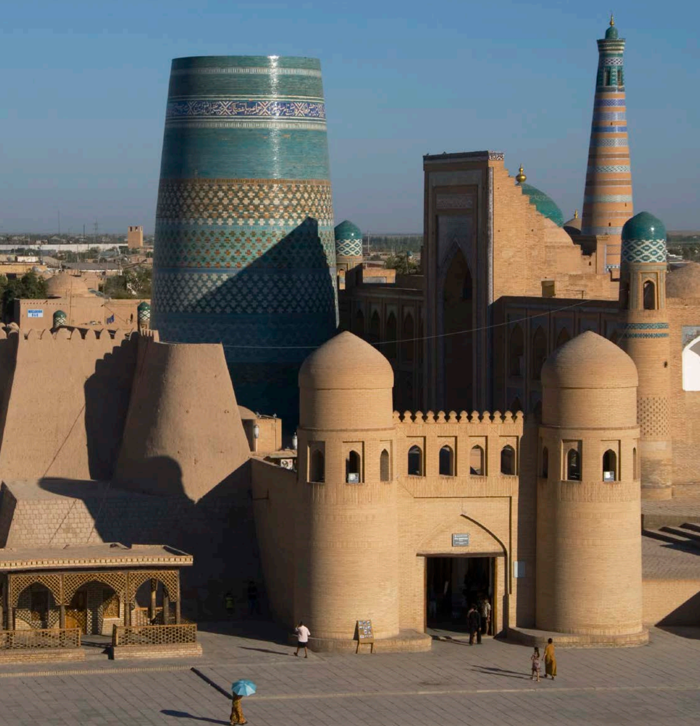
The beautiful city of Khiva

Uzbekistan is the land-locked heart of Central Asia's evocative Silk Road. The stunning architecture of its ancient cities links the empires of China and Persia, reflecting layers of history encompassing the giddy heights of culture as well as stories of conquest and trade.