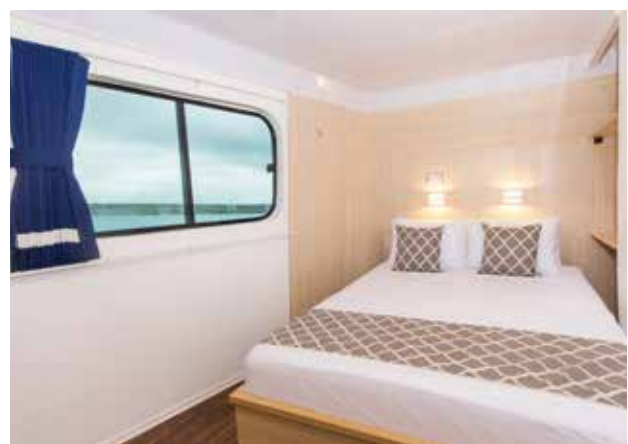
Sun deck dining area (top); Shaded seating area; Cabin (above)