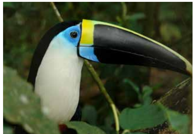
Inside a room at Sacha Lodge (top); A toucan in the Amazon (above)