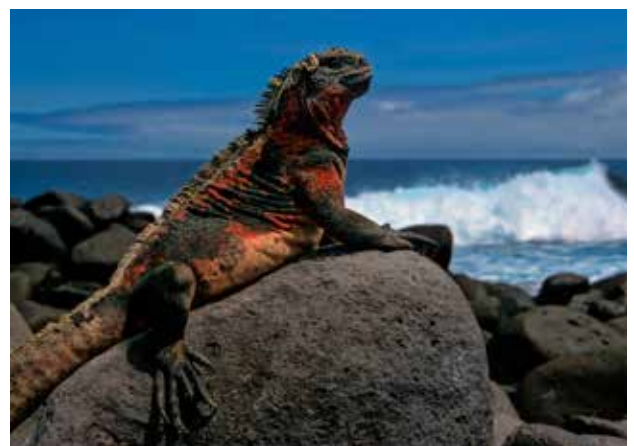
An imperious marine iguana

they they hunt during the day and nest at night. Waved albatross (the largest of the Galápagos birds) are also nesting. After the chick is about two weeks old, their parents will scavenge for fish and squid, which they will pre-digest to feed their young. While they are hunting, the chicks are left in small "nursery" groups. It is also mating season for California sea lions and Galápagos fur seals .