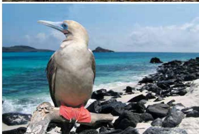
See condors in the Andes (top); The Andean highlands in Ecuador; A Galápagos giant tortoise; Red footed booby, Galápagos (above)

All the flights and flight-inclusive holidays in this brochure are financially protected by the ATOL scheme. When you pay you will be supplied with an ATOL Certificate. Please ask for it and check to ensure that everything you booked (flights, hotels and other services) is listed on it. Please see our booking conditions for further information or for more information about financial protection and the ATOL Certificate go to: www.atol.org.uk/ATOLCertificate