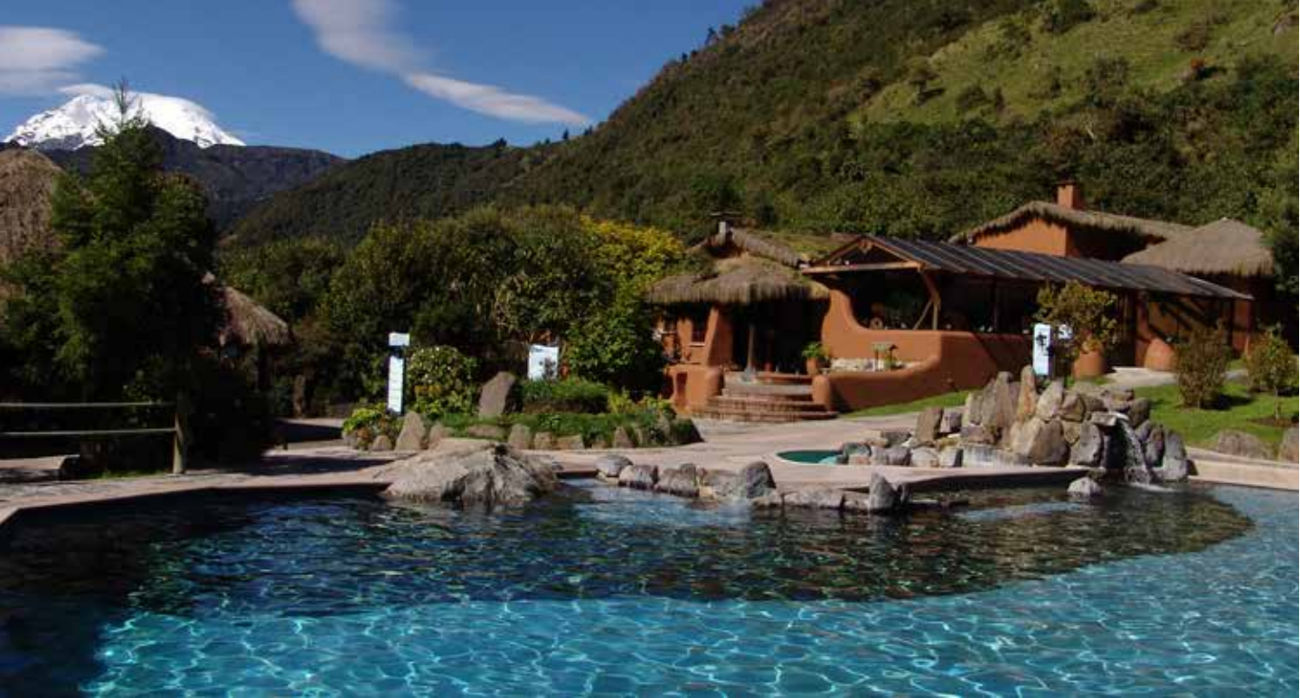
Termas de Papallacta Resort