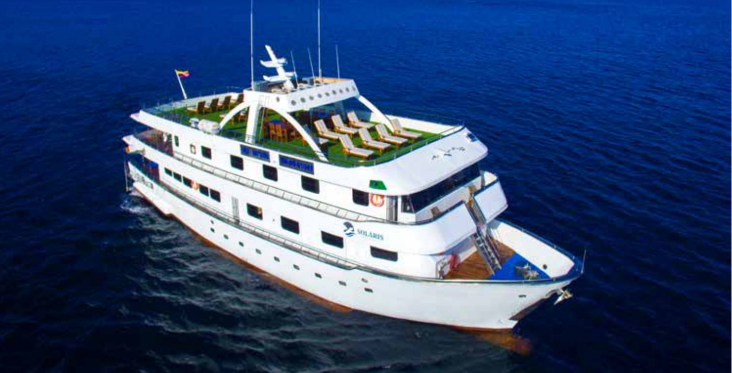
Solaris at sea