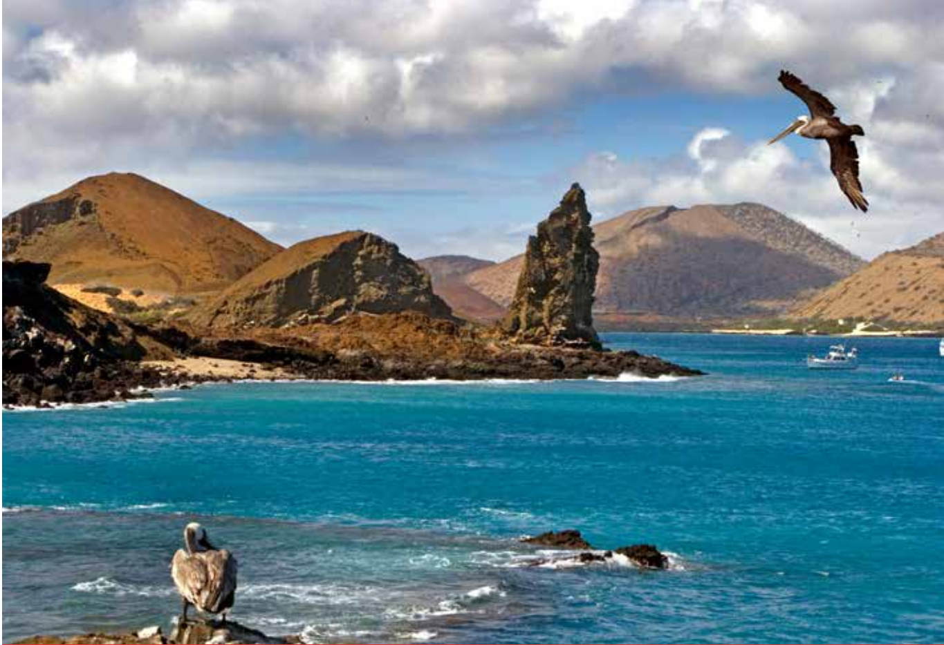
Pinnacle Rock, Bartolomé Island, Galápagos