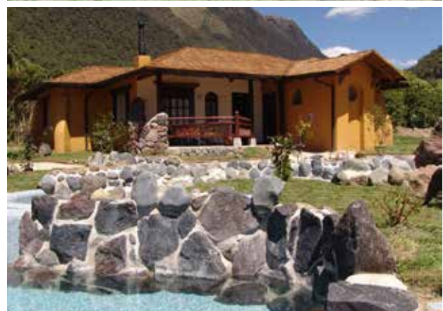
Sachatamia Lodge, Mindo (top); A cabin at Termas de Papallacta Resort (above)