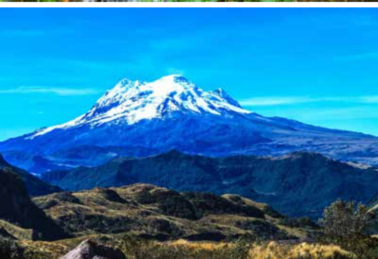
Rooftops of Quito (top); See the jewelled hummingbirds of Mindo; A waterfall in Mindo; Mount Antisana (above)

The cost of the tour is US $7,956 per person (excluding international flights and transfers)