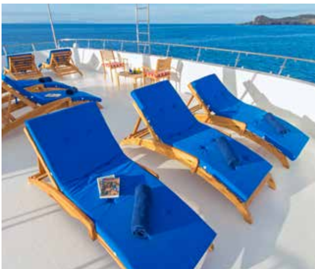
Sunbathe on the top deck