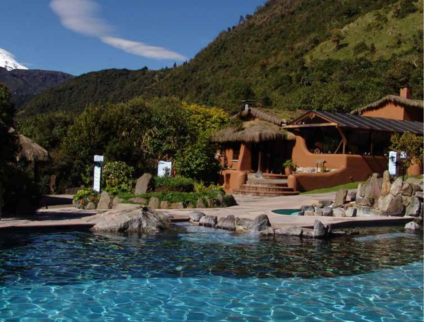
Termas de Papallacta Resort