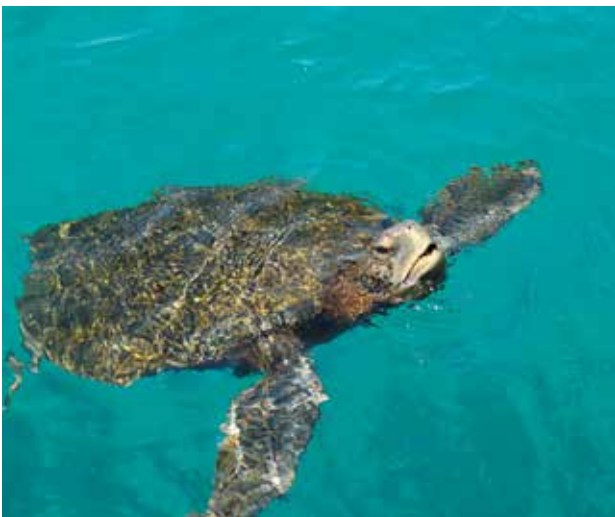
See the jewelled hummingbirds of Mindo (top); A waterfall in Mindo; Mount Antisana; A sea turtle in the Galápagos (above)

The cost of the tour is US $7,532 per person (excluding international flights and transfers)