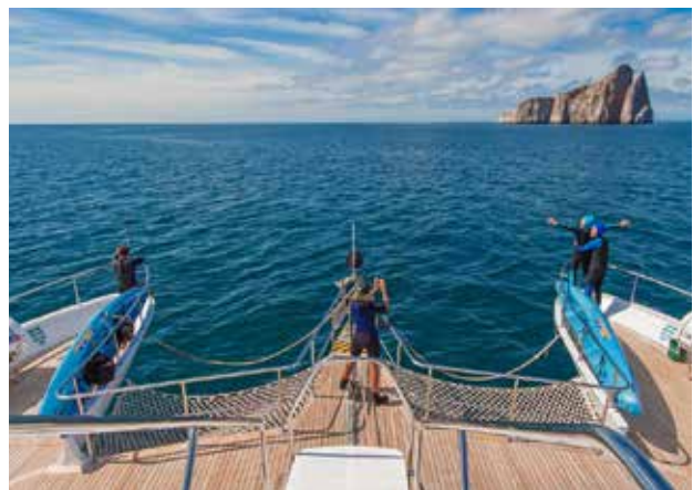
Relax on deck (top); A standard cabin; The view off the yacht (above)