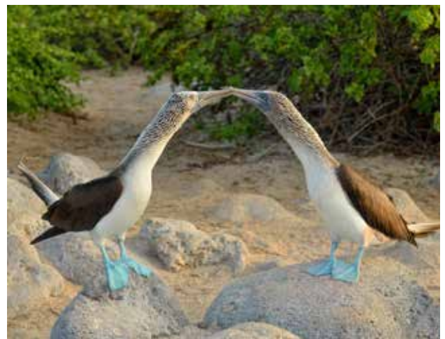
Blue footed boobies mating dance

magnificent frigatebirds on Genovesa and San Cristobal, who attract a mate by showing off their vivid red throat pouches. Waved albatross are laying eggs on Espanola Island.