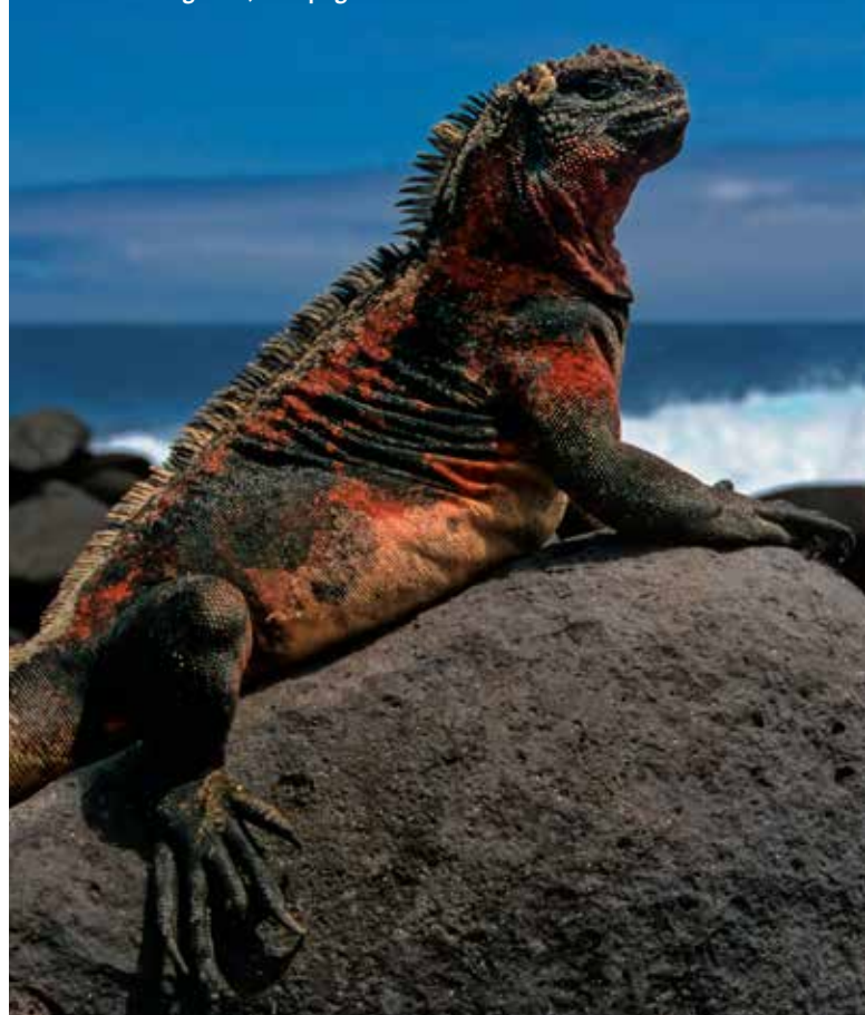
A red marine iguana, Galápagos