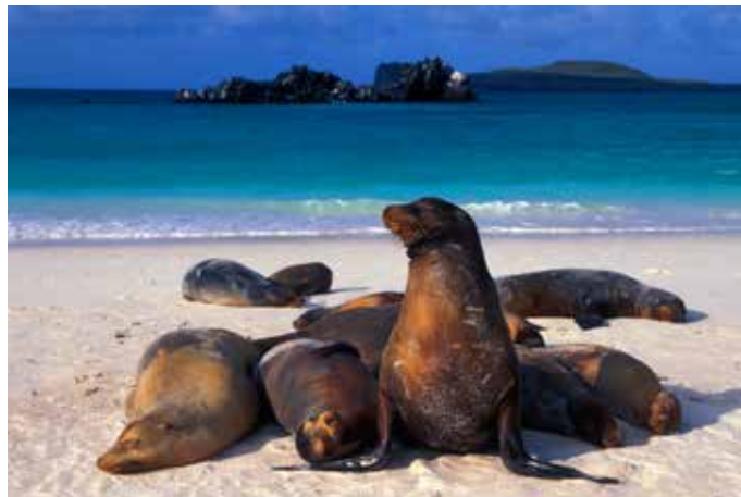
The courtyard of San Francisco Monastery, Quito (top); See condors in the Andes; A Galápagos giant tortoise; Basking sea lions (above)

All the flights and flight-inclusive holidays in this brochure are financially protected by the ATOL scheme. When you pay you will be supplied with an ATOL Certificate. Please ask for it and check to ensure that everything you booked (flights, hotels and other services) is listed on it. Please see our booking conditions for further information or for more information about financial protection and the ATOL Certificate go to: www.atol.org.uk/ATOLCertificate