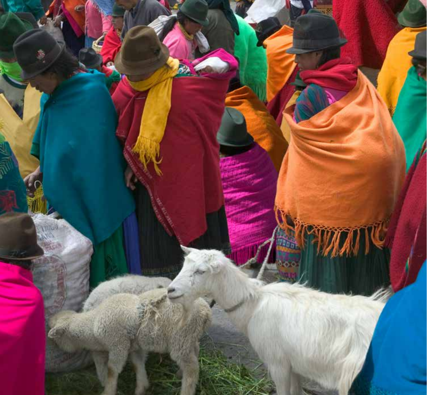
A traditional Andean market

Ecuador is a land of enormous cultural and natural diversity. Its cultural legacy encompasses the descendants of Spanish conquistadores and many distinct indigenous communities, markedly different in dress and lifestyle. Its bio-diversity is extraordinary, the jewel in its crown being the incomparable Galápagos Islands. The remote island group encompasses cool lava landscapes, cactus forests, lush green highlands, turquoise coves and perfect white sand beaches, and is the only place in the world where it is possible to swim with penguins and tropical parrot fish at the same time. There is also the option to extend at a luxury eco lodge in the Amazon jungle after the tour.