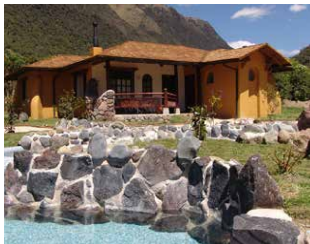
Sachatamia Lodge, Mindo (top); A cabin at Termas de Papallacta Resort (above)