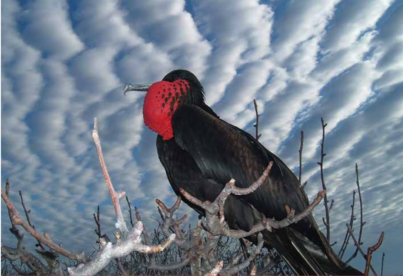
Magnificent frigate bird bird attracting mate by showing off his red throat pouch, Galápagos