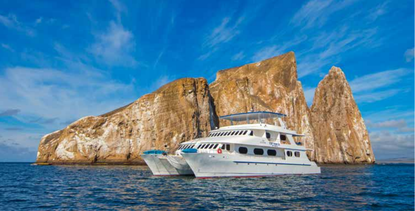
Tip Top II and Kicker Rock