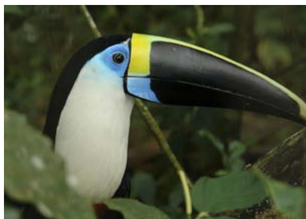
Inside a room at Sacha Lodge (top); A toucan in the Amazon (above)