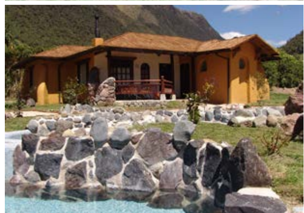
Sachatamia Lodge, Mindo (top); A cabin at Termas de Papallacta Resort (above)