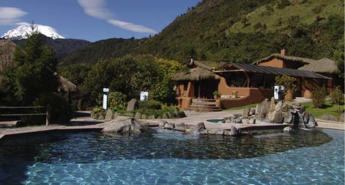
Termas de Papallacta Resort