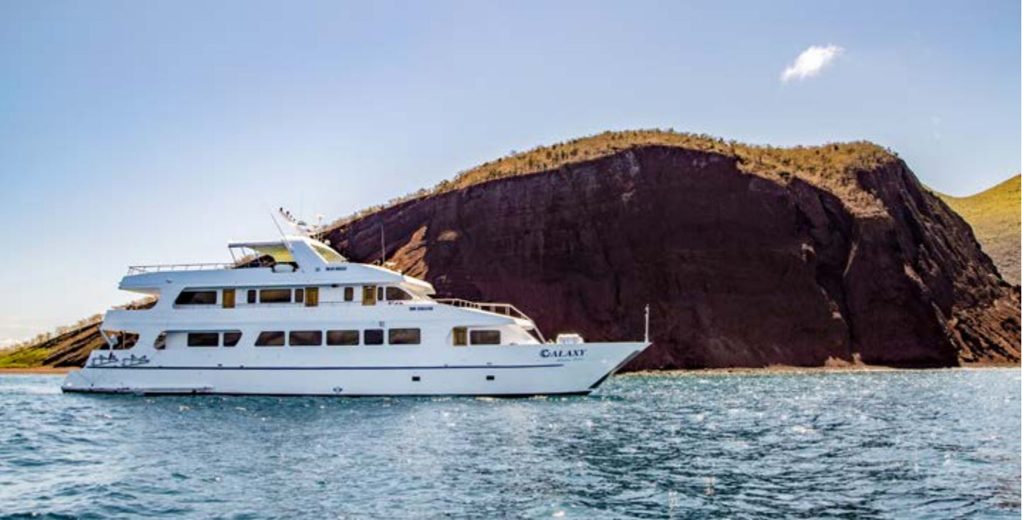
M/Y Galaxy at sea