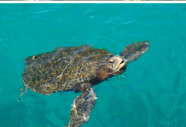
See the jewelled hummingbirds of Mindo (top); A waterfall in Mindo; Mount Antisana; A sea turtle in the Galápagos (above)