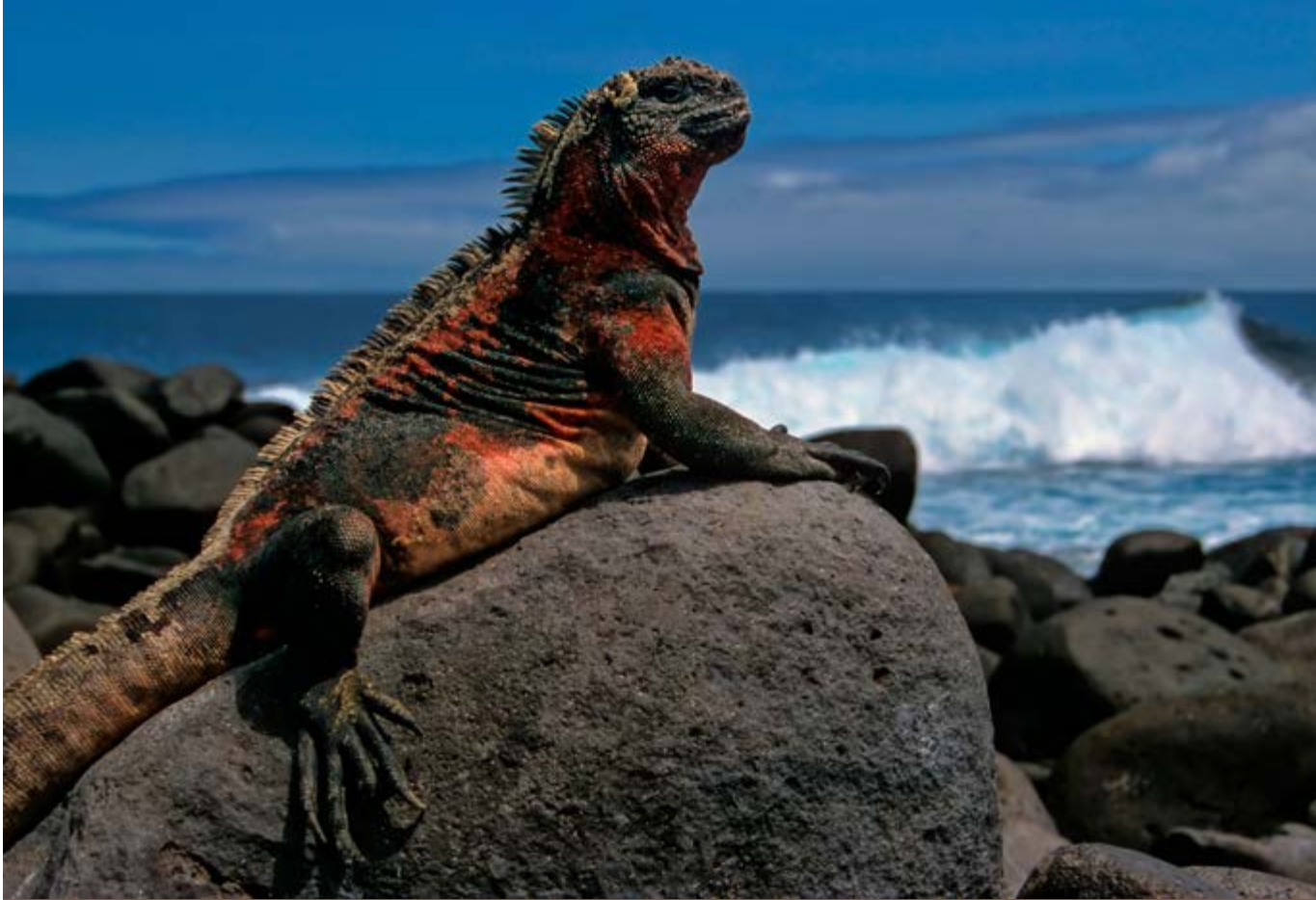
An imperious marine iguana, Galápagos