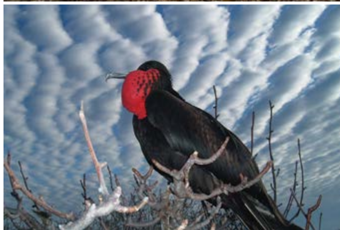
See condors in the Andes (top); The Andean highlands in Ecuador; A Galápagos giant tortoise; A magnificent frigatebird (above)