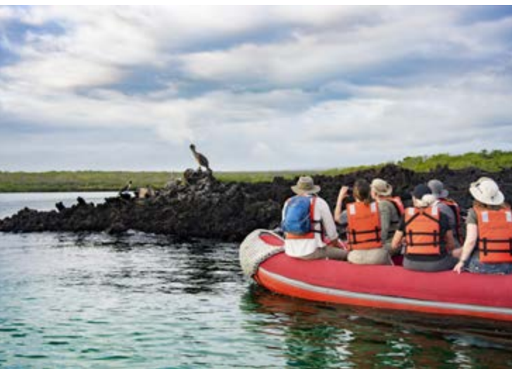
Activity in the Galapagos