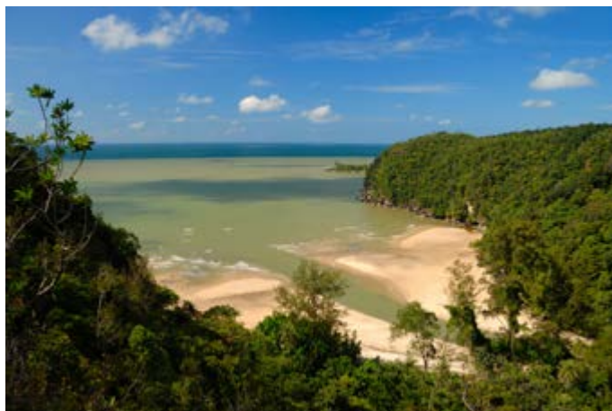
A market in Kuala Lumpur (top); Gardens by the Bay in Singapore; An orangutan in Semenggoh, Sarawak; Visit beautiful Bako National Park (above)