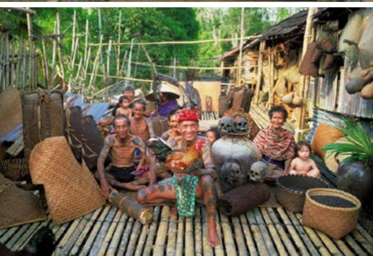
Tunnel boring machine in Kuala Lumpur (top); Kuching riverfront; The world's largest pewter mug at Royal Selangor; Visit Anah Rais longhouse, Sarawak (above)

Tour cost: US $4,617 per person sharing (excluding international flights and transfers)