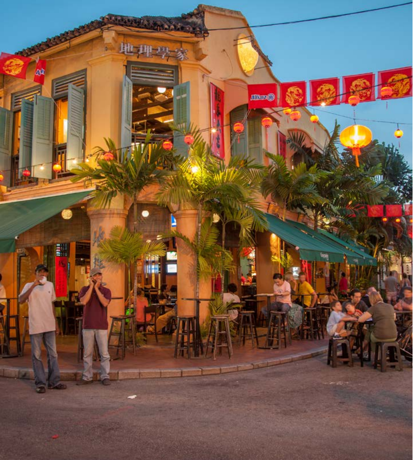
The colourful streets of Malacca

From gleaming metropolises to colonial cities and the vast jungles of Borneo, this study tour cuts a broad swathe through Malaysia, Singapore and Borneo as it examines cutting edge civil and mechanical engineering, both contemporary and historic, in these regions. Along the way take part in wide-ranging specialist visits