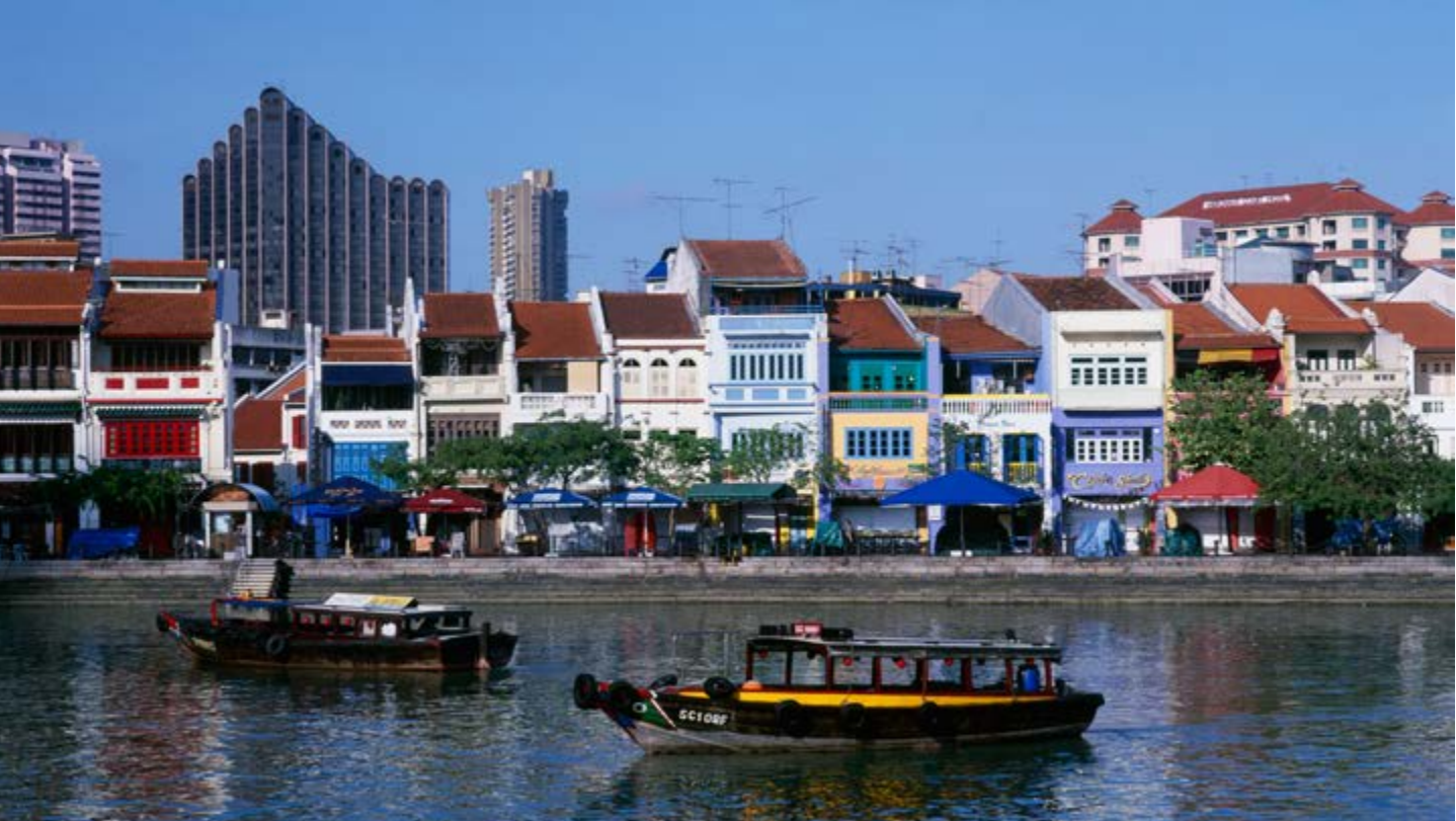
Clarke Quay, Singapore