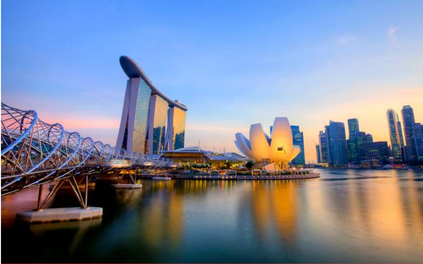
The skyline of modern Singapore