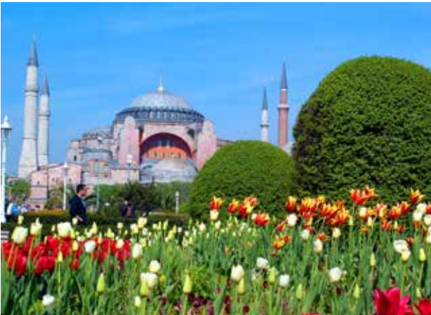
Bosphorus at night (top); Aya Sophia (above)