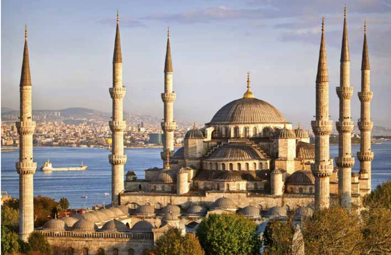
The Blue Mosque, Istanbul