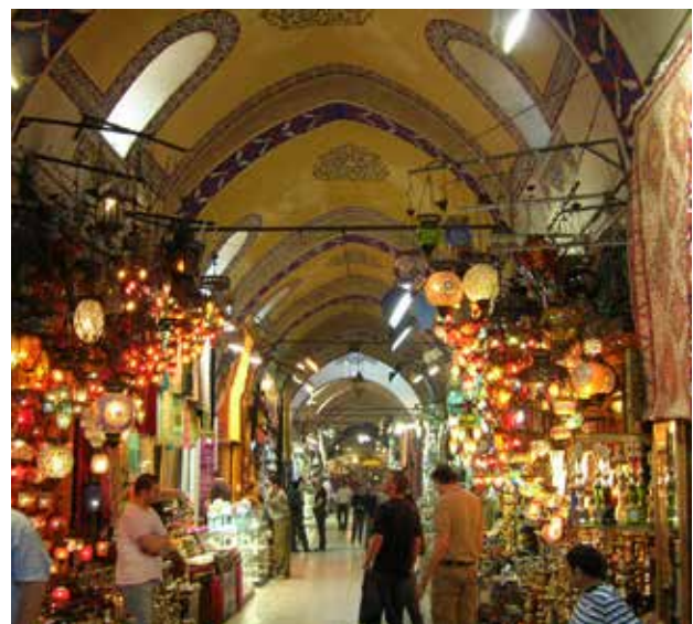
The Grand Bazaar

Next morning travel to the Blue Mosque, a triumph of harmony, proportion and elegance. Built in 1603, the 'blue' of the mosque refers to the superb Iznik tiles that line the walls. Visit Topkapi Palace, the residence of Ottoman sultans for almost four centuries and a dazzling display of royal Islamic architecture, and the spectacular underground Roman cisterns nearby.