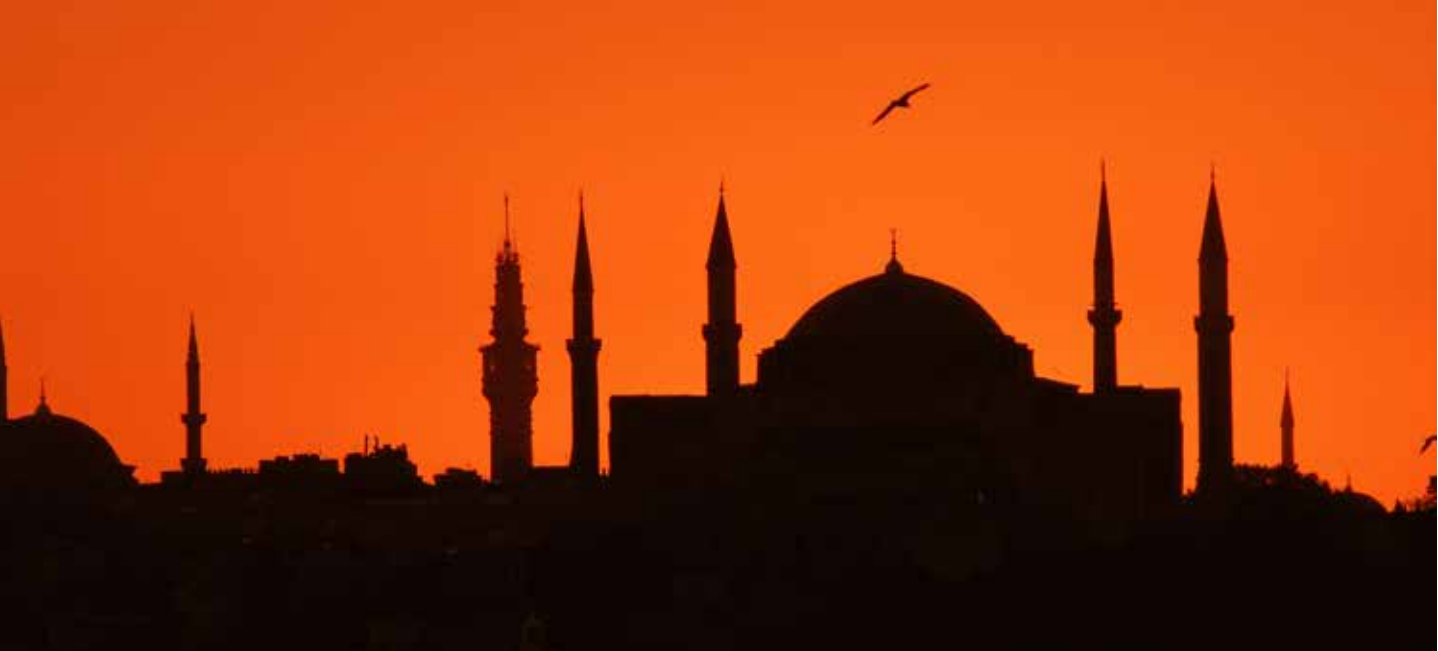
Sunset in Sultanahmet

Istanbul's history is as richly layered as one of its baklava pastries. The only city in the world that spans two continents, it is a bewitching dust-devil of cultures and influences spanning thousands of years. Follow in the footsteps of Florence Nightingale and see her story come alive in this fascinating city where you can step from Asia into Europe and back against a skyline studded with domes and slender haunting minarets.