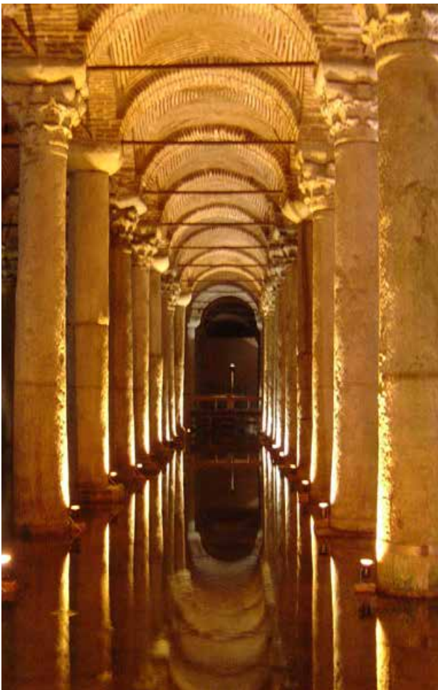
Süleymaniye Mosque (top); Underground Cistern (above)

The flight inclusive price from London is USD $1,747 per person