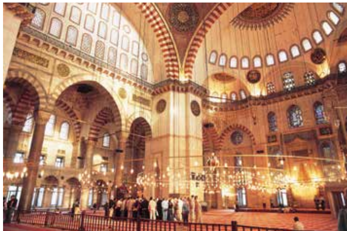
Spices (top); Scutari, Istanbul; Sultanahmet from the Bosphorus; The Grand Bazaar; Aya Sophia (above)

All the flights and flight-inclusive holidays in this brochure are financially protected by the ATOL scheme. When you pay you will be supplied with an ATOL Certificate. Please ask for it and check to ensure that everything you booked (flights, hotels and other services) is listed on it. Please see our booking conditions for further information or for more information about financial protection and the ATOL Certificate go to: www.atol.org.uk/ATOLCertificate