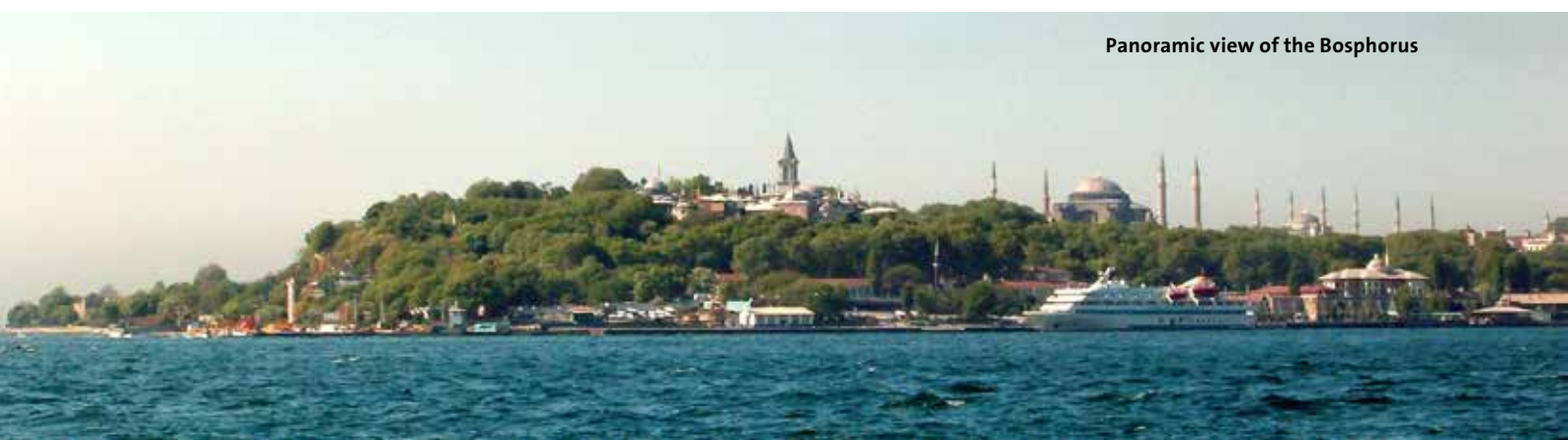
Panoramic view of the Bosphorus