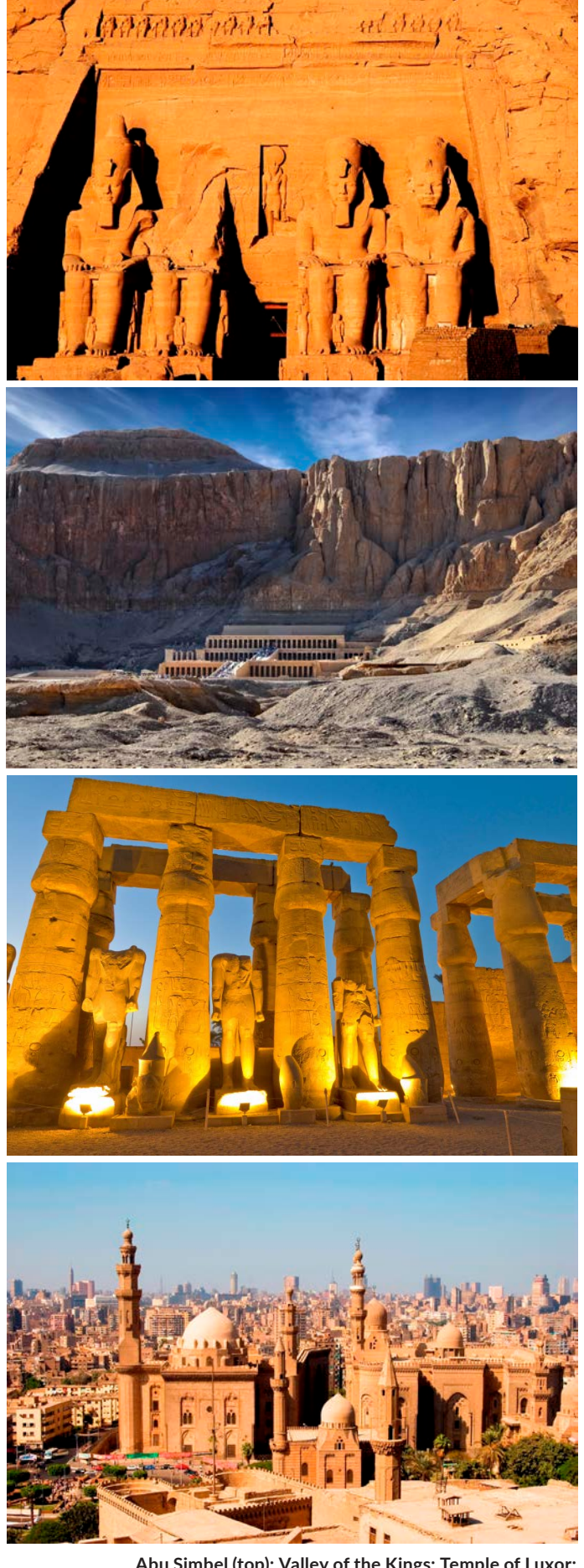
Abu Simbel (top); Valley of the Kings; Temple of Luxor; Rooftops of Cairo (above)

Jon Baines Tours (Melbourne) PO Box 68, South Brunswick, Victoria 3055 Tel: +61 (0) 3 9343 6367 Fax: +61 (0) 3 9012 4228 Email: info@jonbainestours.com.au www.jonbainestours.com