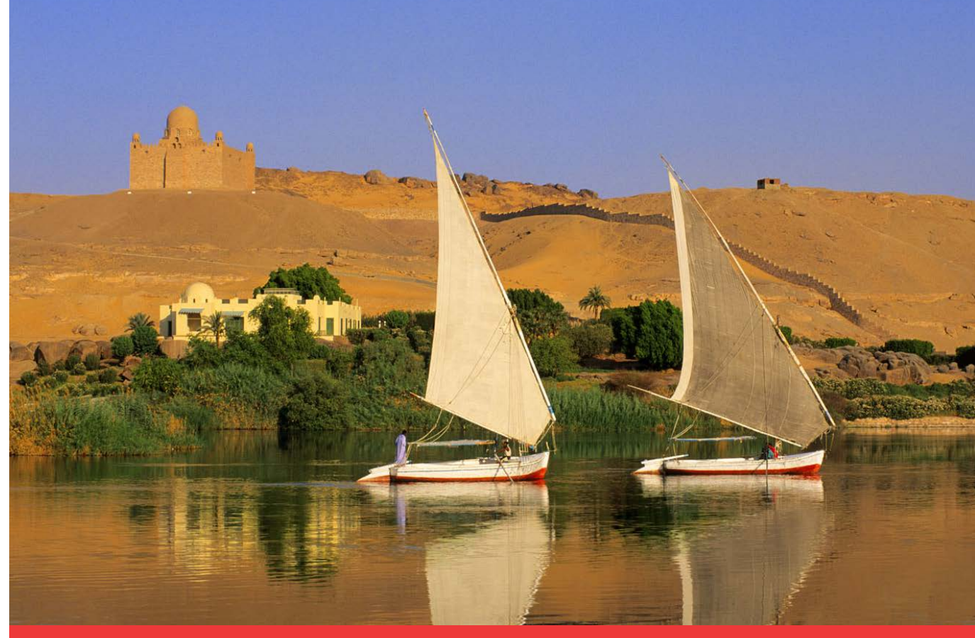
Feluccas on the River Nile, Aswan