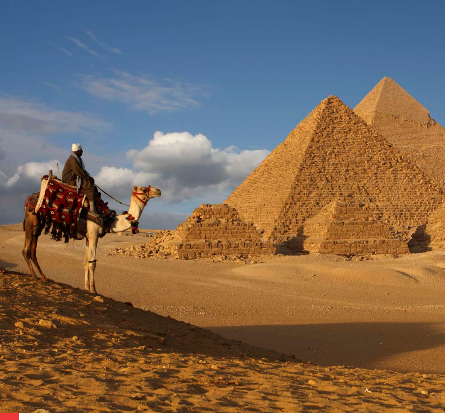
The Pyramids at Giza

The Nile has been the repository of stories for millennia. Hear these ancient tales as you cruise in comfort to Egypt's most fascinating destinations, learning about Egyptian history of medicine aboard the deluxe MS Nile Goddess river cruiser.