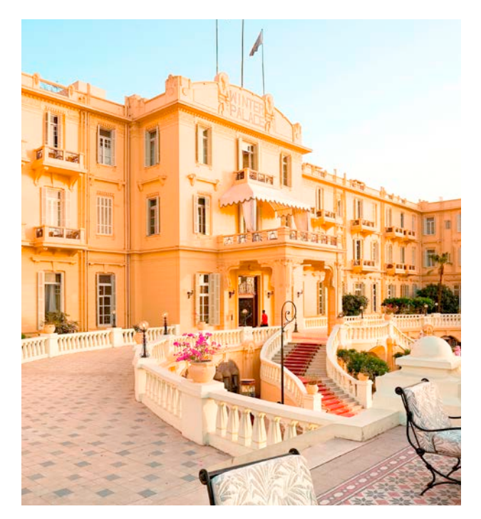
The Winter Palace Luxor

The Nile Goddess features 47 spacious cabins, 2 Senator Suites and 4 Presidential Suites with private terrace. All cabins feature panoramic windows, private telephone, hairdryer, safe, mini-bar, music system, plasma televisions, individual climate control, bathroom with full-size bathtub. Wireless internet access is available throughout the ship and in all cabins (with charge). Please contact us to reserve cabin upgrades and for further information.