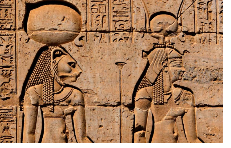
Hieroglyphics, Kom Ombo Temple