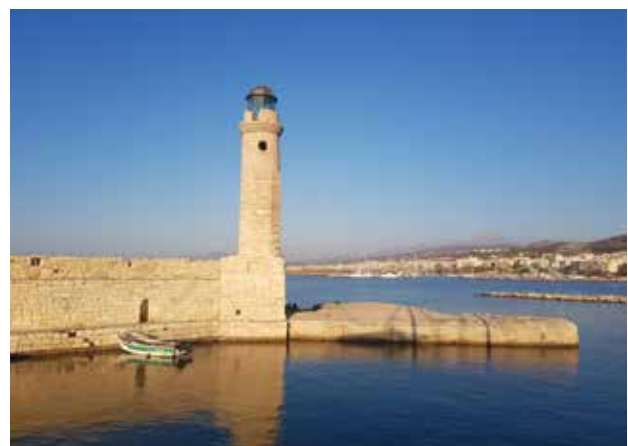
The Egyptian lighthouse

Located at the corner of our hotel, these spacious suites (42 square metres) offer an amazing panoramic view of the old town and the Venetian port, Lefka Ori Mountains and the Cretan Sea. Each suite has a separate spacious living room. Additional cost per room for the five nights USD $694.