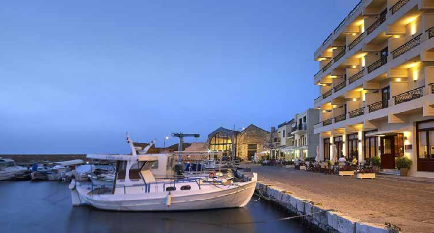
The Hotel Porto Veneziano