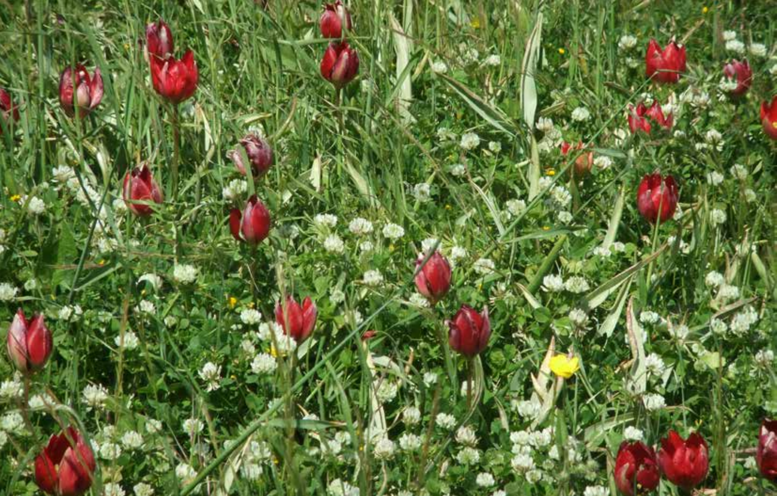
Tulipa doerfleri (endemic wild tulips)