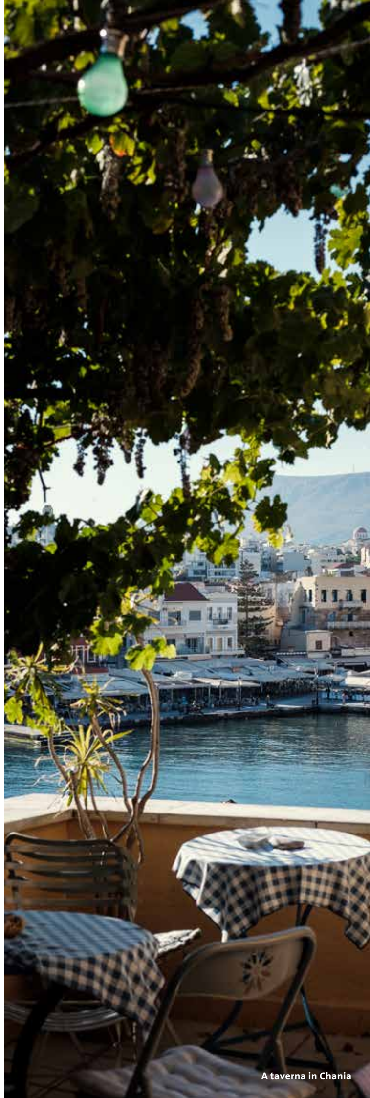
A taverna in Chania

* As a general note, there can be no guarantee about precise flowering times, due to the nature of spring.