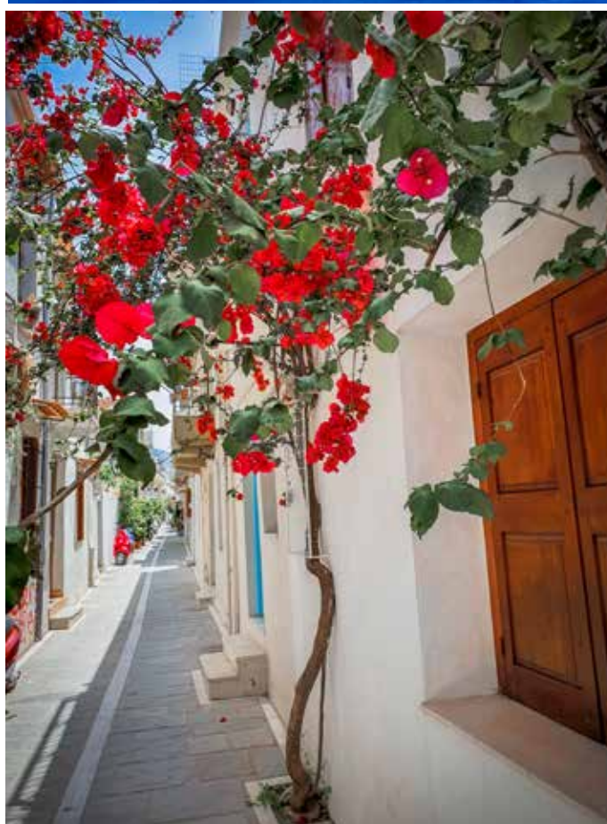
In the botanical garden (top); Blue vistas of Crete; A Flower-filled street in Chania (above)