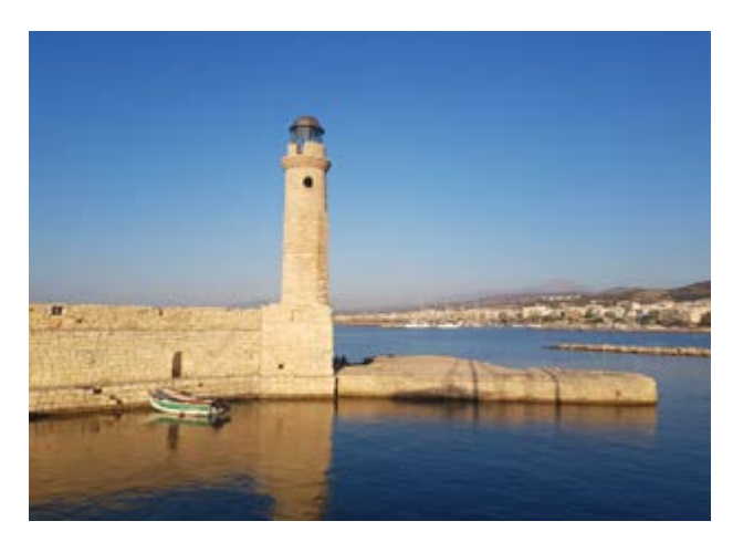
The Egyptian lighthouse

Located at the corner of our hotel, these spacious suites (42 square metres) offer an amazing panoramic view of the old town and the Venetian port, Lefka Ori Mountains and the Cretan Sea. Each suite has a separate spacious living room. Additional cost per room for the five nights USD $694 .