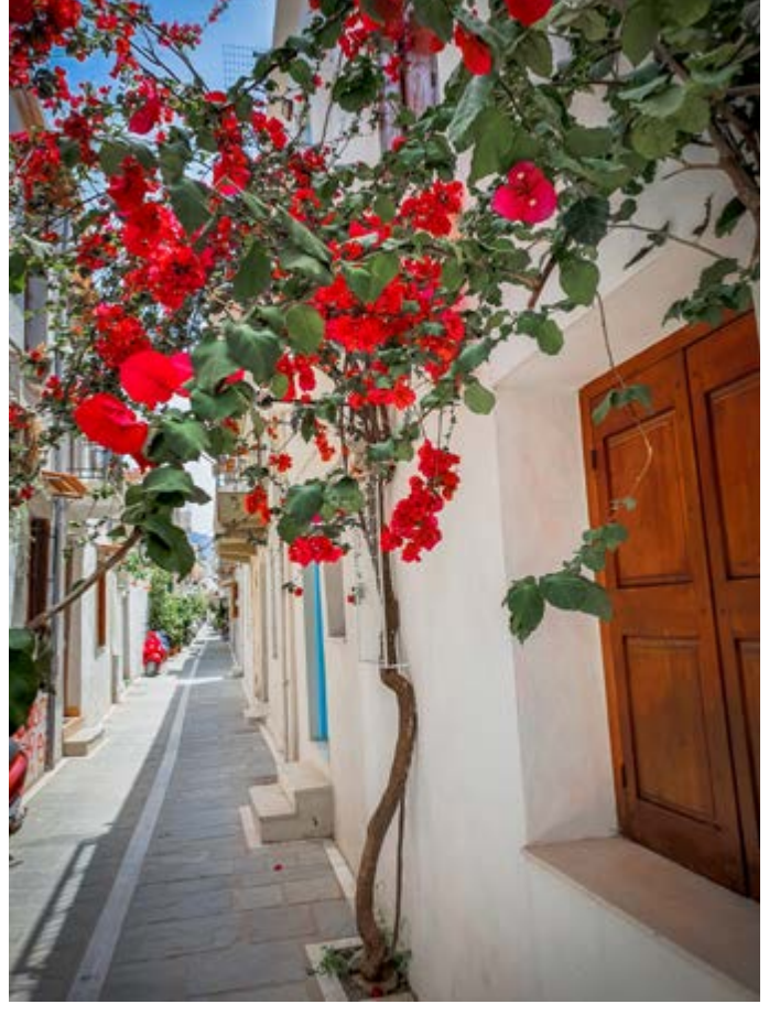
In the botanical garden (top); Blue vistas of Crete; A Flower-filled street in Chania (above)