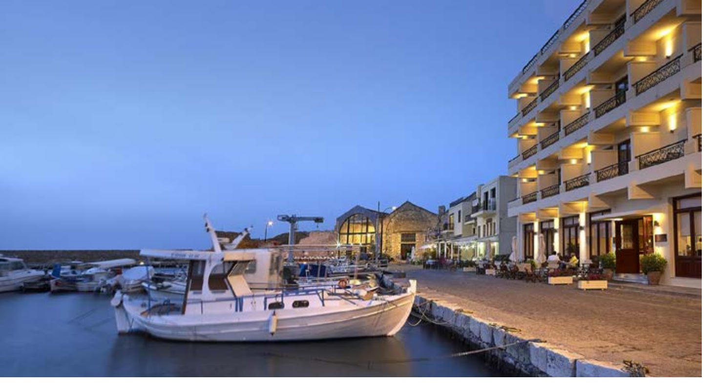
The Hotel Porto Veneziano