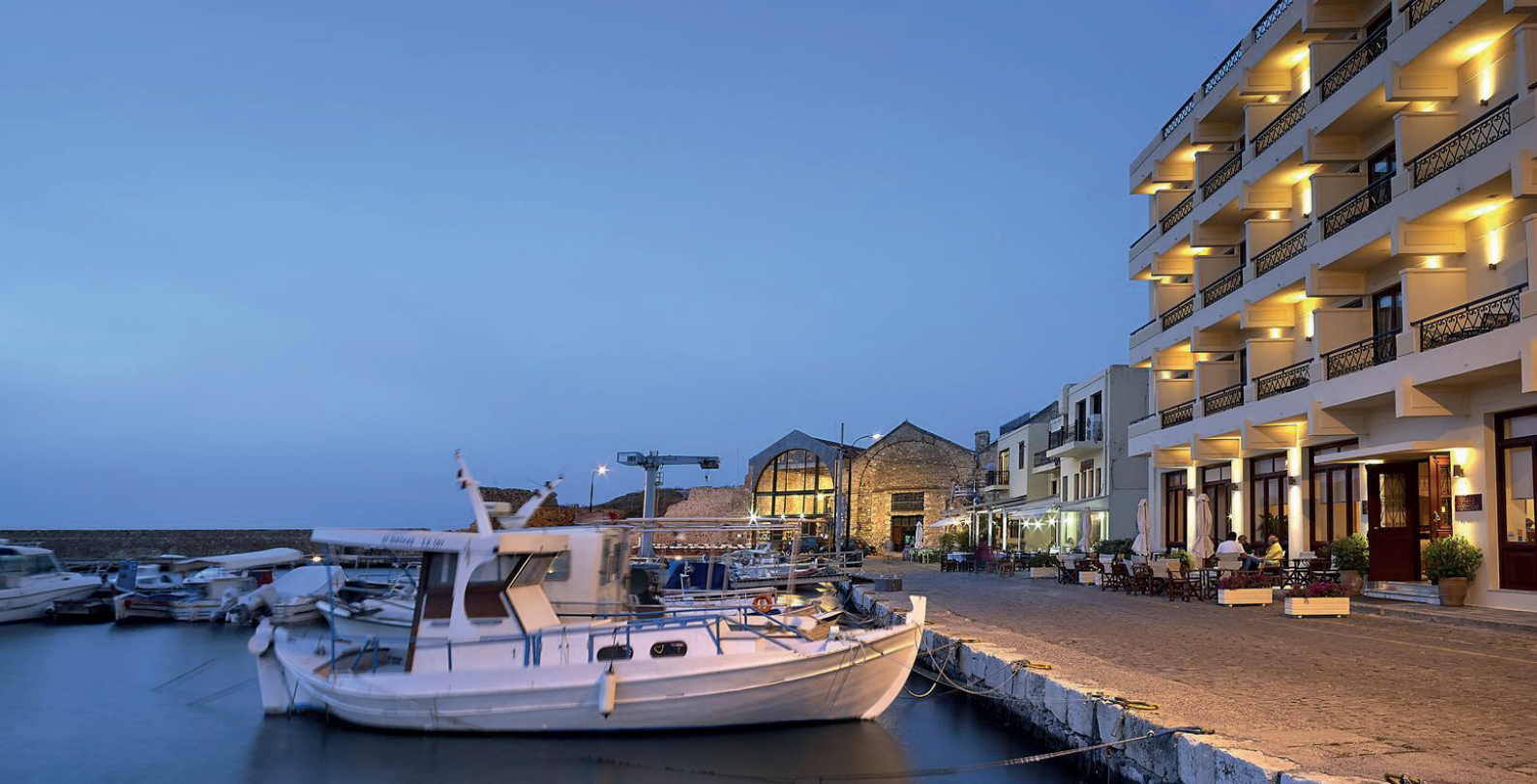
The Hotel Porto Veneziano