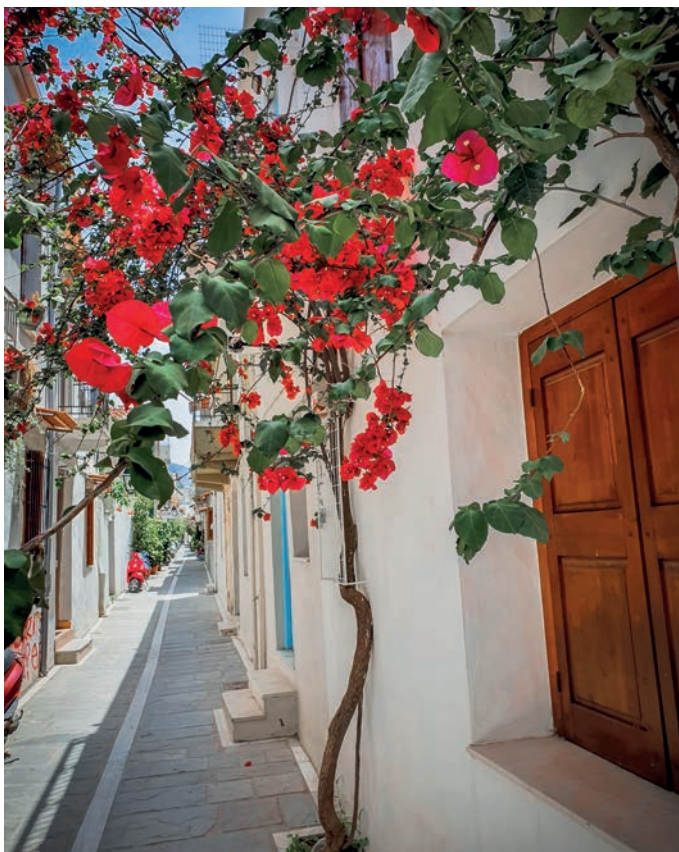
In the botanical garden (top); Blue vistas of Crete; A flower-filled street in Chania (above)