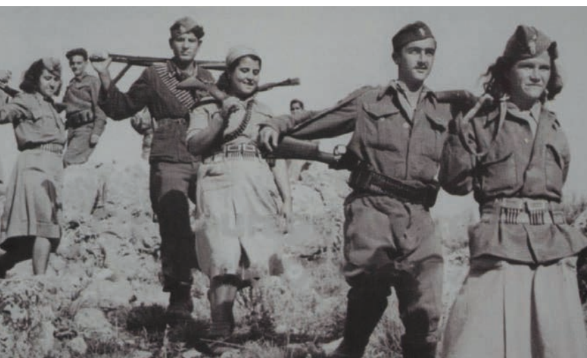
Wildflowers in full bloom (top); Sample the wines of Crete; Frescoes at Knossos Palace; The local resistance during the Battle of Crete (above)

The cost of the tour is $2,226 per person sharing