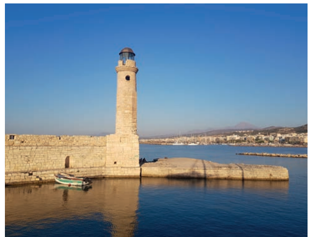
The Egyptian lighthouse

Superior Sea View Suites are 42 square metres and offer an amazing panoramic view of the old town and the Venetian port, Lefka Ori Mountains and the Cretan Sea. Each suite has a separate spacious living room. Additional cost per room for the six nights is $1,203 .