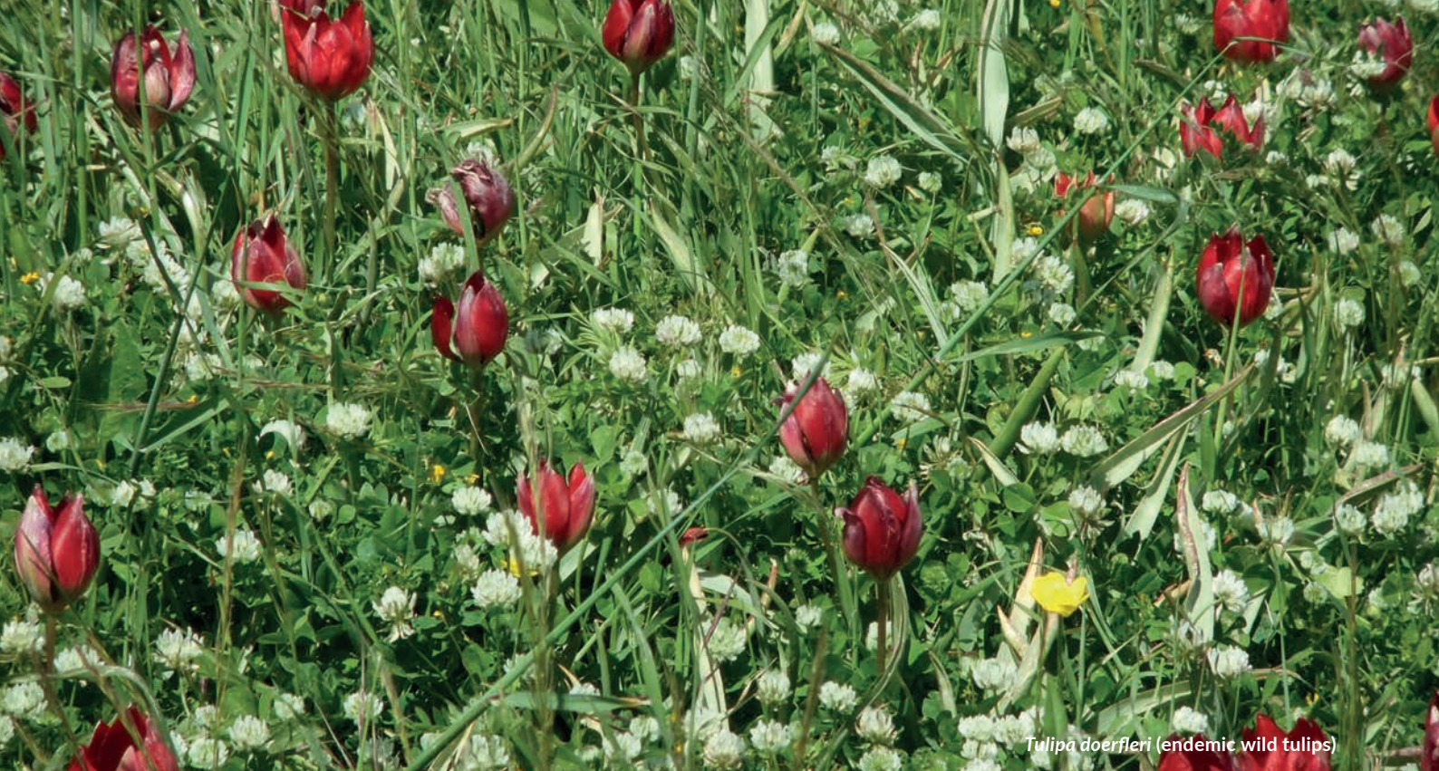
Tulipa doerfleri (endemic wild tulips)