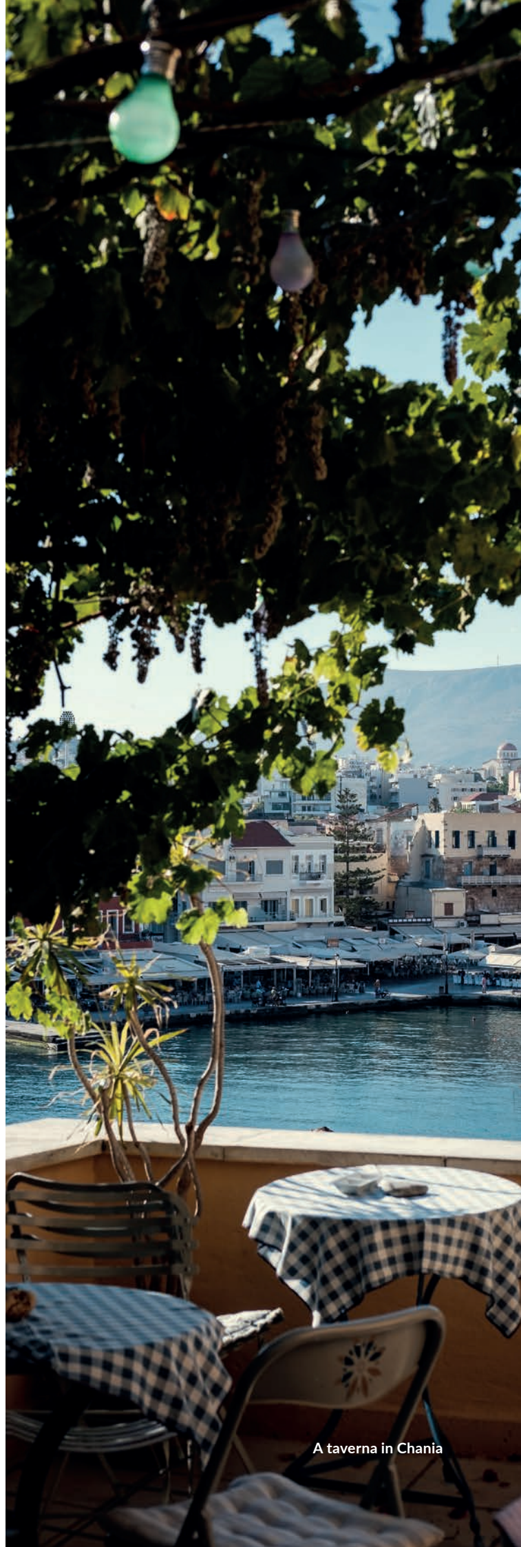
A taverna in Chania

*As a general note, there can be no guarantee about precise flowering times. All itineraries are subject to change according to local conditions.