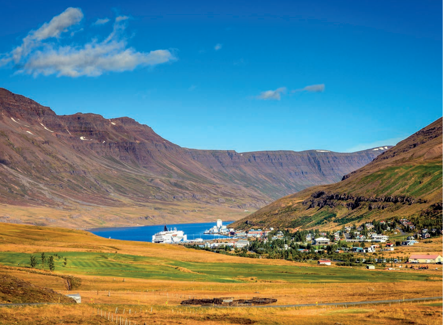
Visit Seyðisfjörður in the Eastfjords