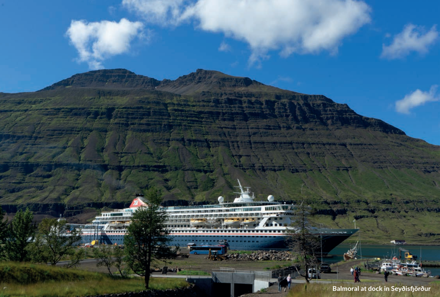
Balmoral at dock in Seyðisfjörður