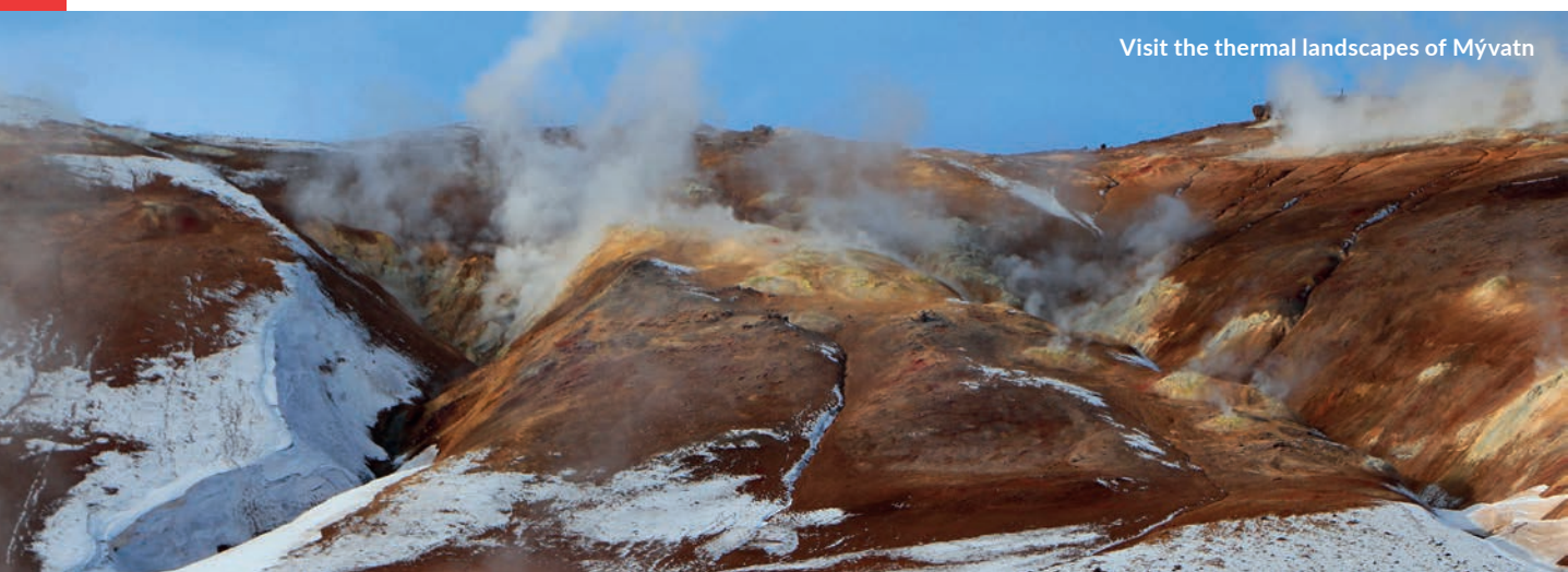
Visit the thermal landscapes of Mývatn

Named after the Scottish residence of the British Royal Family, Balmoral features just 710 guest cabins and retains the warm and friendly atmosphere that the Fred Olsen fleet is renowned for. There are special social gatherings and afternoon teas, several of which are included in your itinerary.