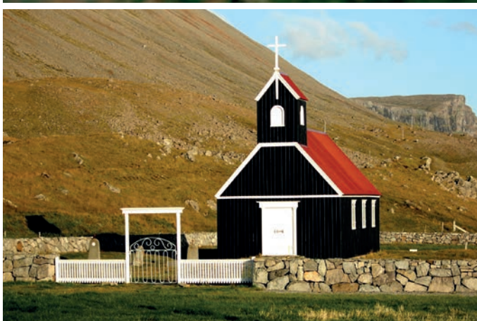
Icelandic ponies (top); Akureyri; Puffins; Typical Westfjords architecture (above)