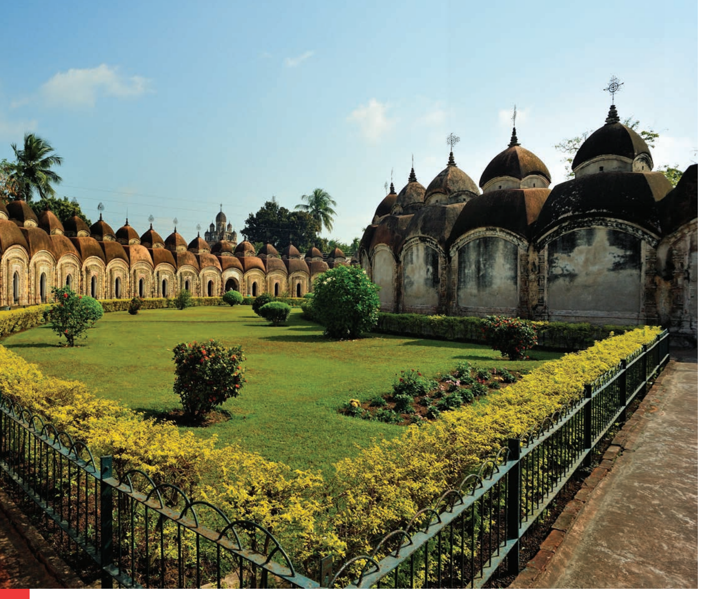
The terracotta Shiva temples at Kalna

The Hooghly River is the main artery running through the history of Bengal. Kolkata was founded on the banks of the river in 1690 as a British trading outpost of the Mughal Empire. Not only was Kolkata the centre of the Raj until 1911, when the capital moved to Delhi, but it has long been a hub of Bengali literature, music and philosophy. Bengal was the richest province in India for a time, its lush soil producing indigo, opium and rice crops, among others, and its exquisite textiles were known as 'woven wind'.