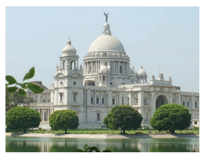
The Victoria Memorial, Kolkata

All itineraries are subject to change according to local conditions.