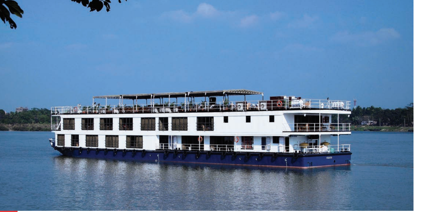
ABN Rajmahal on the Hooghly