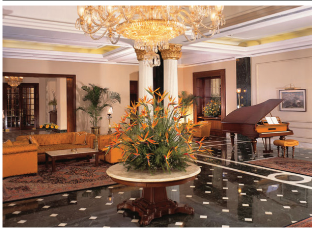
ABN Rajmahal on the Hooghly (top); The ABN Rajmahal dining room; The Oberoi Grand Hotel; The Oberoi Grand lobby (above)