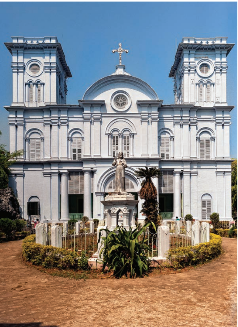
Katgola Palace (top); Sacred Heart Church at Chandernagore (above)