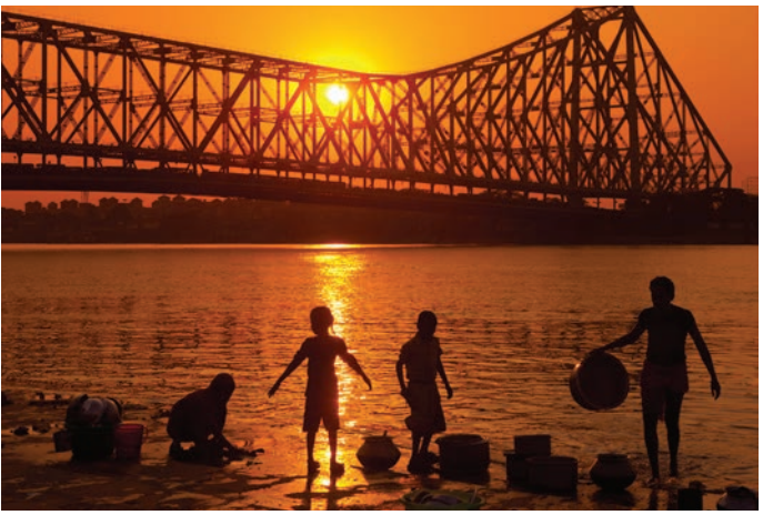
A brassworker in Matiari (top); The flower market, Kolkata; Boy washing his water buffalo on the river; The Howrah Bridge on the Hooghly (above)