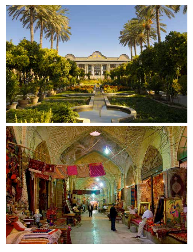
Naranjestan Palace, Shiraz (top); Wander through Vakil Bazaar in Shiraz (above)

Bagh-i-Eram gardens and the garden and tomb of the mystic poet Hafiz, before taking tea at a traditional teahouse above Koran Gate for superb city views.