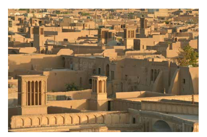
Rooftops in Yazd

Drive to Isfahan, visiting the old Zoroastrian centre of Meybod on the way. It is famous today for its domestic pottery using beautiful traditional colours and styles. In the afternoon, visit the camel hair weaving workshops of Mohammediyeh, a textile town punctuated by the constant clacking of looms. In nearby Na'in, visit the superb Ethnographic Museum, housed in a wonderful Safavid house from 1560, before continuing onto Isfahan.