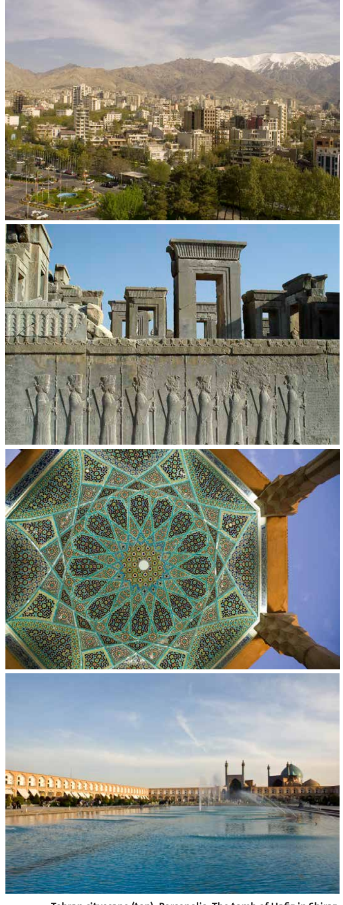
Tehran cityscape (top); Persepolis; The tomb of Hafiz in Shiraz; Royal Square, Isfahan (above)

Jon Baines Tours (Melbourne) PO Box 68, South Brunswick, Victoria 3055 Tel: +61 (0) 3 9343 6367 Fax: +61 (0) 3 9012 4228 Email: info@jonbainestours.com.au www.jonbainestours.com