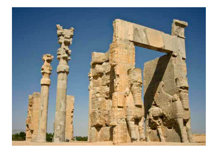
The Gate of All Nations, Persepolis

Fly to Shiraz, traditionally known as the city of nightingales, poetry and roses (and, at one time, wine made from its world- famous grapes), which retains a relaxed provincial feel in spite of its size and vivacity. There is never enough time to see all of Shiraz's attractions, but you make an excellent start with a visit to the beautiful