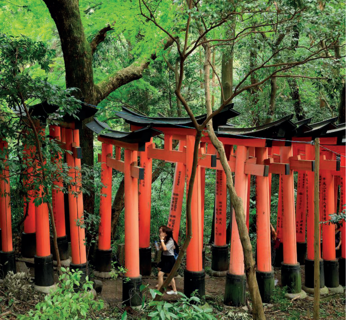
Walk through Fushimi Inari in Kyoto

Japan is a blend of gracious tradition, exquisite ritual and hyper modernity. Experience the different facets of this exceptional country, seeing its culture, society and history through the prism of your own profession.