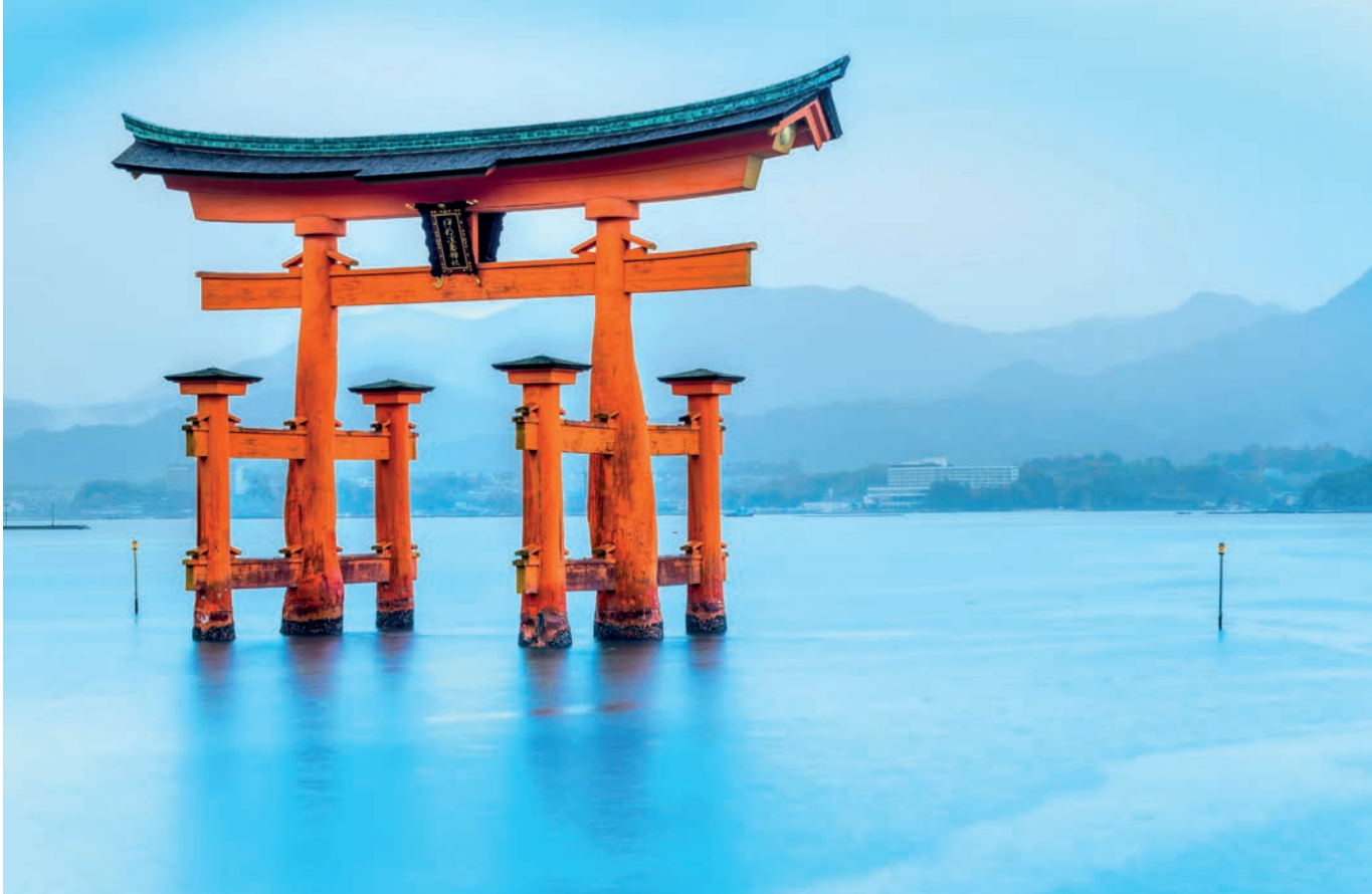
Torii Shrine, Inland Sea