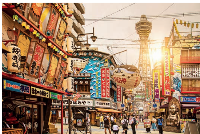
Golden Pavilion, Kyoto (top); Hiroshima Peace Park; Geishas in Kyoto; Namba District, Osaka (above)