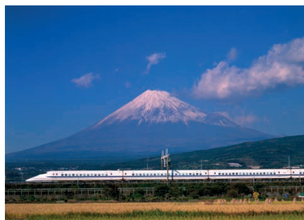
Travel by bullet train

The pre tour extension visits the Mount Fuji region. There is the option to stay on in Japan and we can assist with additional accommodation or a trip to historic Mount Koya.