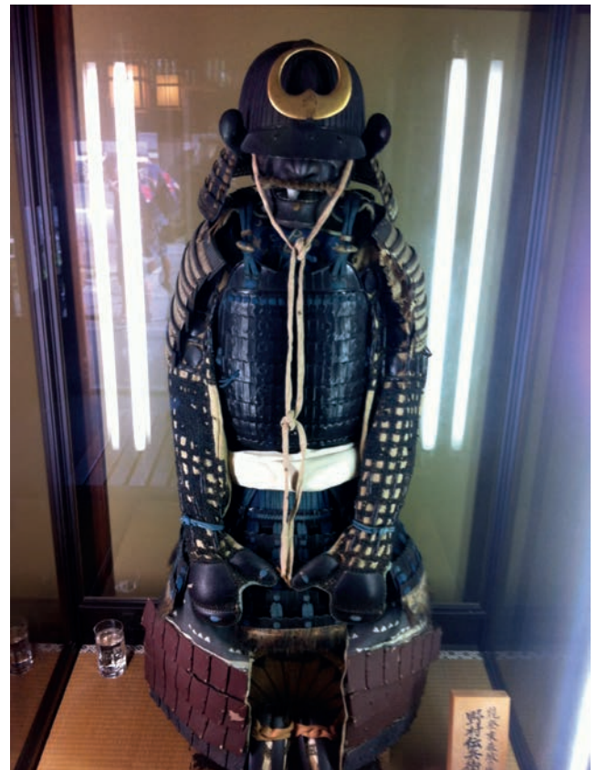
Samurai armour in Kanazawa

“Exceptional itinerary and exemplary tour guide Coco.”