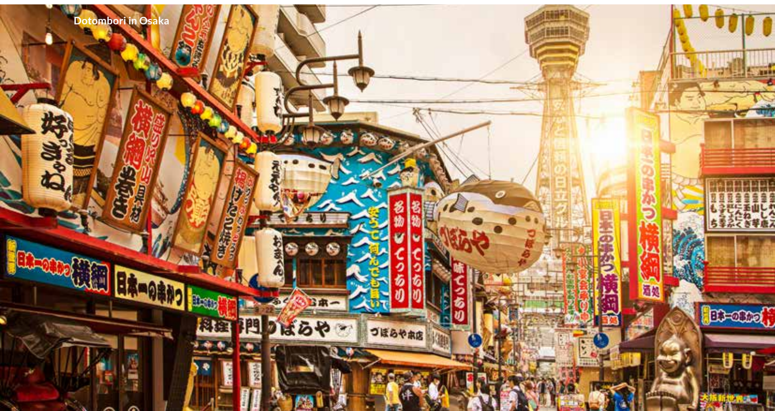
Dotombori in Osaka