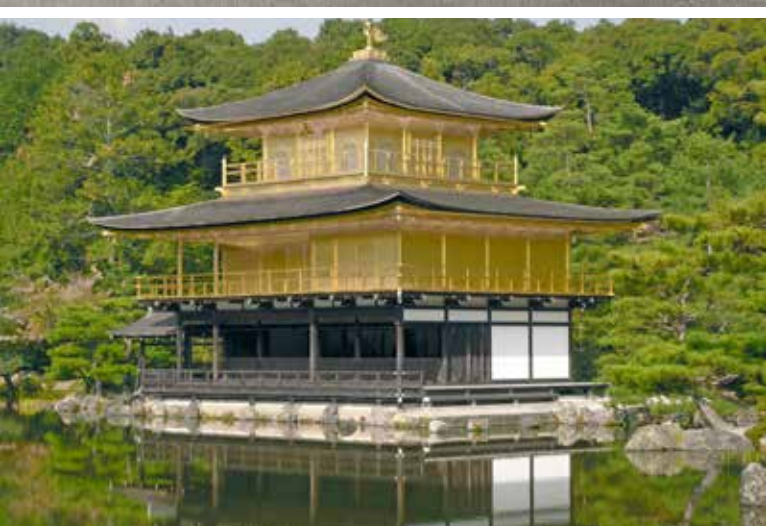
Kofuku-ji Temple, Nara (top); Giant Buddha, Kamakura; Nijo Castle, Kyoto; Golden Pavilion, Kyoto (above)