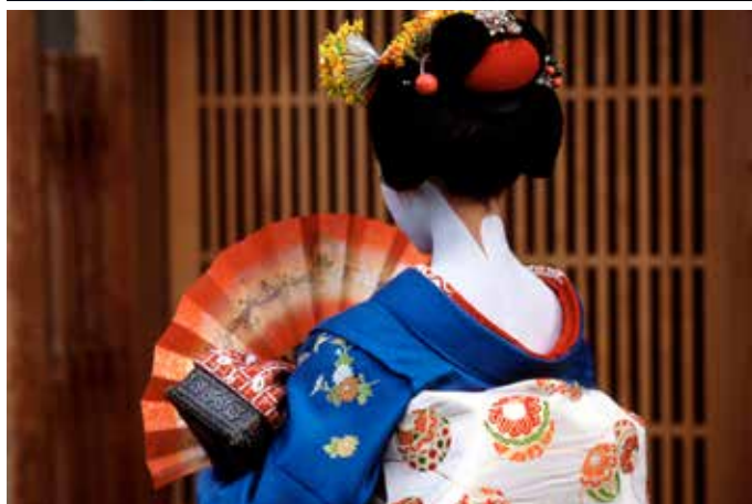
Byodo-in Temple (top); Waterfalls in Izu Peninsula; Mt Fuji; A maiko in Kyoto (above)