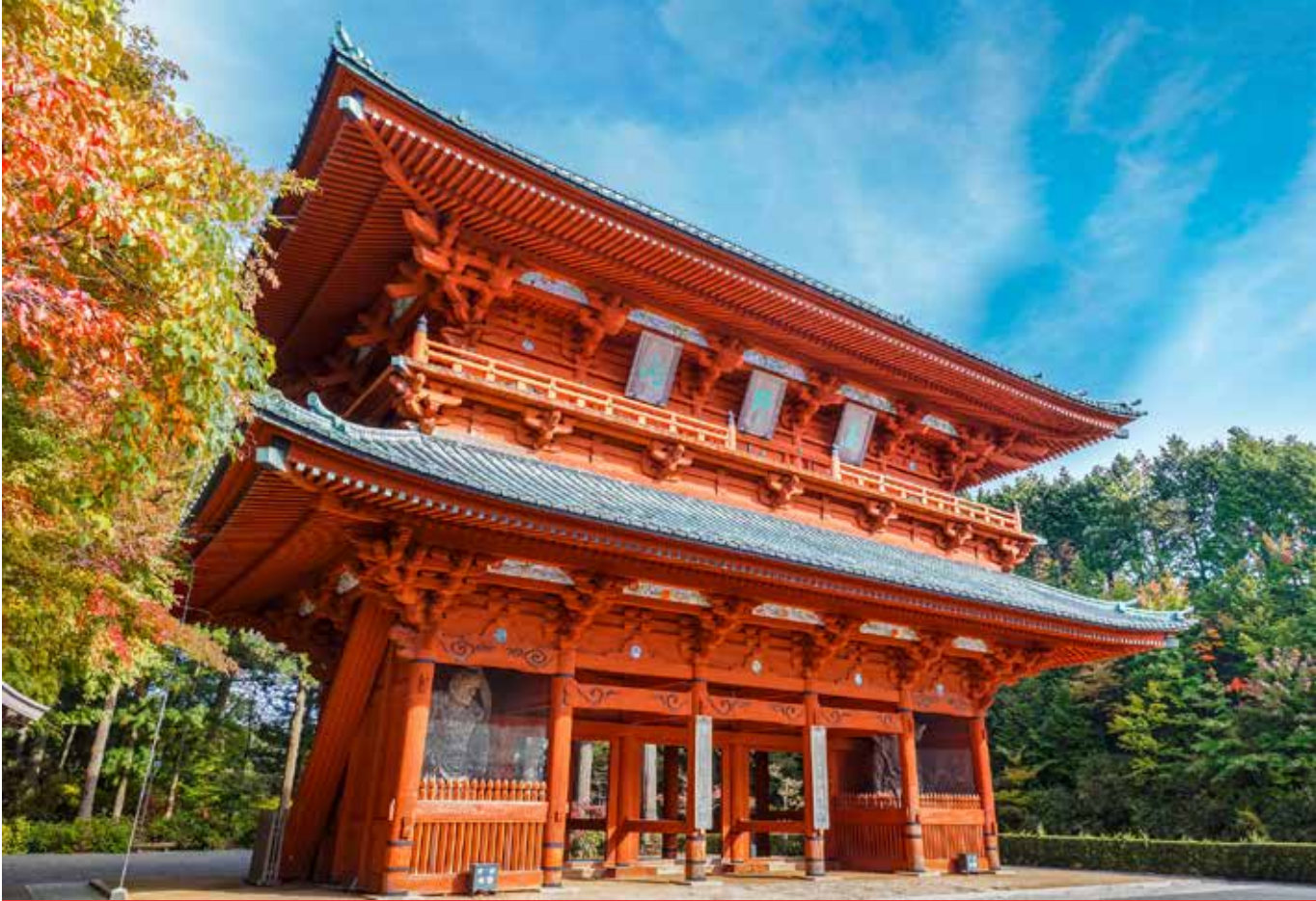
The Daimon Gate, the ancient entrance to Mount Koya