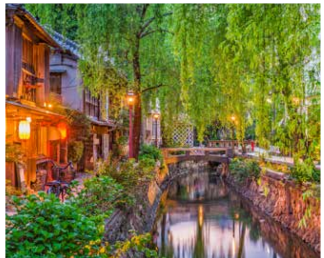
Canals in Shimoda, Izu Peninsula

* Itinerary subject to change according to local conditions. Airport transfers are not included in the tour price; there are a range of transfer options. Please contact us for further details.