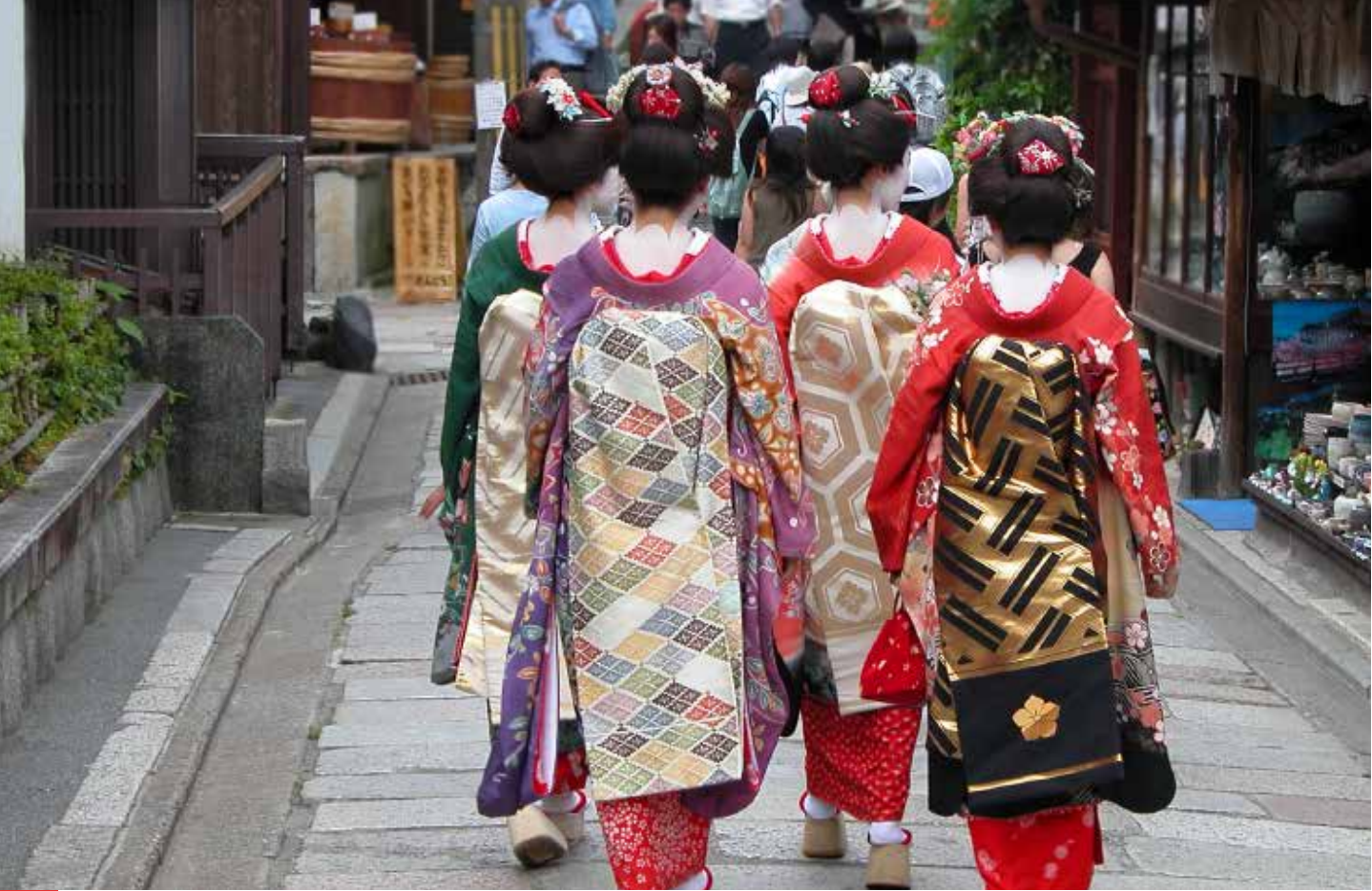
Maiko in traditional dress in Kyoto