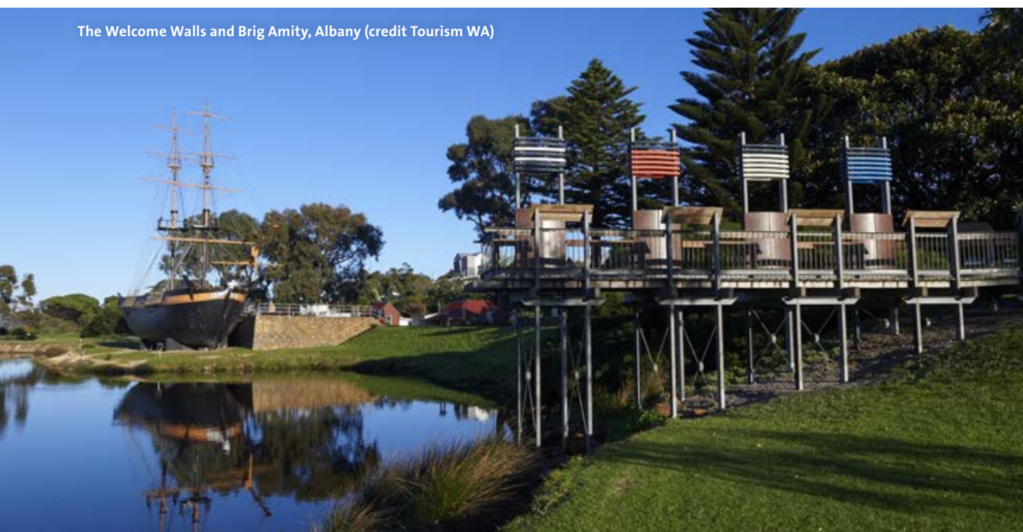
The Welcome Walls and Brig Amity, Albany

Am: An early start, to Garden Island, the Royal Australian Navy Fleetbase West, home of the Collins Class submarines. Visit SETF, the Submarine Escape Training facility. While this is now not in use because of the risks involved, you will see the small one-person submarine escape chamber and the escape compartment (for multiple escapees). Visit Clearance Diving Team 4 (the Navy's elite special forces). See the