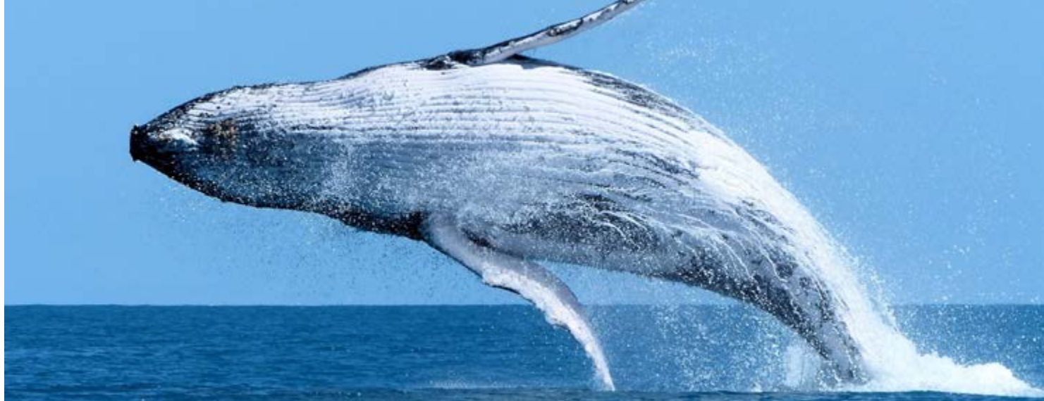
A humpback whale breaching near Albany

working Naval base, and if possible a Collins Class submarine.