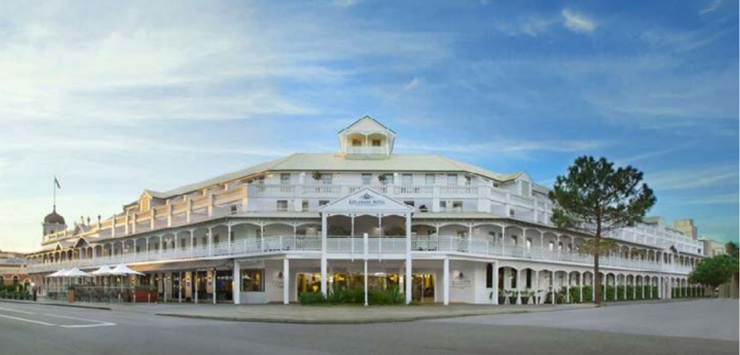
The Esplanade Hotel, Fremantle