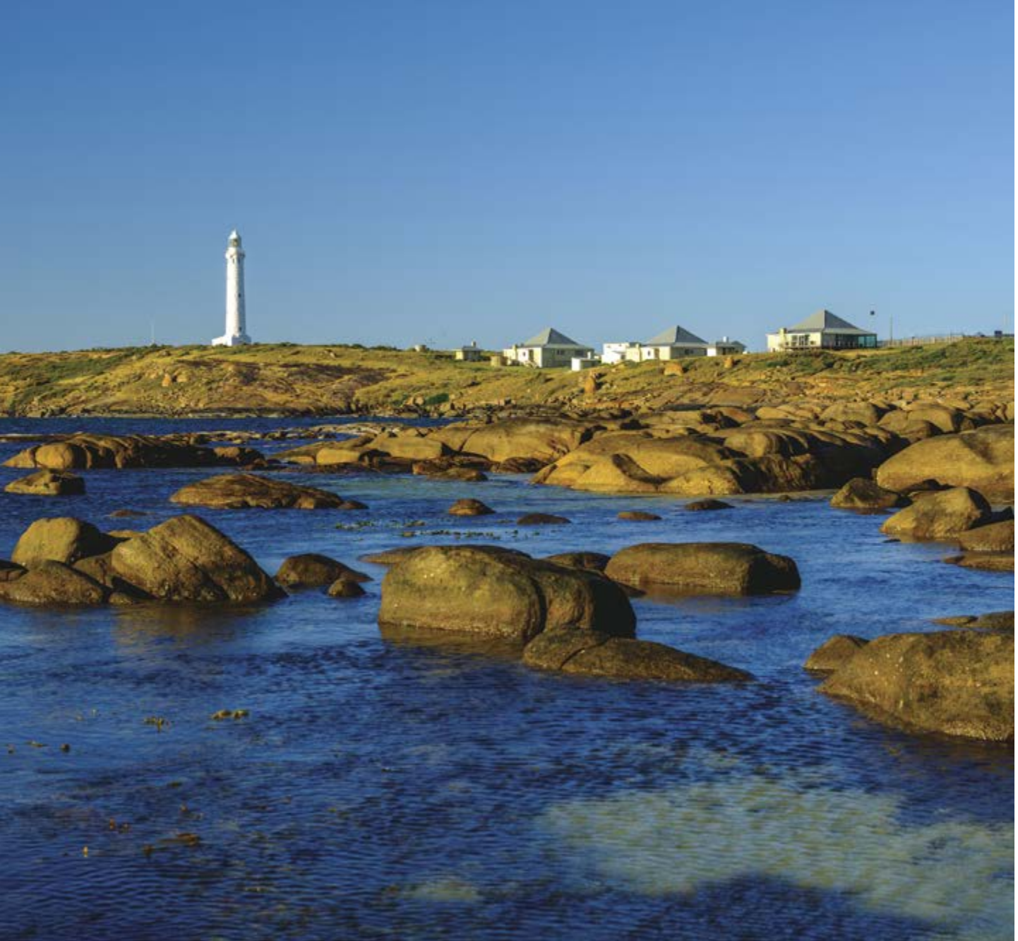
Visit Cape Leeuwin lighthouse

The land and people of Western Australia have been shaped by the ocean for thousands of years. Many of its people still live right by the water and WA's history has been moulded by its marine proximity. This maritime history tour explores the moments, voyages and vessels; the artefacts, people and the stories in South West Australia's rich maritime history. Along the way explore one of Australia's most beautiful pockets at a time when wildflowers will be blooming and whales will be heading up the coast. Hear the rollicking Albany Shantymen and see the traditional art of a scrimshawer, with ample opportunity to enjoy fine food and wine along the way.