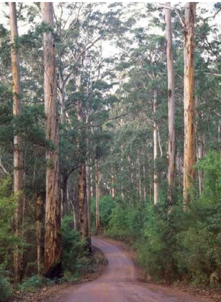
Albany's historic whaling station (credit Tourism WA) (top); Wildflowers (credit Tourism WA); A karri forest, Warren River National Park (above)