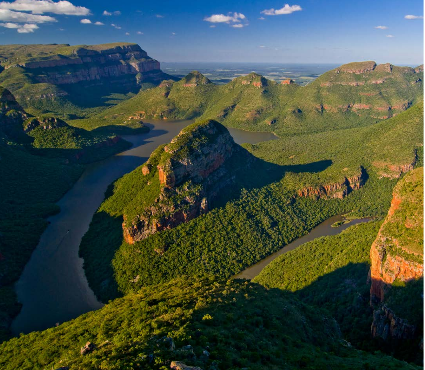
Blyde River Canyon