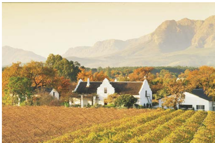
Elephants in Kruger (top); Insandlwana; Cape Point; The winlands (above)