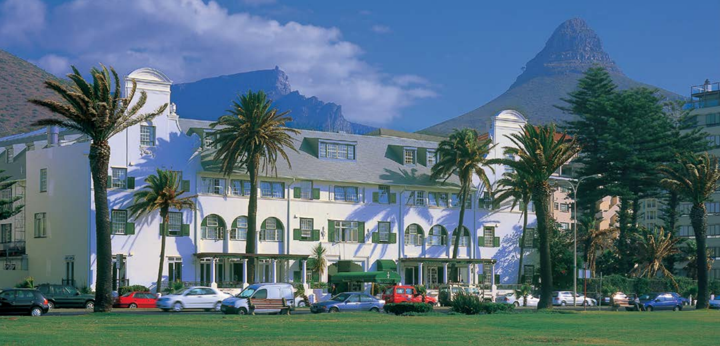
Winchester Mansions, Cape Town