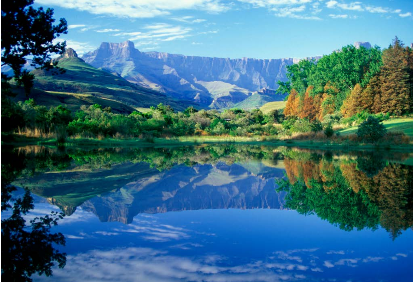
The Drakensberg Mountains