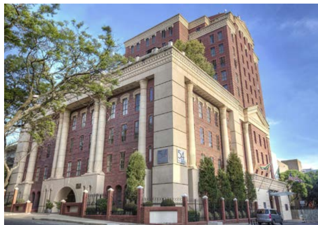
'Hippo Haunt' restaurant, Mlilwane Wildlife Sanctuary (top); 54 on Bath, Johannesburg (above)