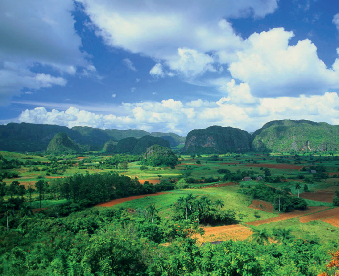
The spectacular scenery of Viñales

There is only one Cuba. This vivacious tropical island with music throbbing through its veins and a unique character kept intact by a half century of economic isolation has a vivid history and a unique healthcare system. Cuba has universal healthcare with a strong focus on health promotion, primary care and preventative medicine, with basic healthcare for all a national priority. Part of Cuba's health care strategy is to have a strong focus on organic farming and urban gardening.