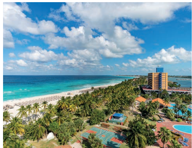
The perfect beaches of Varadero

Am: Transfer to Havana to connect with your return flight.