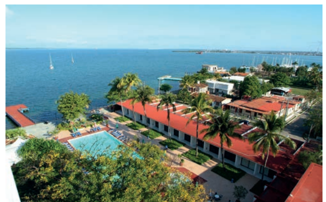
'Gente de campo' in Viñales (top); Memories Miramar Hotel, Havana; Hotel Jagua, Cienfuegos (above)