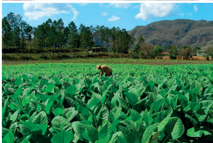
Trinidad Plaza (top); Musicians in Trinidad; Taquechel Pharmacy in old Havana; Visit a tobacco farm in Viñales (above)