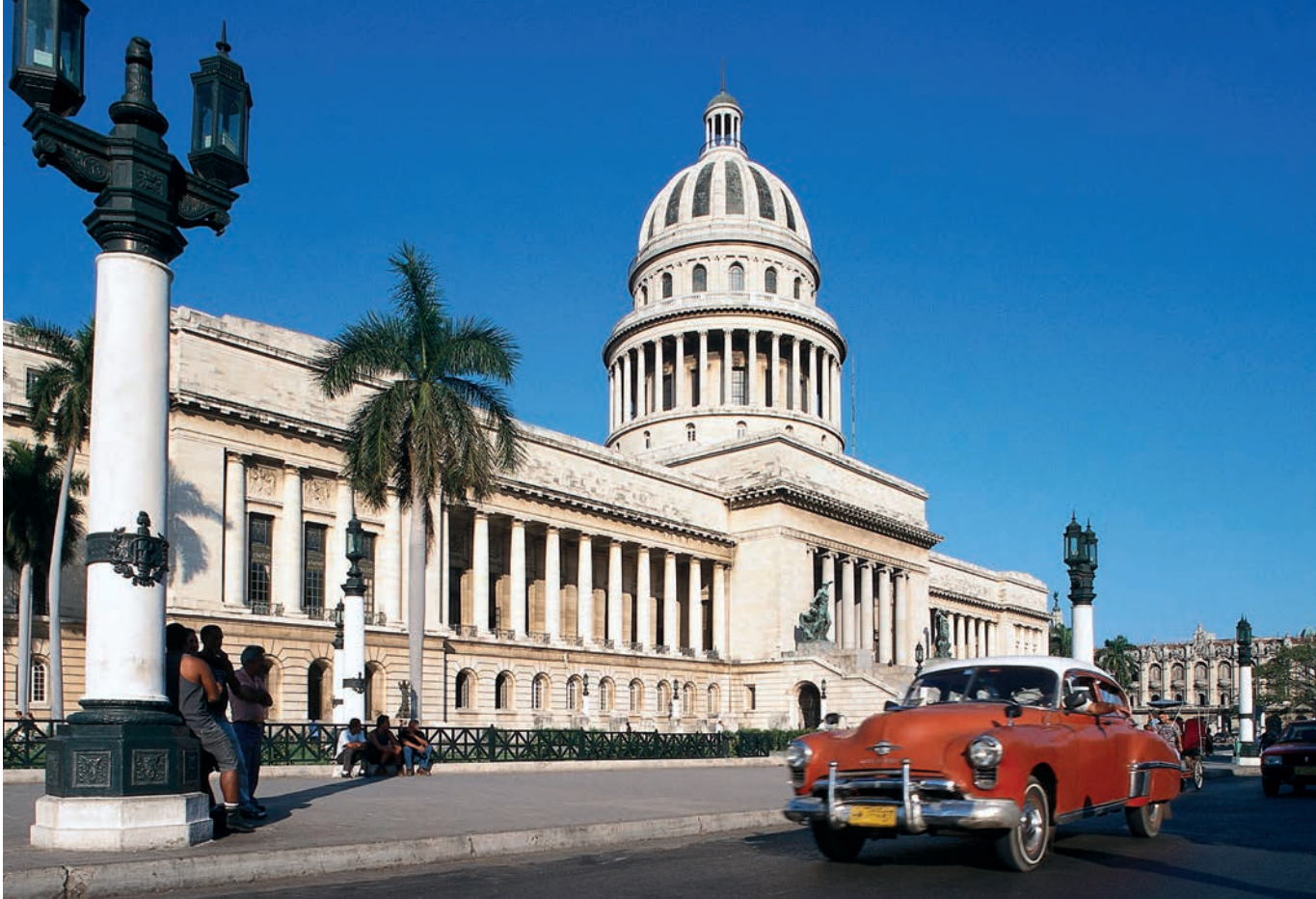
The Capitol in Havana