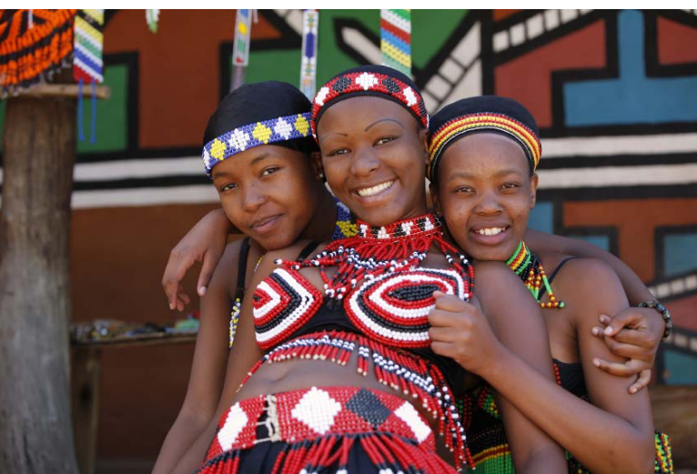
Cape Point (top); Zulu women (above)