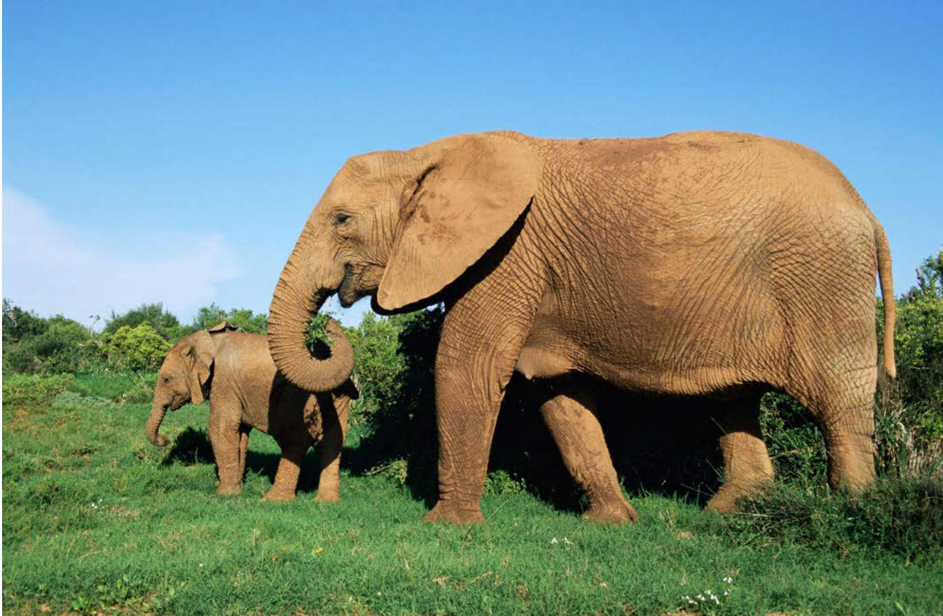
Elephants in the Kruger National Park