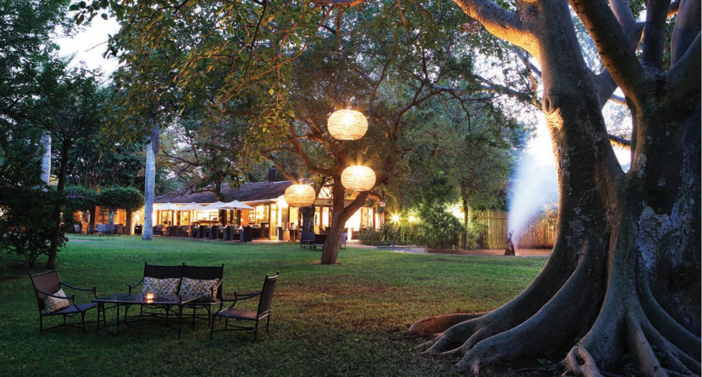
Ghost Mountain Inn