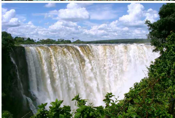
Cape Town waterfront (top); A herd of Burchell's Zebras; Cheetah, mother and baby; Victoria Falls (above)