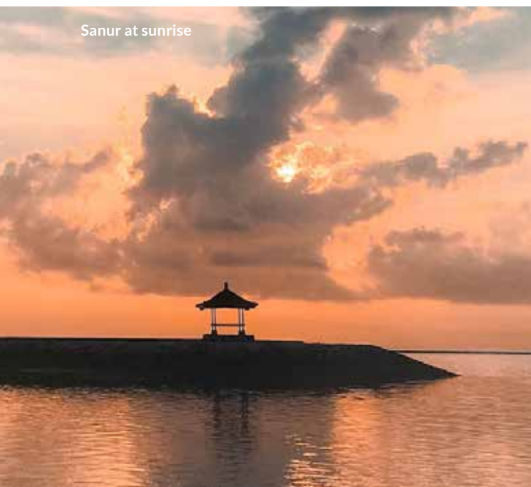
Sanur at sunrise

Pm: Visit Yayasan Rama Sesana to meet their team of skilled educators comprising doctors, nurses, midwives and outreach workers, dedicated to the task of improving the health of low-income women in Bali through education.