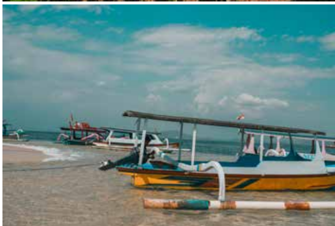
The rice terraces of Bali (top); Traditional Balinese dance; Meru Towers, Ubud; Traditional fishing boats, Lombok (above)

All the flights and flight-inclusive holidays in this brochure are financially protected by the ATOL scheme. When you pay you will be supplied with an ATOL Certificate. Please ask for it and check to ensure that everything you booked (flights, hotels and other services) is listed on it. Please see our booking conditions for further information or for more information about financial protection and the ATOL Certificate go to: www.atol.org.uk/ATOLCertificate