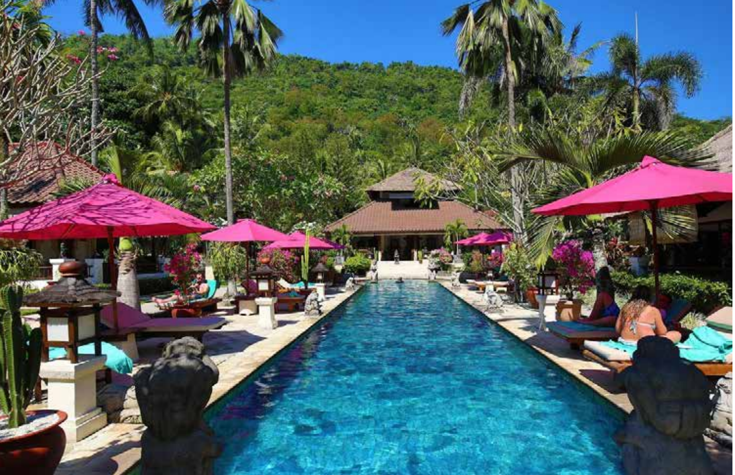
Puri Mas Beach Resort pool