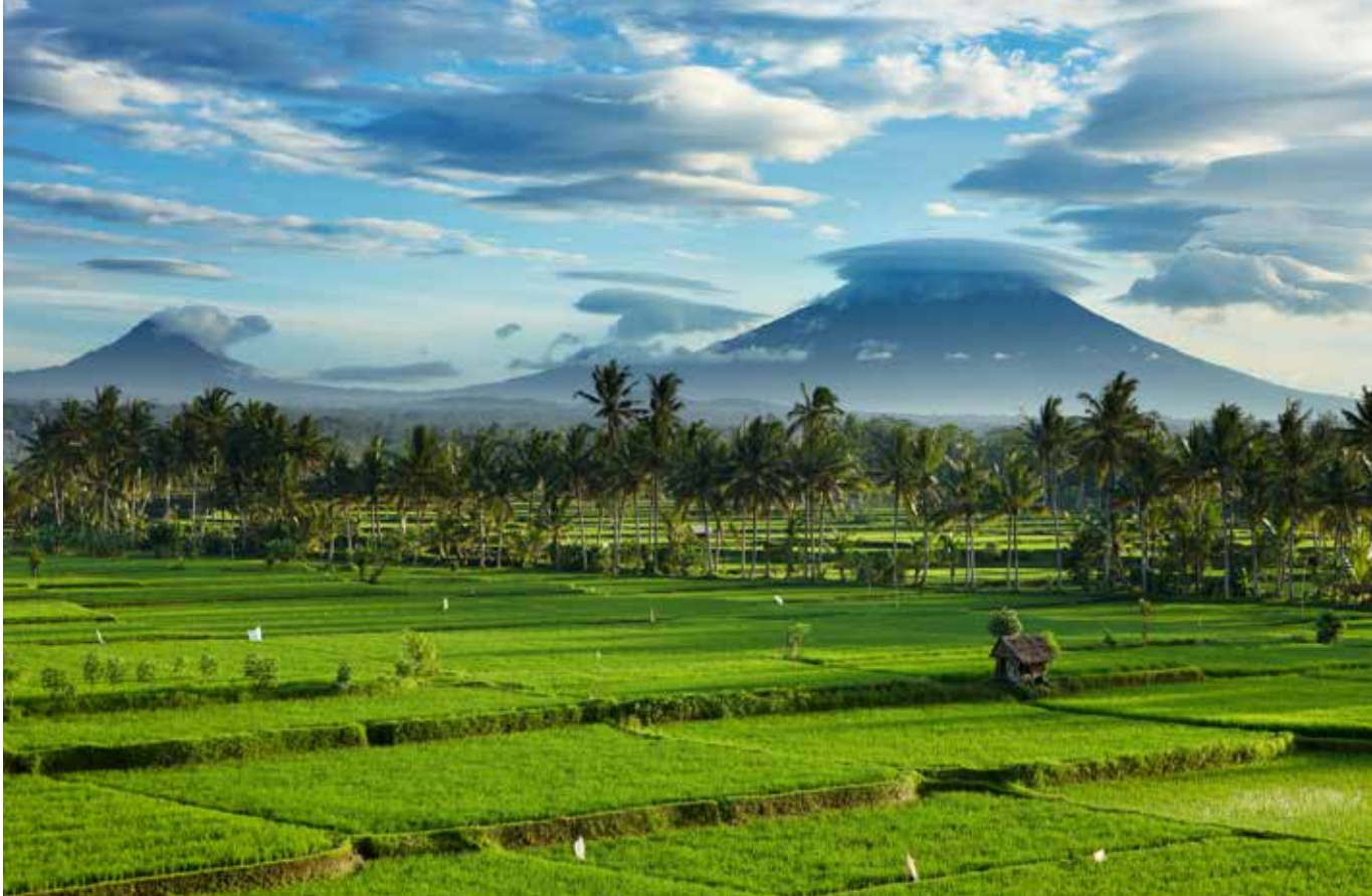
Rice fields outside Ubud