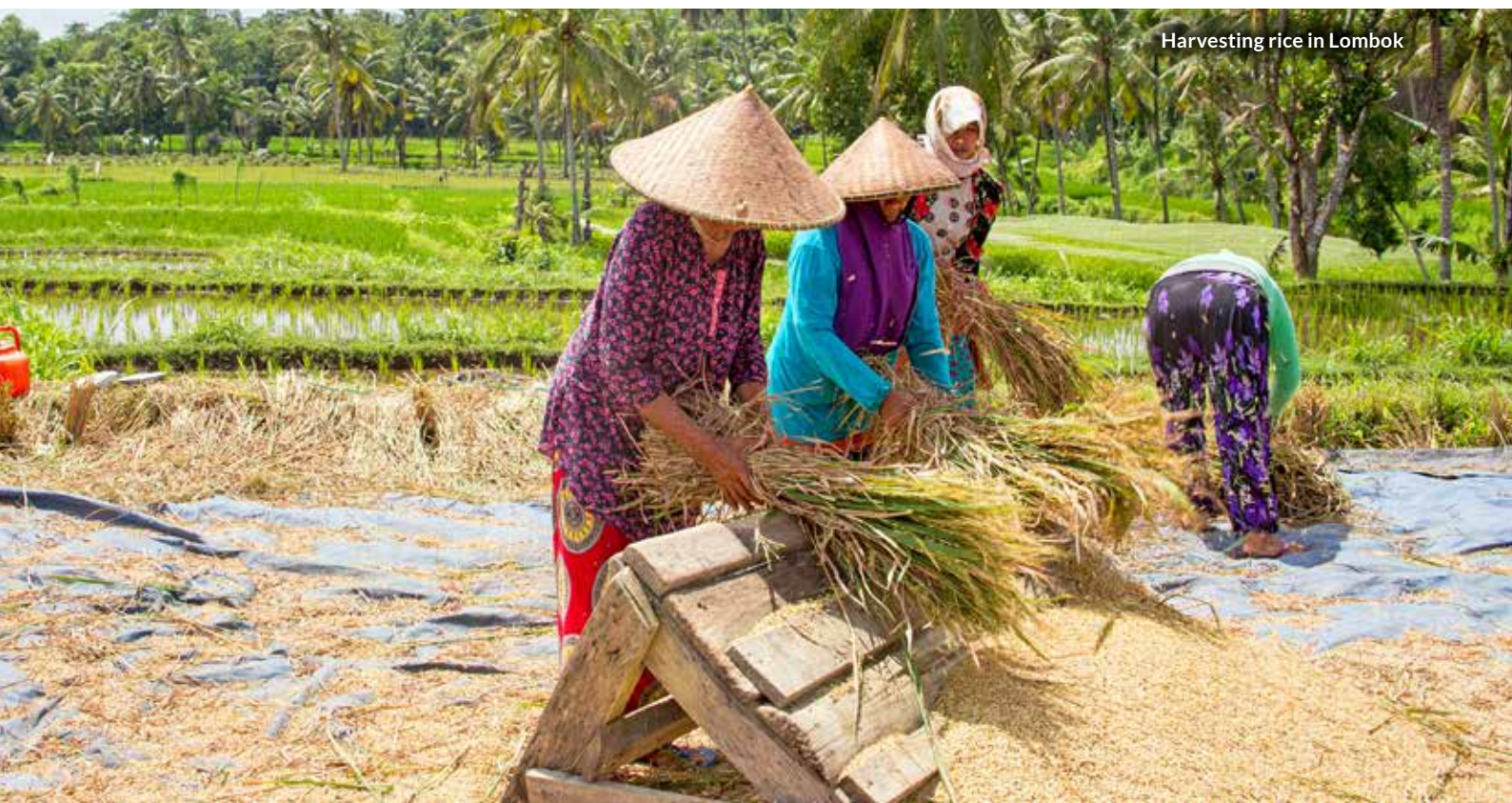
Harvesting rice in Lombok