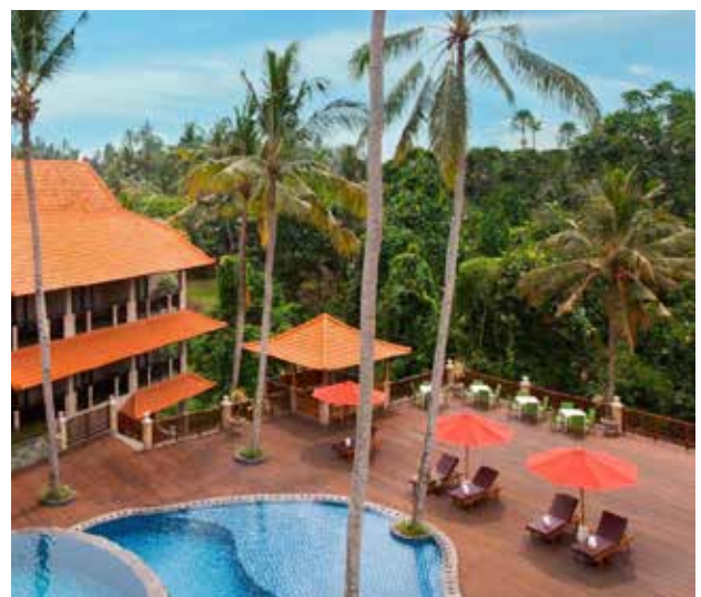
Mercure Hotel, Sanur (top); Best Western, Ubud (above)