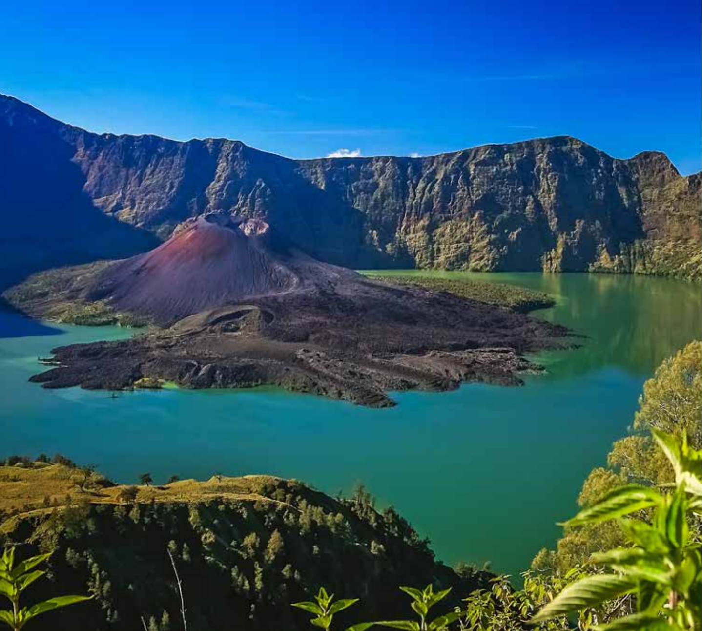
Magnificent Gunung Rinjani, Lombok

Experience lesser-travelled Bali and Lombok on this bespoke midwifery study tour. Explore the beauty of the region, where temples and shrines nestle amongst emerald-green rice terraces, magnificent Mt Rinjani towers above pristine gilis (islands) and spirituality infuses everyday life.