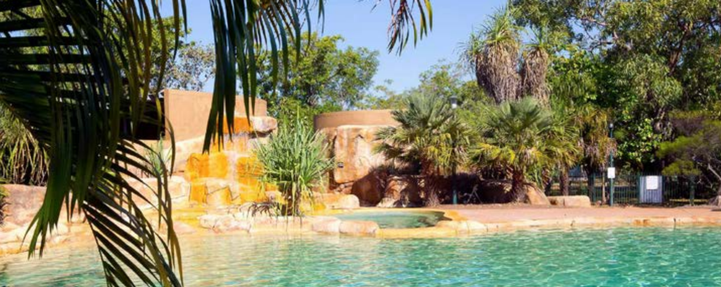
Kakadu Cooinda Lodge pool