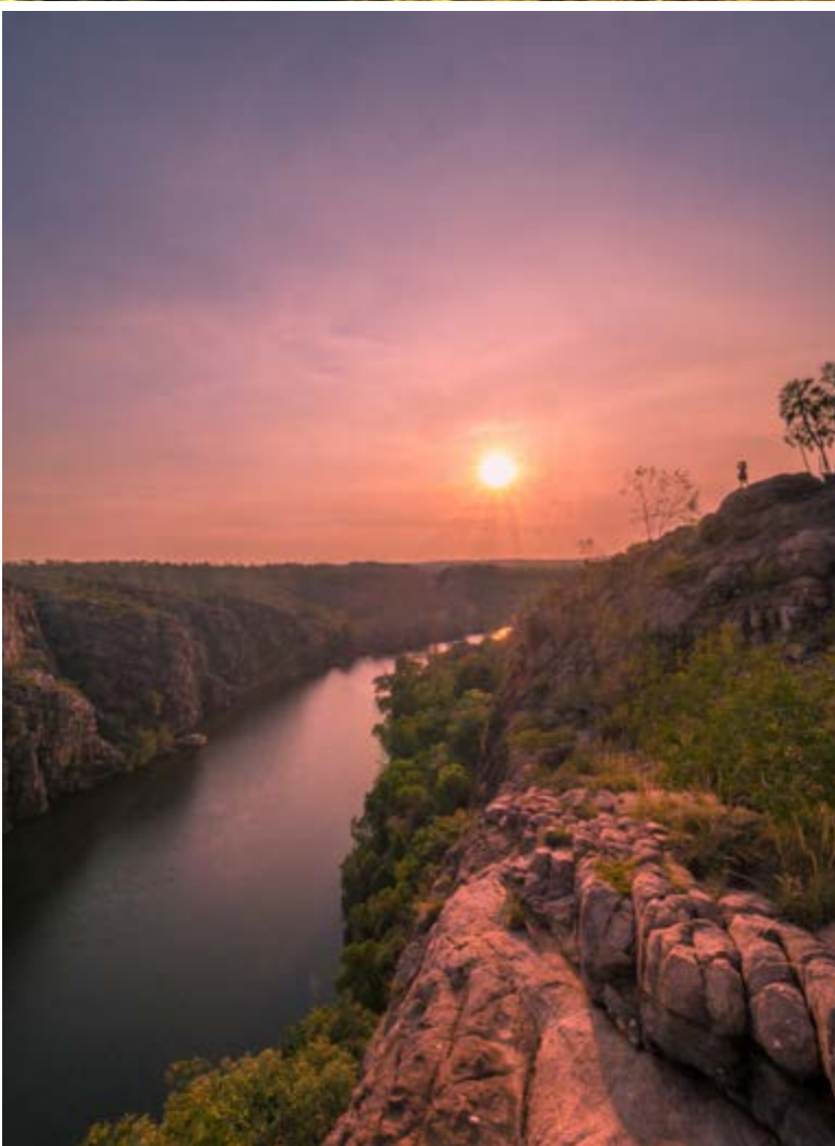
Florence Falls, Litchfield Park (top); Take a dinner cruise on beautiful Nitmiluk Gorge (above)