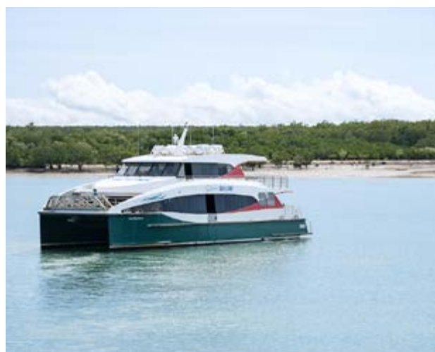
Stokes Hill Wharf, Darwin (top); Art in the Tiwi Islands Credit Tourism NT / Shaana McNaught; Take the ferry to the Tiwi Islands Credit Tourism NT / Shaana McNaught (above)