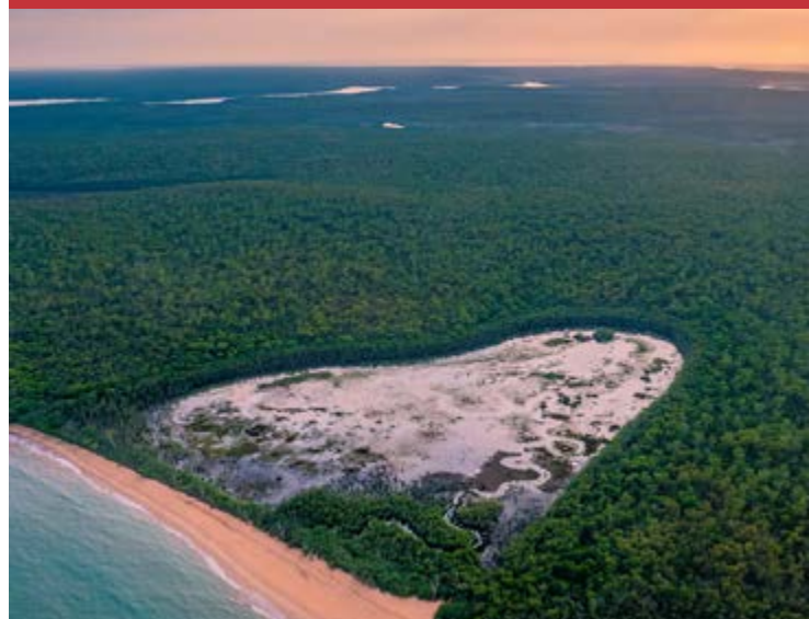
The Tiwi Islands

If you have to cancel due to Covid border closures, you will receive a 100% refund. This refund applies until the day of departure.