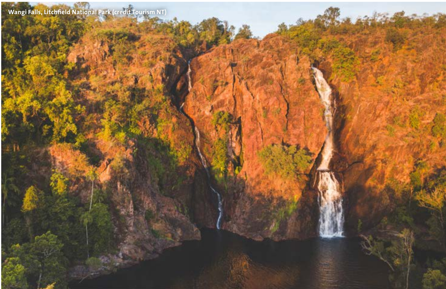
Wangi Falls, Litchfield National Park