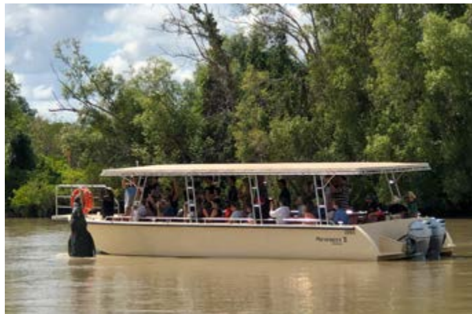
Mindil Markets, Darwin (credit Tourism NT) (top); Artist in the Tiwi Islands (Credit tourism Australia / Mark Fisher); Yellow Water Cruise, Kakadu National Park; Jumping crocodiles on the Adelaide River (credit Tourism NT) (above)

All the flights and flight-inclusive holidays in this brochure are financially protected by the ATOL scheme. When you pay you will be supplied with an ATOL Certificate. Please ask for it and check to ensure that everything you booked (flights, hotels and other services) is listed on it. Please see our booking conditions for further information or for more information about financial protection and the ATOL Certificate go to: www.atol.org.uk/ATOLCertificate