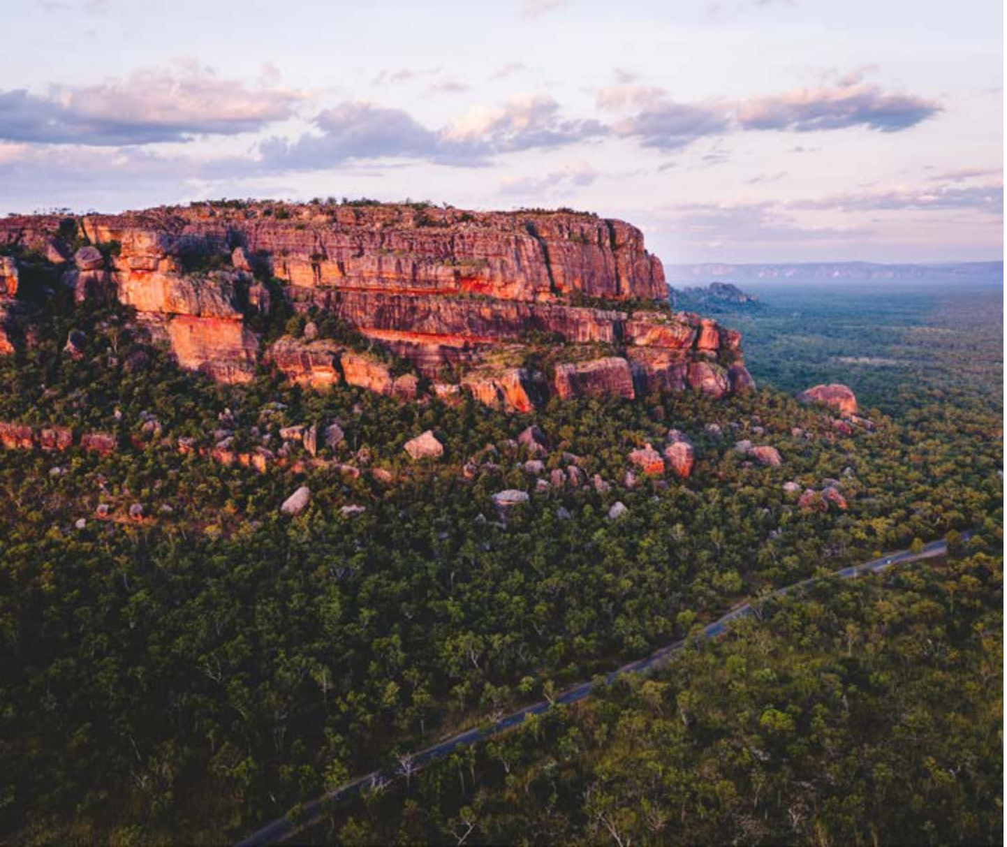
Kakadu from the air

Explore the dramatically beautiful landscapes of the Northern Territory as you learn about the history and practice of midwifery in the region. Hear about traditional practices, the culture and customs of First Nations people and rural and remote midwifery.