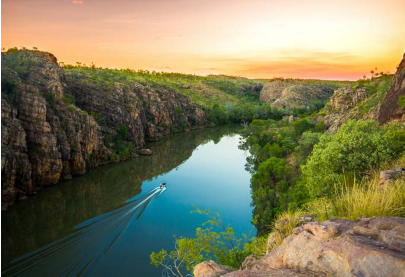
Nitmiluk Gorge, Katherine