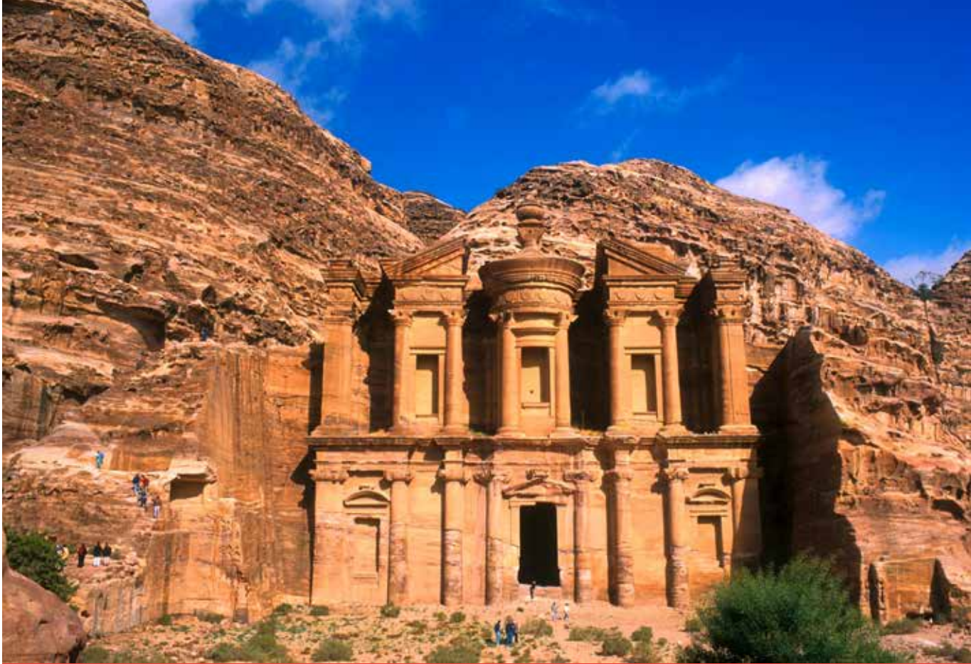
The Monastery at Petra