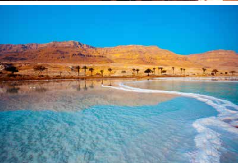
Beersheba (top); Caesarea; The Petra Treasury; The Dead Sea (above)

The cost of the tour is USD $5,373 per person sharing (excluding international flights and transfers)