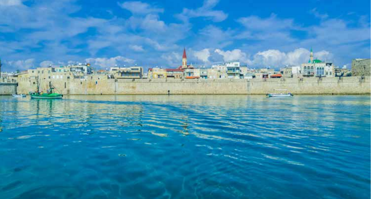
The city of Acre