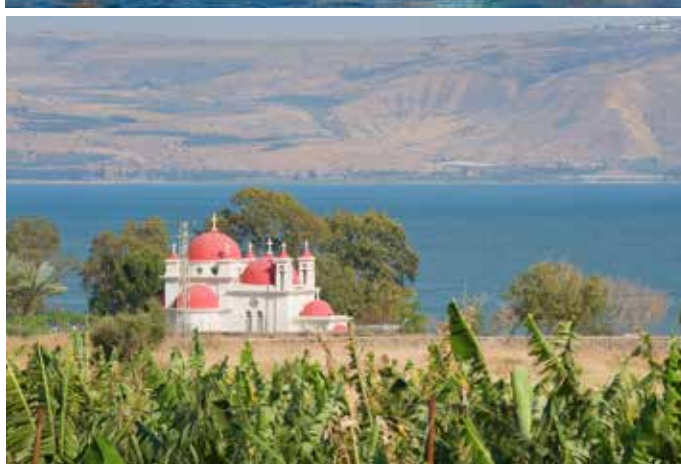
Citadel of the Knights, Acre (top); Garden of Gethsemane; Acre Harbour; The Sea of Galilee (above)