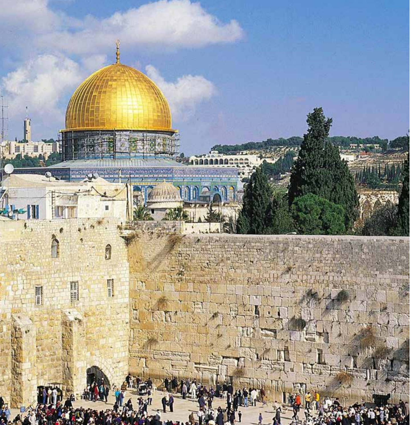
The Dome of the Rock in Jerusalem

Travel through ancient and beautiful countries that blend some of the world's greatest historical and architectural treasures with layers of culture, superb cuisine and a proud tradition of hospitality and welcome. The backdrop to this journey ranges from mountains to Mediterranean coastline and spectacular deserts. The long and complex history of the area encompasses the formation of the Knights Hospitaller and Templar, the Crusades, the end of the Ottoman Empire, TE Lawrence and the Arab