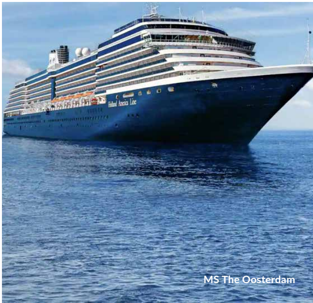
MS The Oosterdam