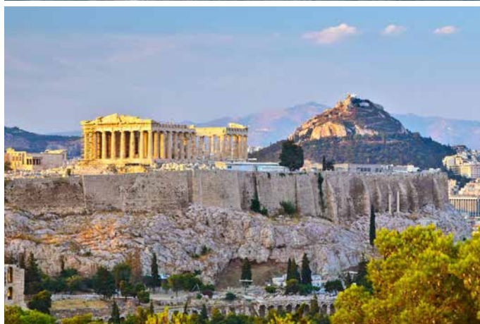
Split, Croatia (above); The Aegean Coast; Rhodes Harbour and Castle; The Acropolis, Athens (top)