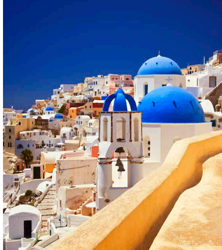
The streets of Santorini