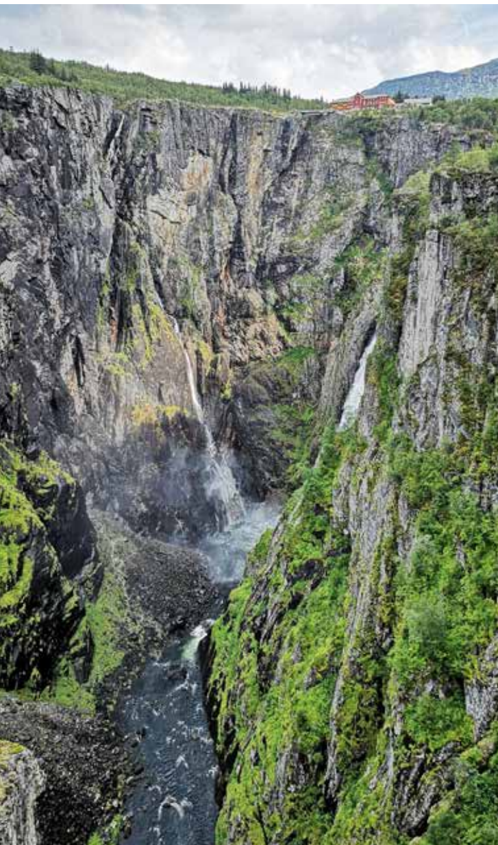
Cross Hardangervidda plateau on your train journey

A highlight of travel through Norway is the exhilarating journey on the famous railway line between Oslo and Bergen. Built in extreme conditions between 1875 and 1909, the 496km rail line climbs to 1237 metres above sea level, and traverses 182 tunnels. On the top of the mountains you find Finse at 1,222 meters – the highest railway station in Europe. Starting in the valleys of western Norway with rich green farmland, flowing rivers, sheer gorges and the glassy Osterfjord, the train climbs into the mountains, with the most spectacular stretch across Hardangervidda, Europe's highest mountain plateau. It descends into a lush landscape of forests, lakes and rivers and continues through farmland dotted with quaint colourful houses into Oslo.