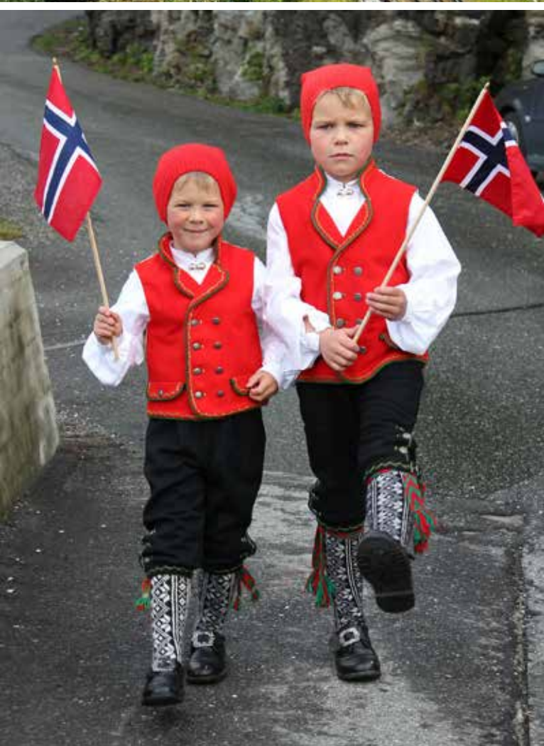
Take the funicular in Bergen (top); Local boys celebrating National Day in Oslo (above)