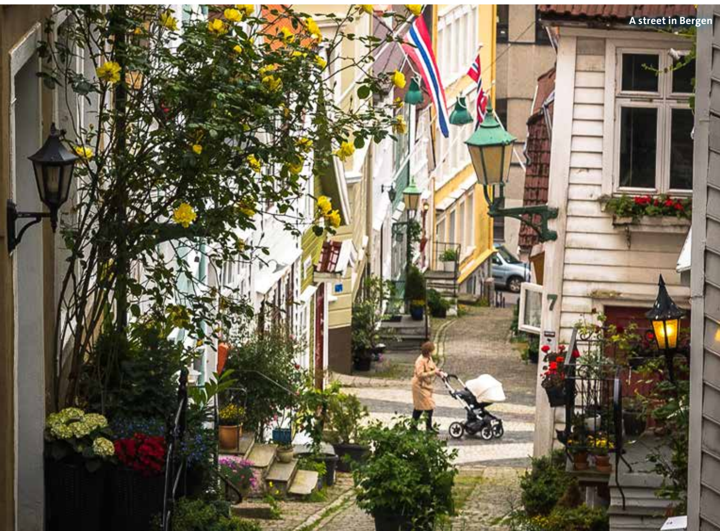
A street in Bergen

Am: Take a boat trip out of Bergen to visit the spectacular fjordland, including