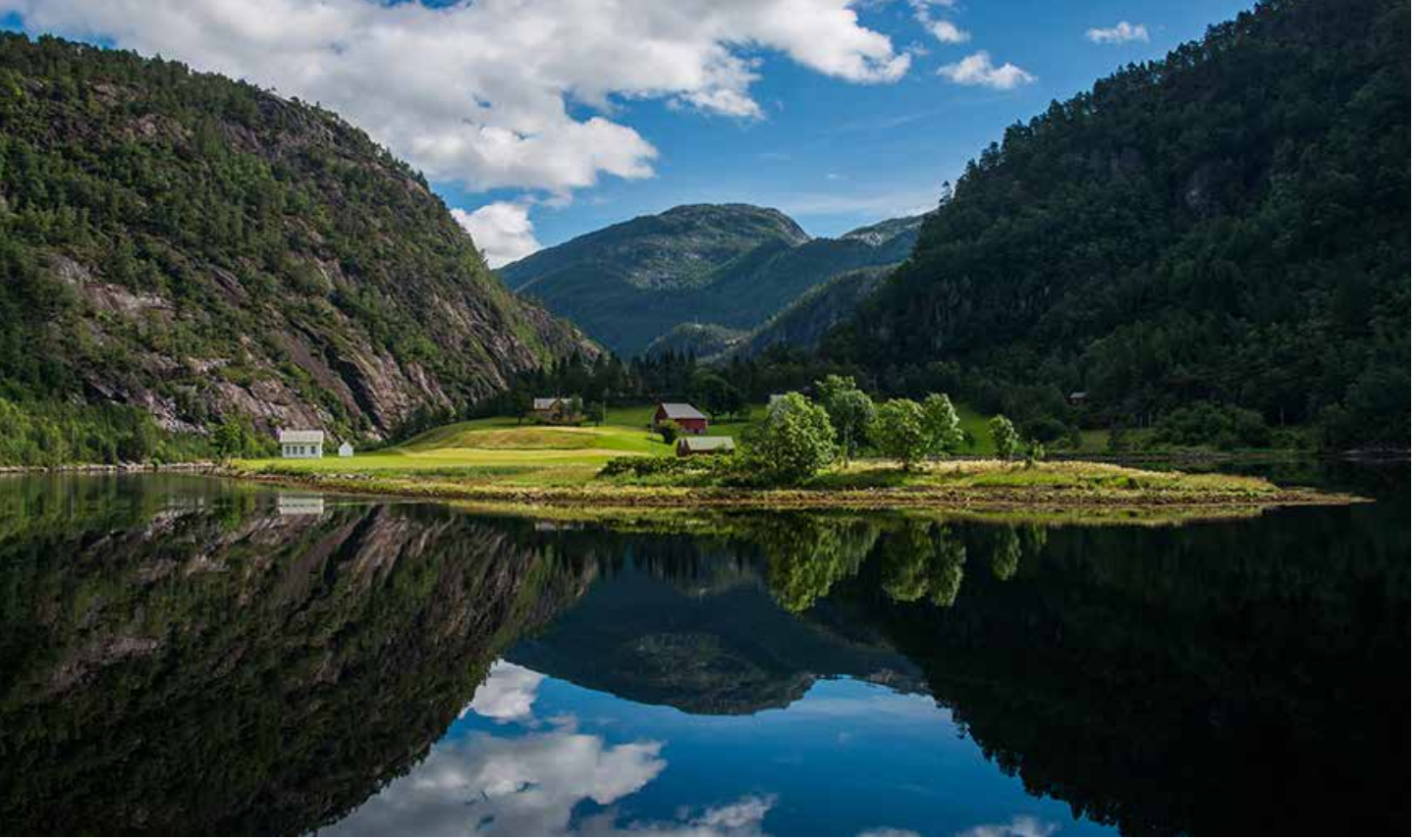
Bergen to Mostraumen fjord cruise