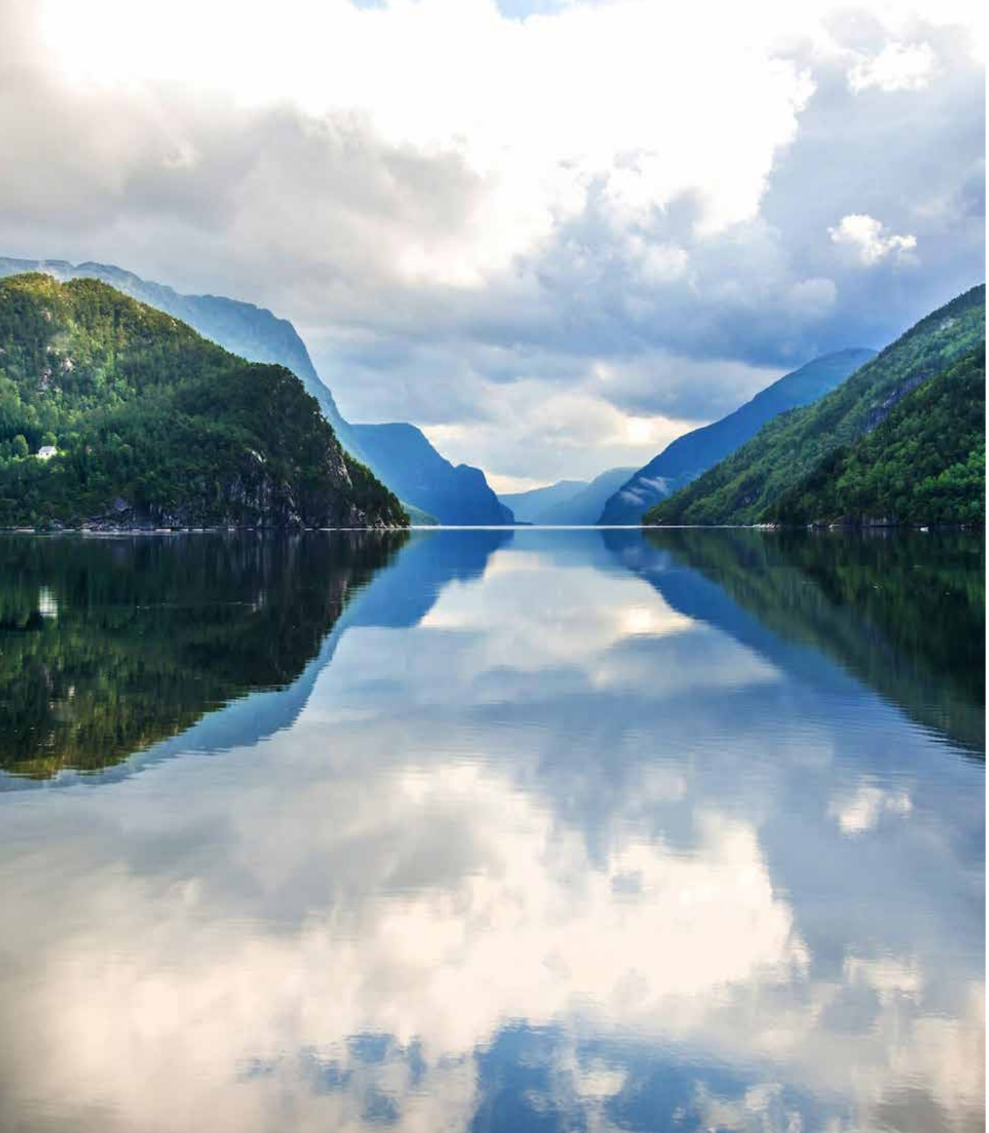
Cruise from Bergen through spectacular fjordlands, including Mostraumen

Norway is a remote land possessing otherworldly beauty, ancient history and a thriving arts and cultural scene. Experience its Viking heritage and modern culture and hear its lovely music, ranging from classical to folk.