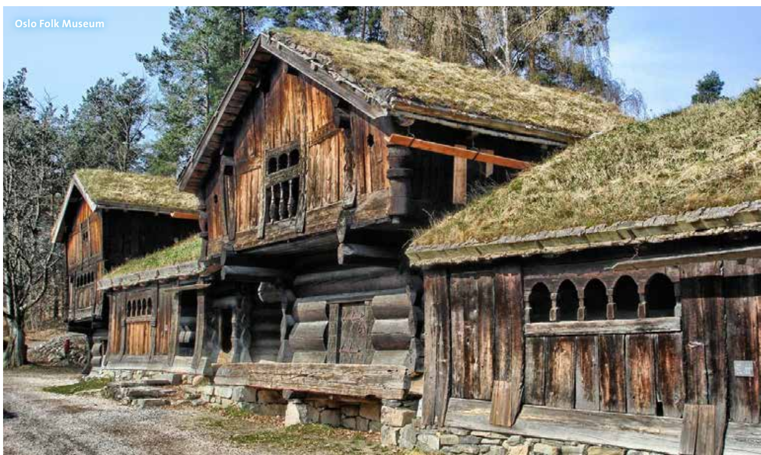
Oslo Folk Museum

NB: All itineraries subject to change according to local conditions.