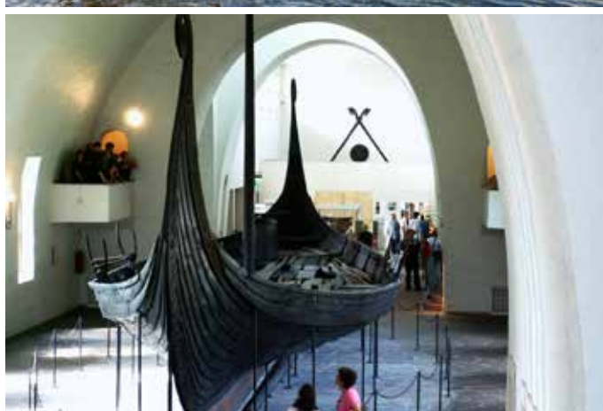
Cruise Osterfjord from Bergen (top); Bergen by night; Open air sauna in Oslo; The Viking ship museum in Oslo (above)