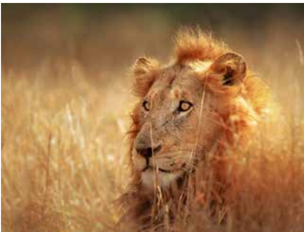
A herd of Burchell's Zebras (top); Lion in Kruger (above)

Rise before sunrise the next day for a morning game drive in the Kruger National Park in open safari vehicles. It isn't unusual to spot all of the 'big five' in a single day along with a fascinating range of mammal, bird and reptile species. Have a bush lunch and return to the lodge in the early evening.