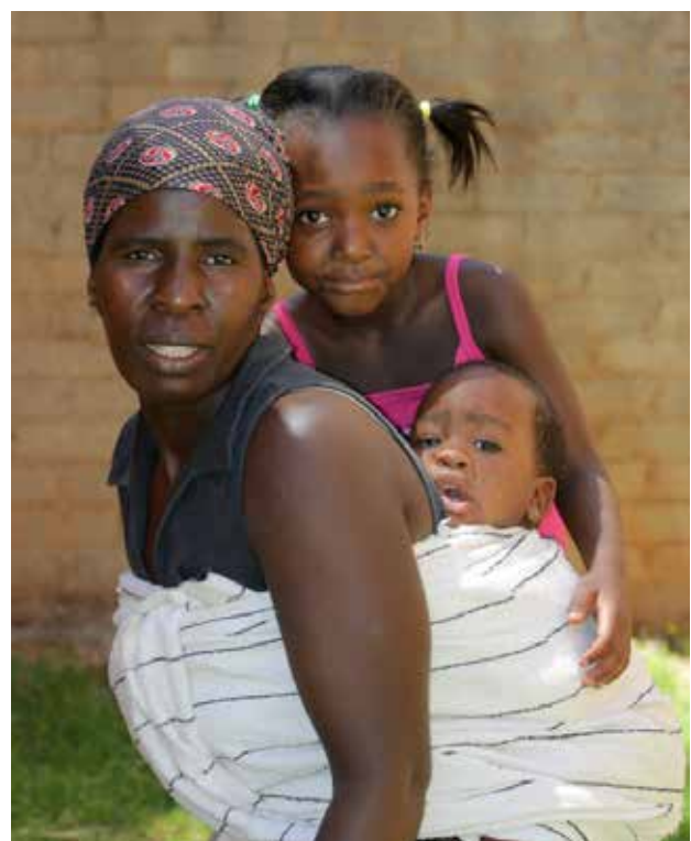
A mother and her young children

Next morning visit Netcare Private Hospital and meet with the nurses who work there, providing a striking contrast to the public hospital seen a day earlier. Afterwards drive into the spectacular safari country of Mpumalanga. Transfer to your hotel in Timbavati and settle in, with the rest of the day at leisure and dinner at the hotel in the evening.