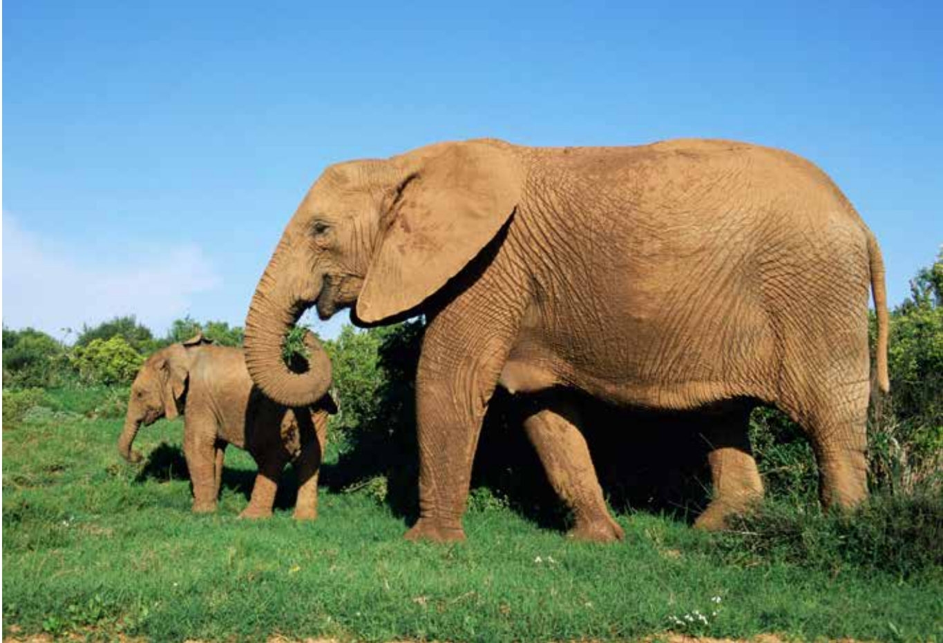
Elephant and baby in Kruger National Park