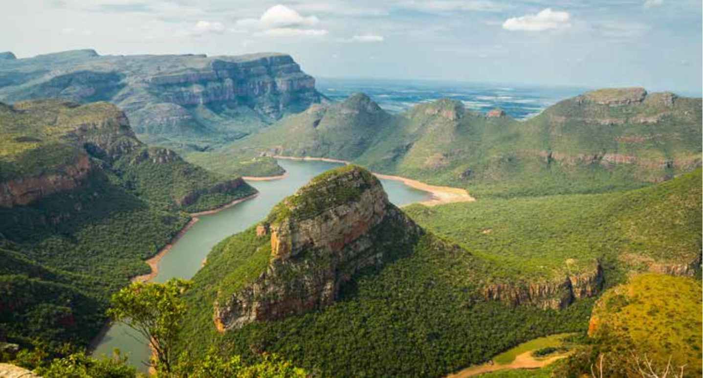
Blyde River Canyon

This nursing study tour reveals the many faces of this beautiful and diverse land. Travel from Johannesburg into the safari country of Mpumalanga and the Kruger National Park, along the spectacular 'Panorama Route', ending in the cosmopolitan harbour city of Cape Town. Your journey includes wide ranging specialist visits to hospitals, clinics and a college to meet nurses and learn about health care, nursing and nursing education in South Africa. Gain real insight into nursing and the social issues surrounding your profession in South Africa. There is also the opportunity to take a pre-tour extension at beautiful Victoria Falls.