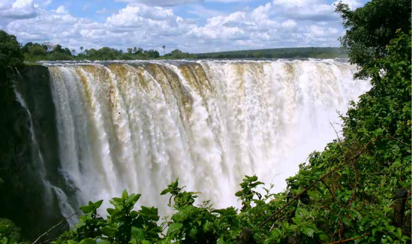
Victoria Falls (extension)