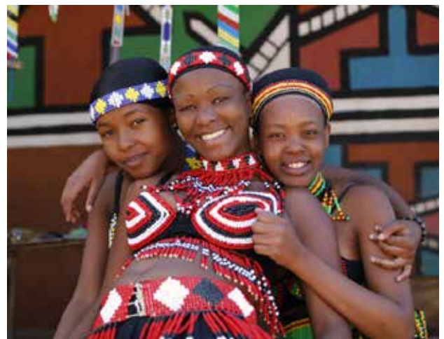
Zulu girls against a Ndebele backdrop

Visit the University of Cape Town School of Nursing in the morning to hear about nursing education in South Africa today and to meet with tutors and students. Have lunch at Lelapa, Cape Town's most popular authentic township eating experience, where locals of all creeds and colours come together to enjoy Braai (barbeque). Visit Langa, Cape Town's oldest township, to see how a previously disadvantaged community has lifted itself out of squalor into a modern