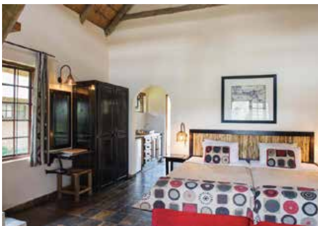
Painted rondavels at Timbavati (top); A room at Hippo Hollow (above)

The tour cost is USD $3,785 per person sharing (excluding international flights and transfers)