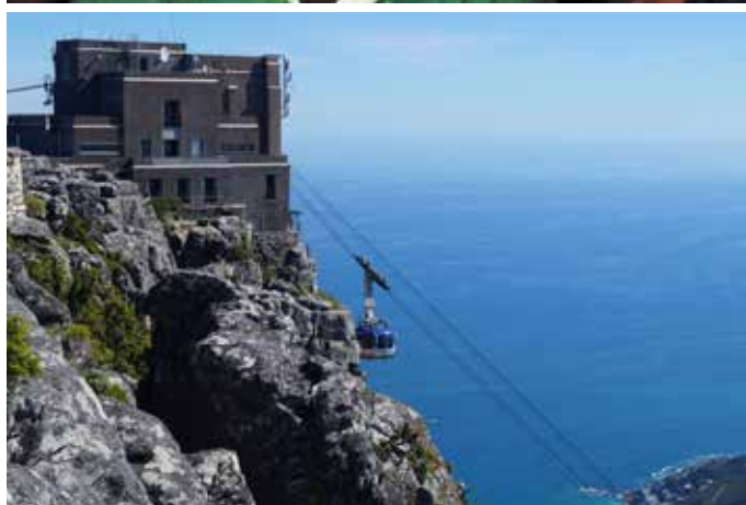
White rhinos (top); Cape Town harbour; Face painted children; Take the cable car in Cape Town (above)

All the flights and flight-inclusive holidays in this brochure are financially protected by the ATOL scheme. When you pay you will be supplied with an ATOL Certificate. Please ask for it and check to ensure that everything you booked (flights, hotels and other services) is listed on it. Please see our booking conditions for further information or for more information about financial protection and the ATOL Certificate go to: www.atol.org.uk/ATOLCertificate