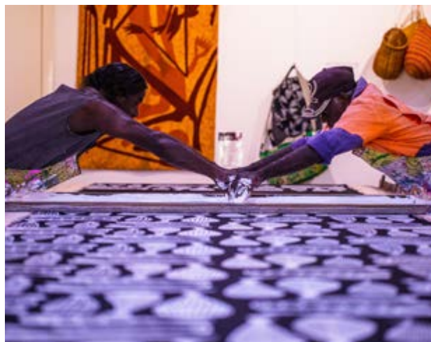
Stokes Hill Wharf, Darwin (top); Injalak Hill rock art ; Aboriginal artwork (above)