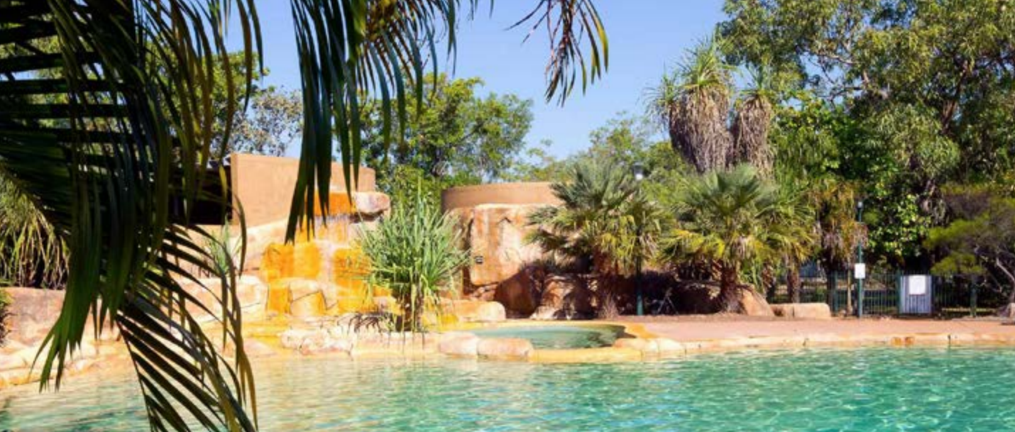
Kakadu Cooinda Lodge pool