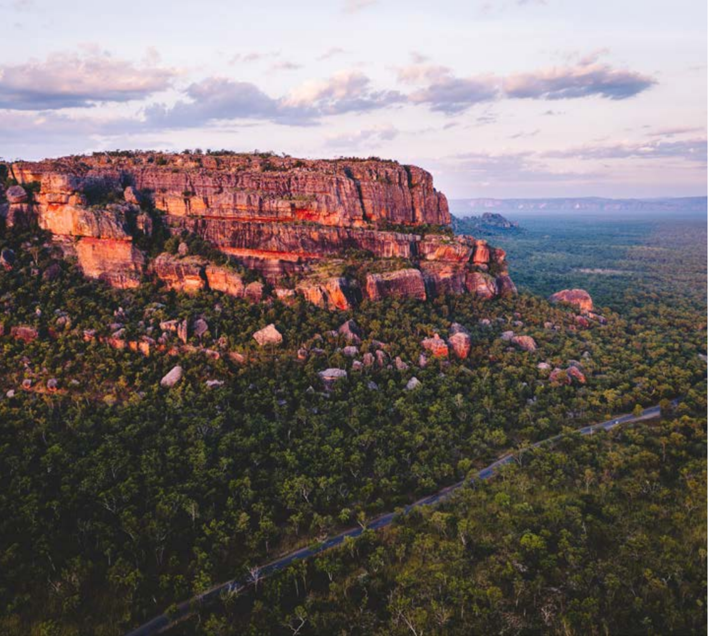
Kakadu from the air

Following the successful health care study tours in the Northern Territory, a nursing tour has been organised for October. Explore the dramatically beautiful landscapes of the Northern Territory as you learn about the history and practice of nursing in the region. The tour is supported by the Australian College of Nursing.