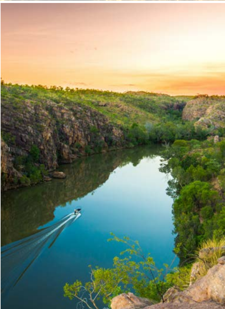
Florence Falls, Litchfield Park (top); Nitmiluk Gorge, Katherine (above)