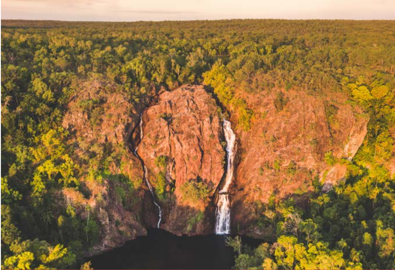
Wangi Falls Litchfield National Park