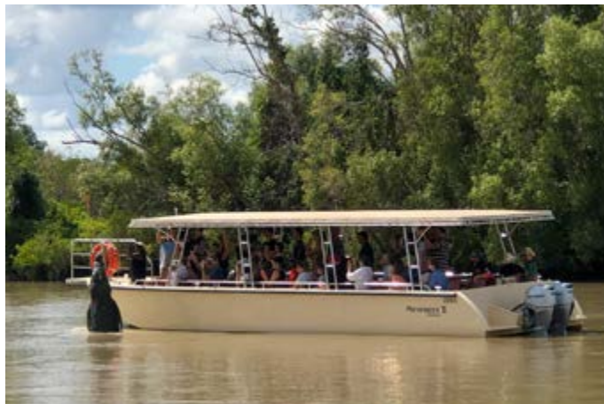
Darwin's tropical gardens (top); Mindil Markets, Darwin ; Traditional crafts ; Jumping crocodiles on the Adelaide River (above)

All the flights and flight-inclusive holidays in this brochure are financially protected by the ATOL scheme. When you pay you will be supplied with an ATOL Certificate. Please ask for it and check to ensure that everything you booked (flights, hotels and other services) is listed on it. Please see our booking conditions for further information or for more information about financial protection and the ATOL Certificate go to: www.atol.org.uk/ATOLCertificate