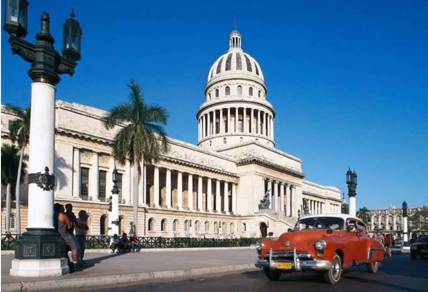
The Capitol in Havana