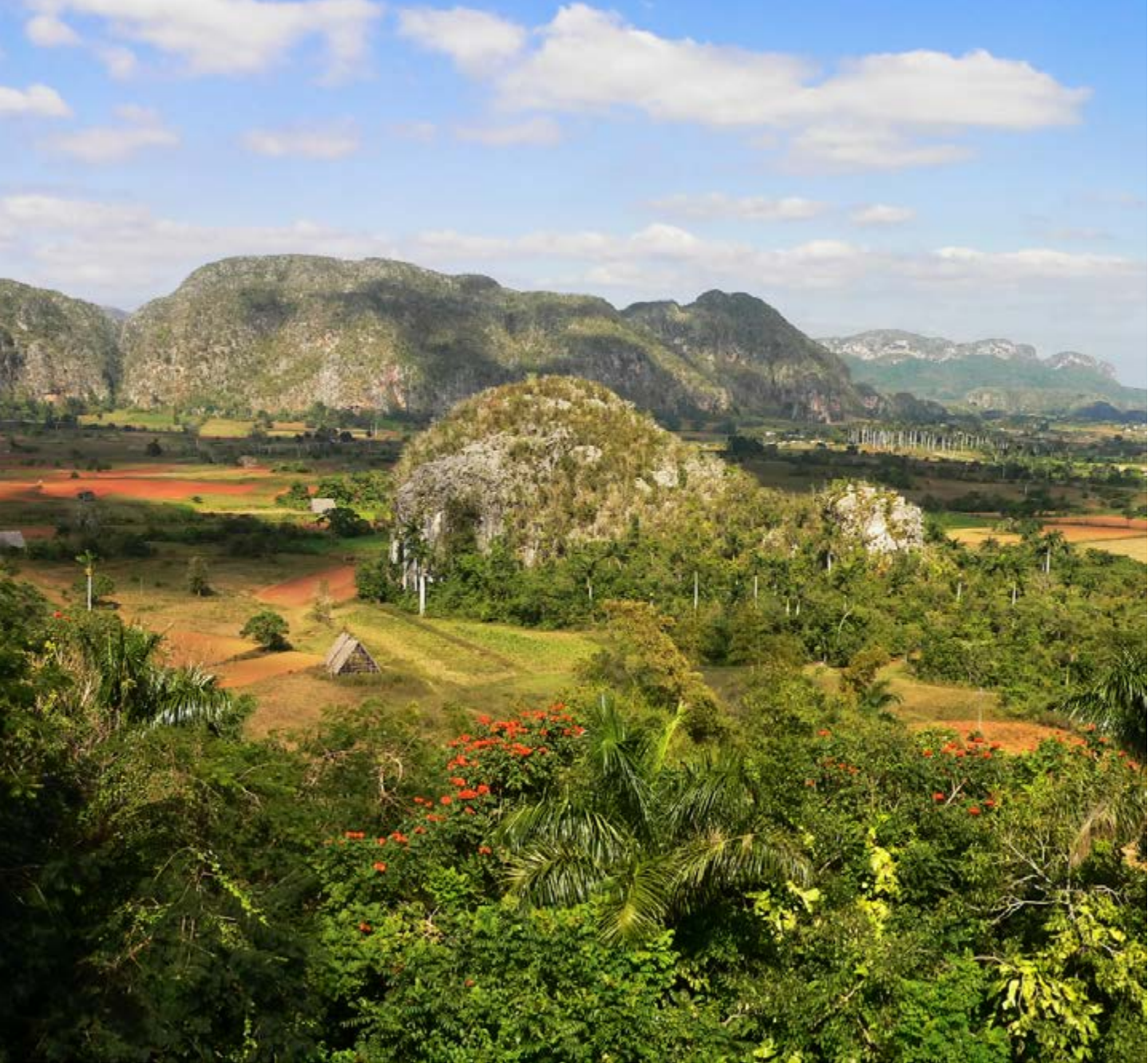
The spectacular scenery of Viñales

There is only one Cuba. This vivacious tropical island with music throbbing through its veins and a unique character kept intact by a half century of economic isolation has a vivid history and a unique healthcare system. Cuba has universal healthcare with a strong focus on primary care, preventative medicine and home health, with basic healthcare for all a national priority. Cuba has long made wide use of traditional and herbal remedies from a pharmacological perspective, from necessity as much as anything.