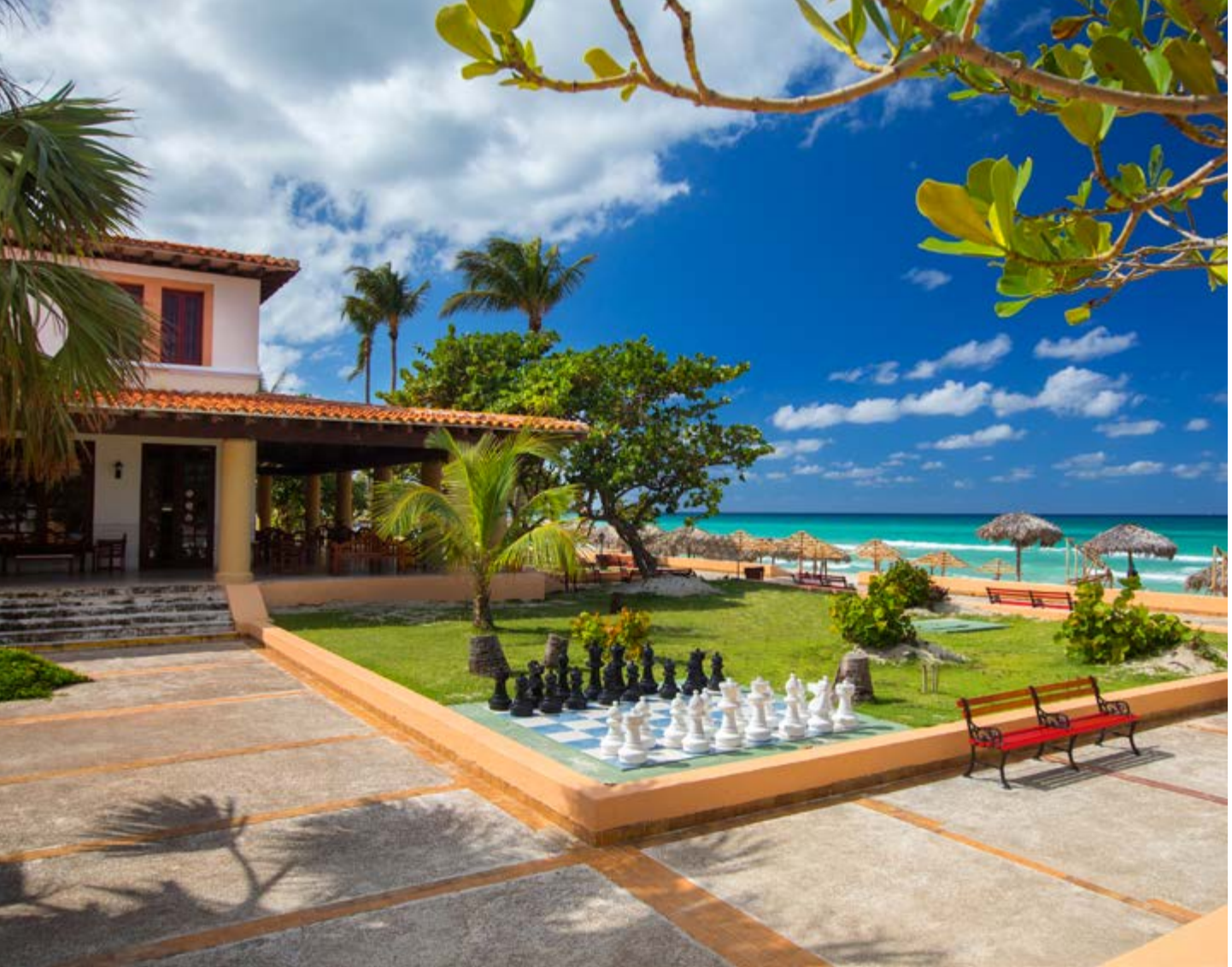
The beachfront Starfish Cuatro Palmas