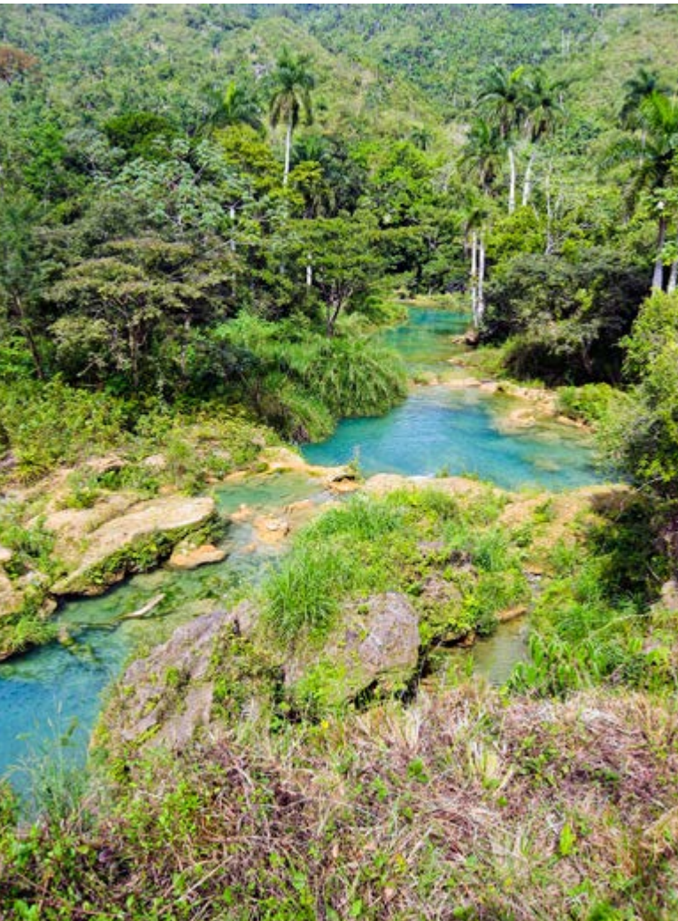
Trinidad (top); Walk through the Topes de Collantes National Park (above)

The cost of the tour is USD $3,354 per person sharing (excluding international flights and transfers)