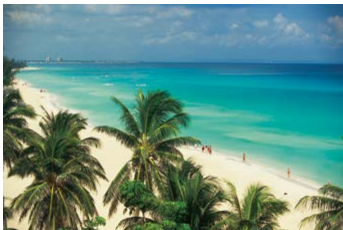
Trinidad Plaza (top); Musicians in Trinidad; Taquechel Pharmacy in old Havana; The perfect beaches of Varadero (extension) (above)

All the flights and flight-inclusive holidays in this brochure are financially protected by the ATOL scheme. When you pay you will be supplied with an ATOL Certificate. Please ask for it and check to ensure that everything you booked (flights, hotels and other services) is listed on it. Please see our booking conditions for further information or for more information about financial protection and the ATOL Certificate go to: www.atol.org.uk/ATOLCertificate