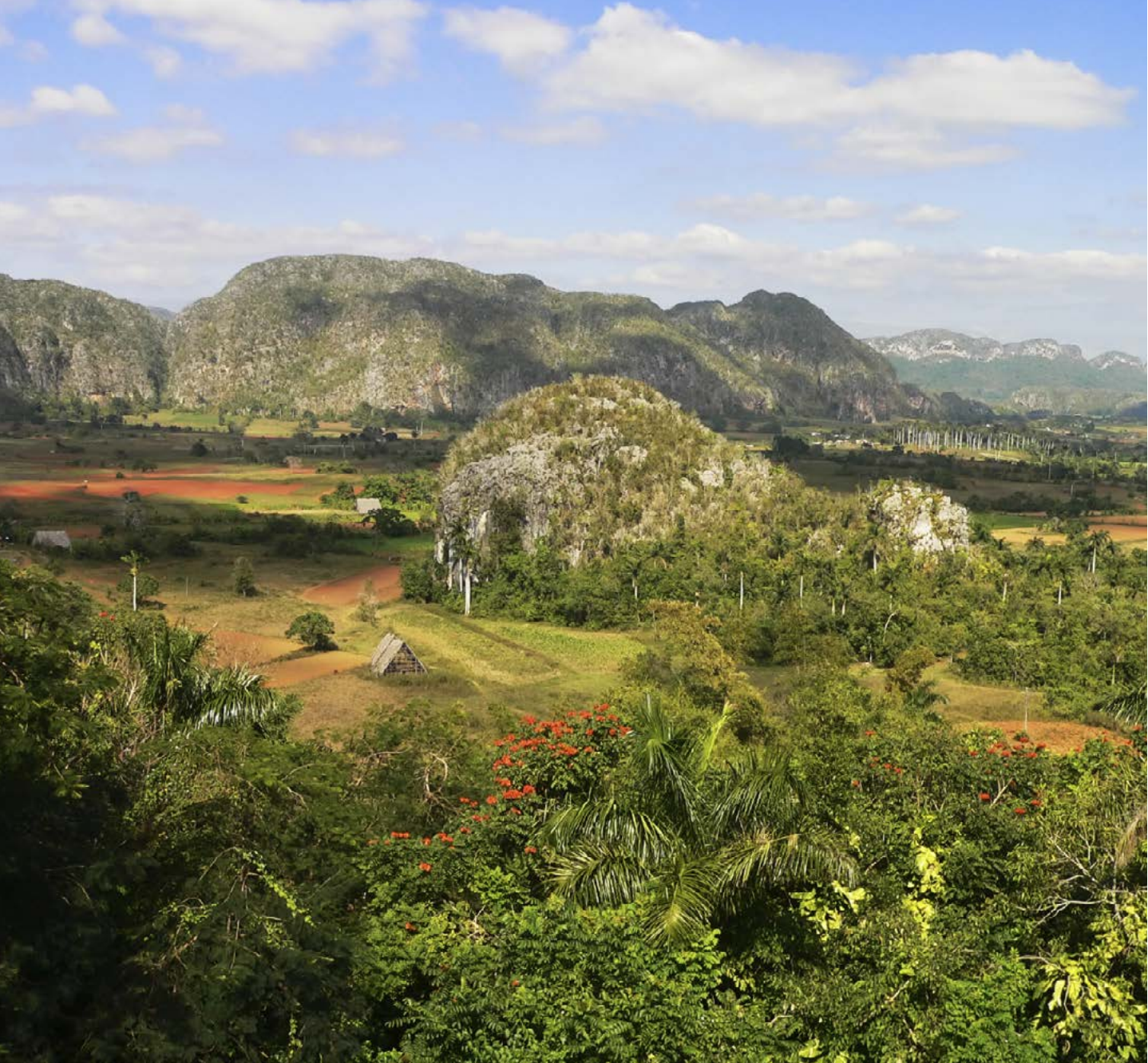
The spectacular scenery of Viñales

There is only one Cuba. This vivacious tropical island with music throbbing through its veins and a unique character kept intact by a half century of economic isolation has a vivid history and a unique healthcare system. Cuba has universal healthcare with a strong focus on primary care, preventative medicine and home health, with basic healthcare for all a national priority. Cuba has long made wide use of traditional and herbal remedies from a pharmacological perspective, from necessity as much as anything.