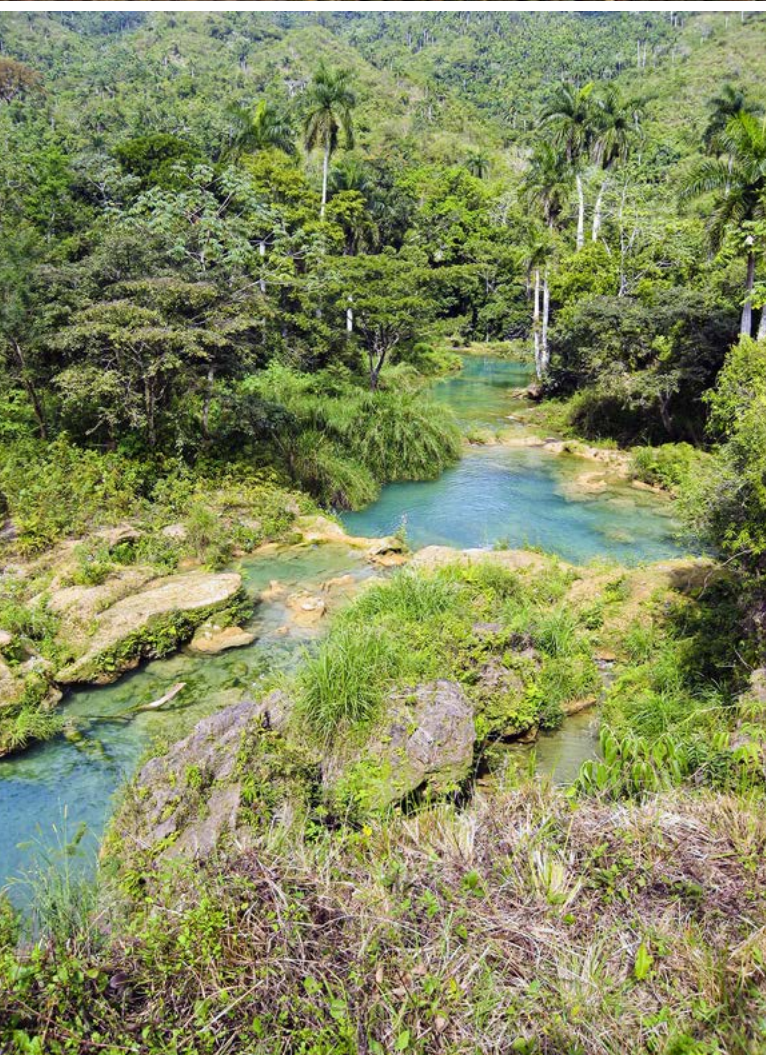
Trinidad (top); Walk through Topes de Collantes National Park (above)

The cost of the tour is USD $3,741 per person sharing (excluding international flights and transfers)