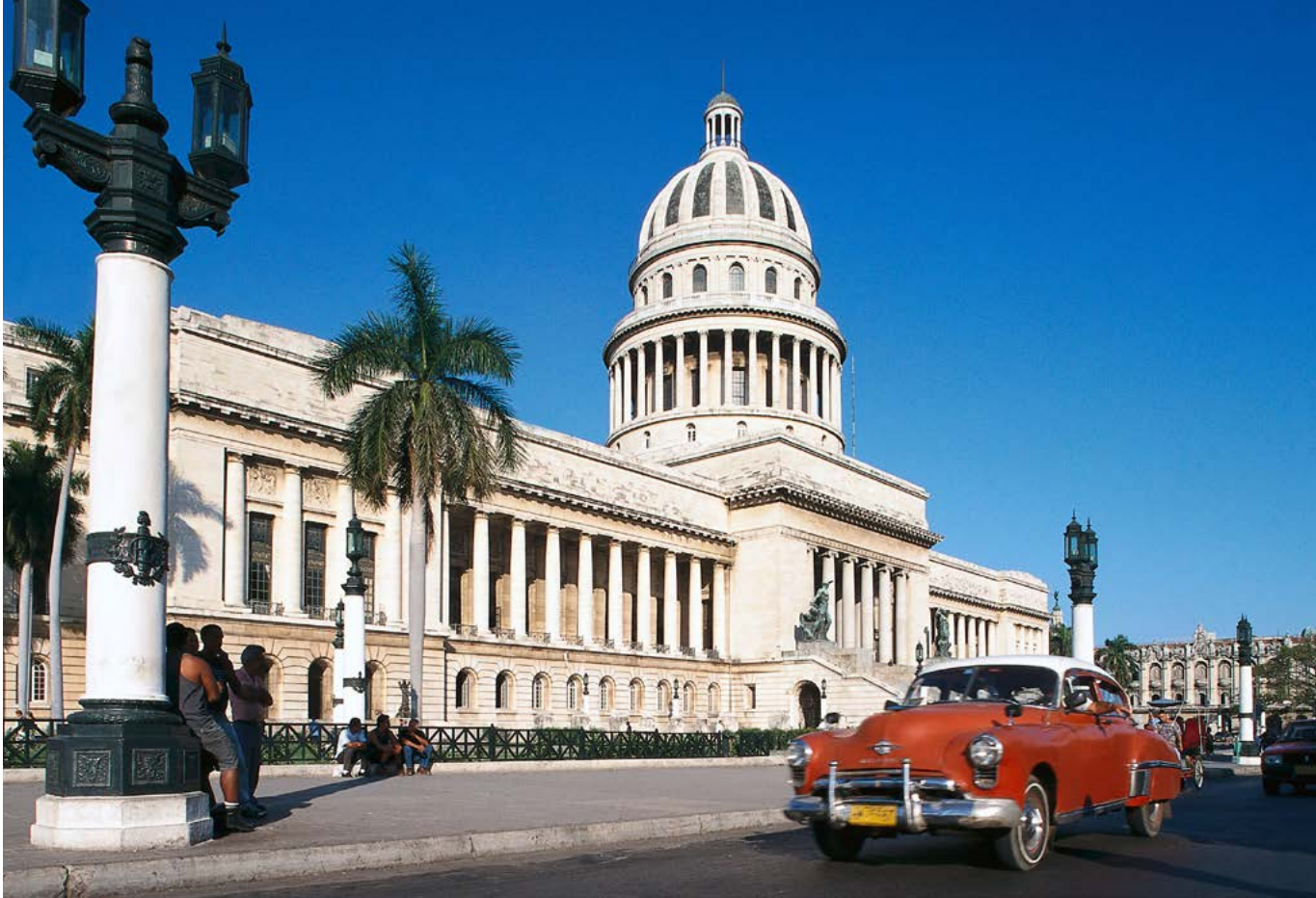
The Capitol in Havana