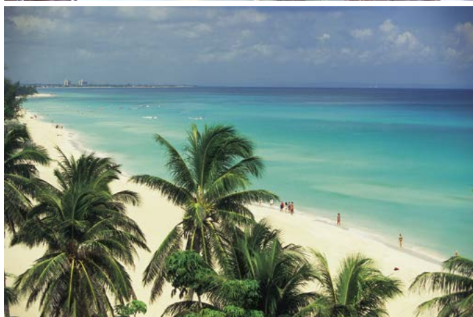
Trinidad Plaza (top); Musicians in Trinidad; Taquechel Pharmacy in old Havana; The perfect beaches of Varadero (extension) (above)