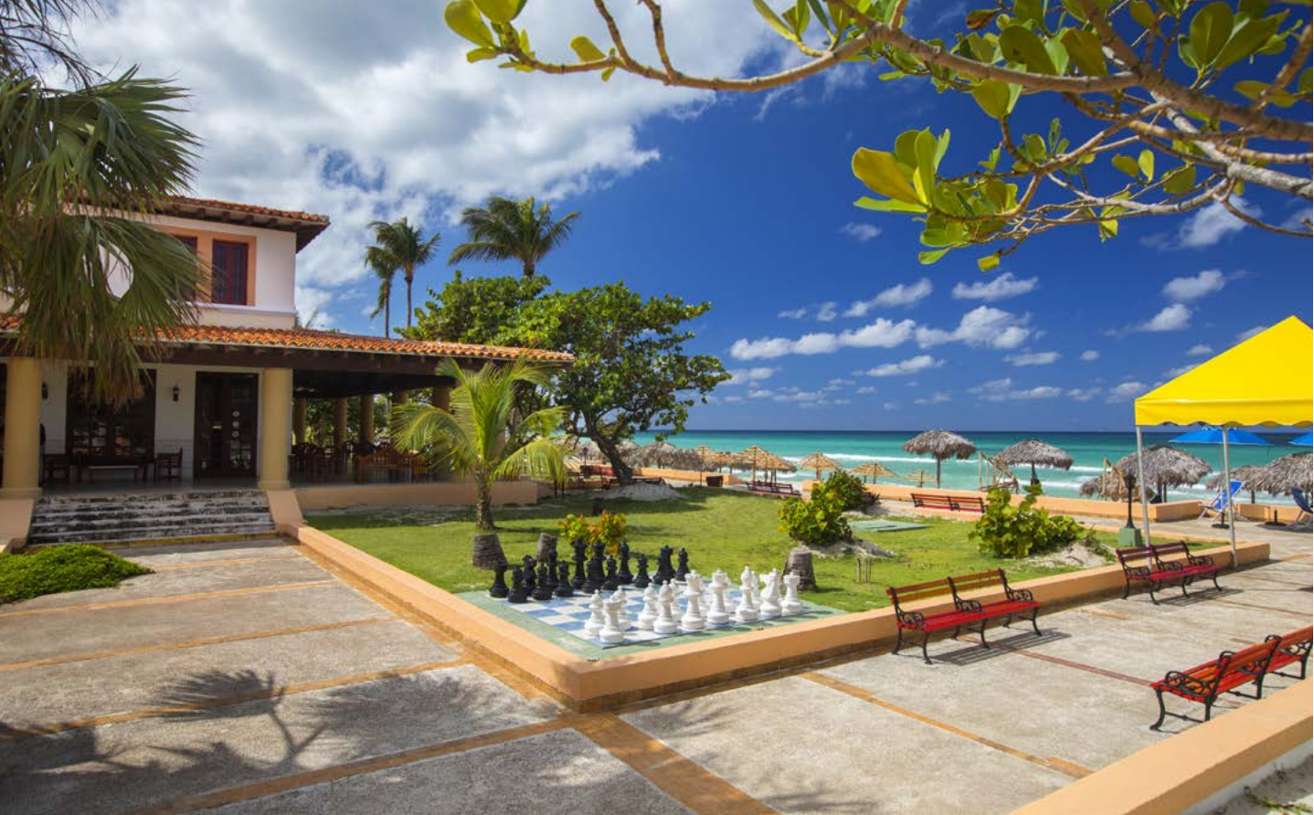
The beachfront Starfish Cuatro Palmas