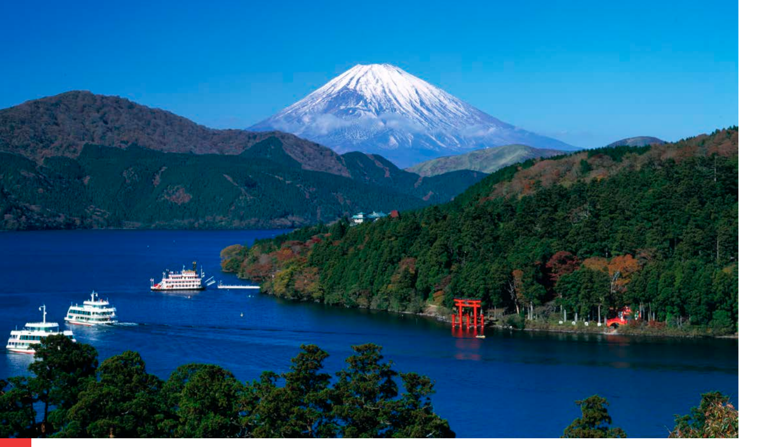
Visit Lake Ashi and Mount Fuji on the pre-tour extension