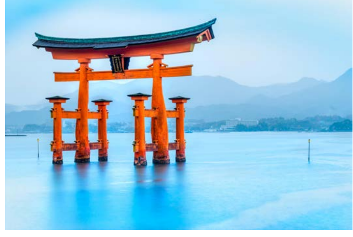
Golden Pavilion, Kyoto (top), The A Bomb Dome, Hiroshima, Geisha in Kyoto, Tori Shrine in the Inland Sea (above)