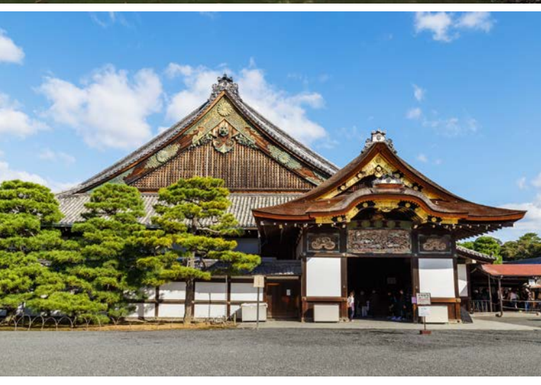
The neon splendour of Akibara (top) The Golden House, Kanazawa; Carpentry Museum, Kobe; Nijo Castle, Kyoto (above)