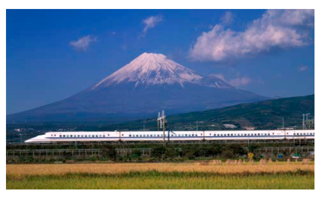
Travel by bullet train

The pre tour extension visits the Mount Fuji Region. There is the option to stay on in Japan and we can assist with additional accommodation or a trip to the historic Mount Koya. As this period is the early cherry blossom season we advise early booking.