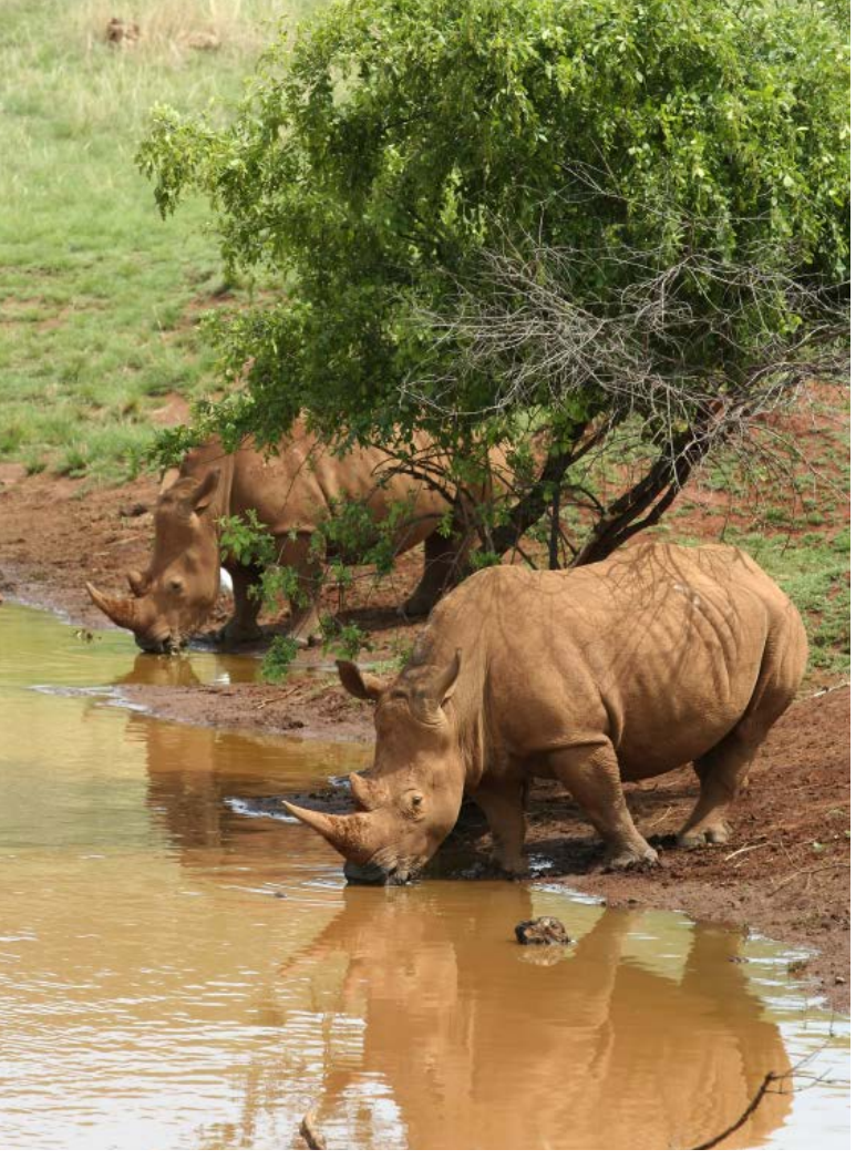
Timbavati Lodge, Kruger (top); Spectacular Victoria Falls (extension); White rhinos in Kruger (above)