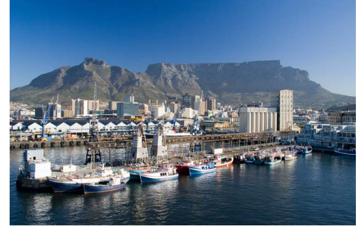
Blyde River Canyon (top); A humpback breaching off the Cape; Zulu girls; Cape Town harbour (above)