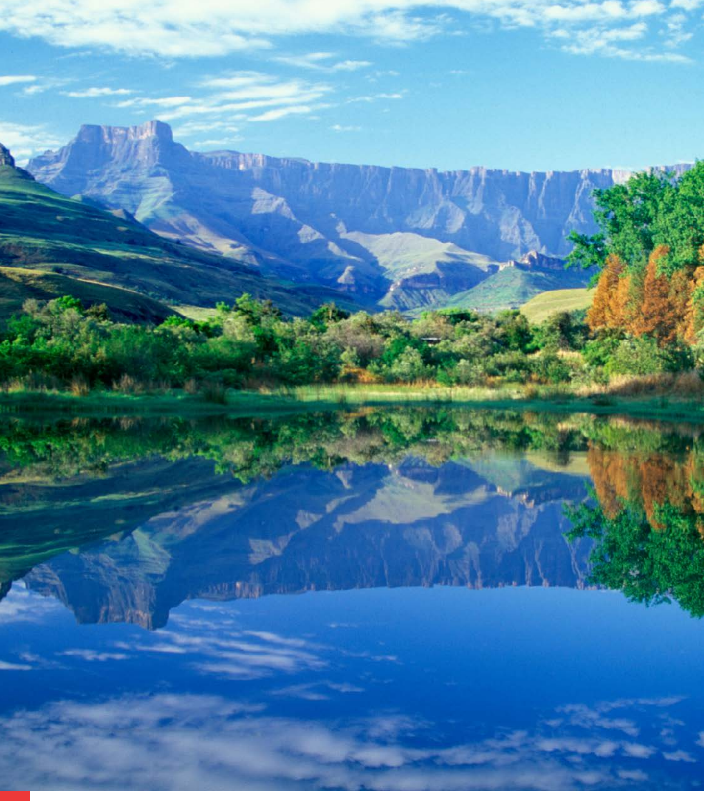
The Drakensberg Mountains, Zululand

This midwifery tour shows you the many faces of this beautiful and diverse land. Travel from Johannesburg into the safari country of Mpumalanga and the Kruger National Park, along the world famous, spectacular 'Panorama Route', into stunning Eswatini (formerly Swaziland) and Zululand, ending in the cosmopolitan harbour city of Cape Town.