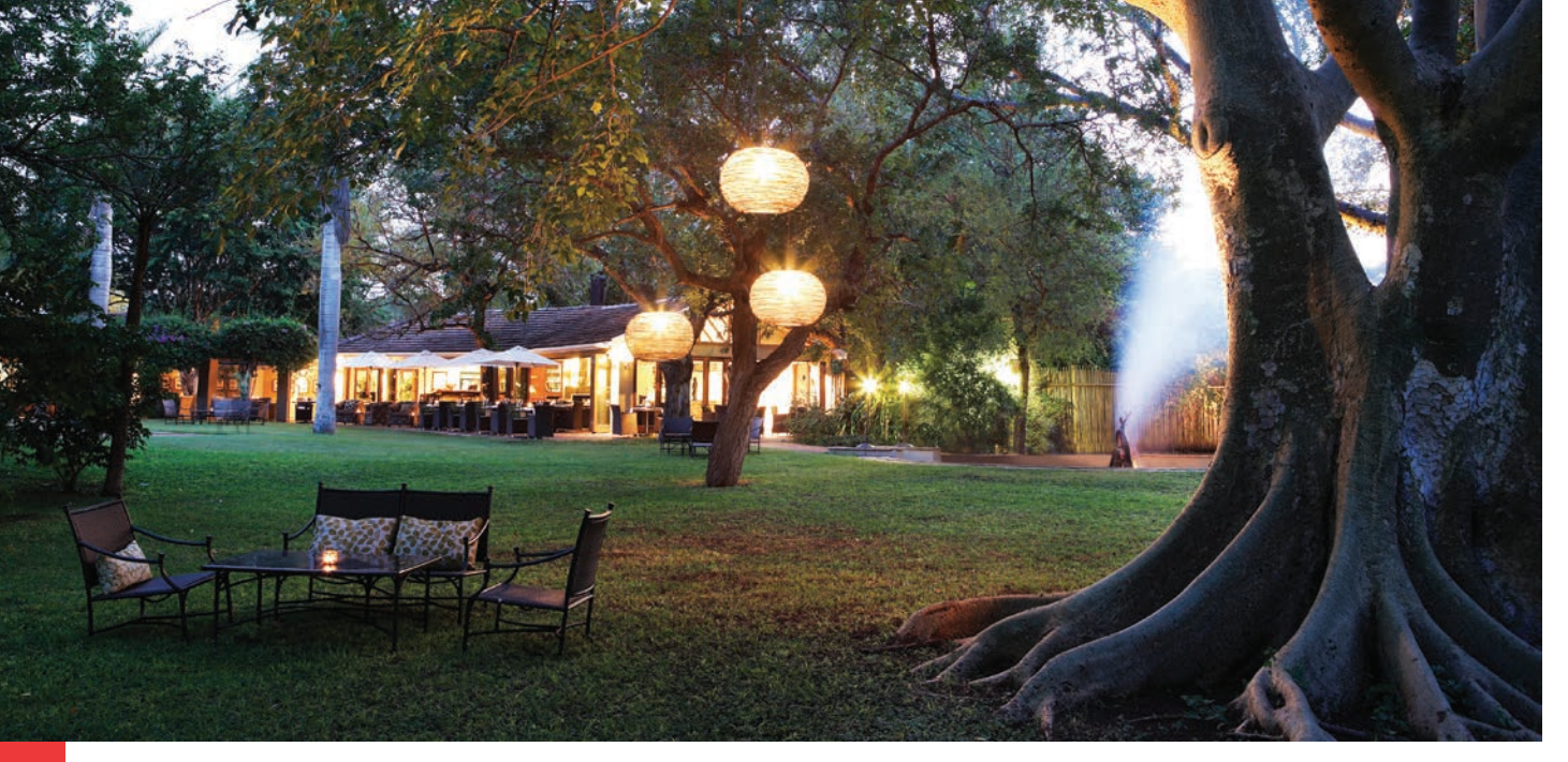
Ghost Mountain Inn, Mkuze