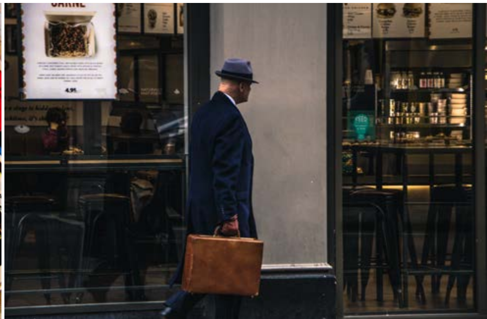
The room - See an aristocratic home, which cannot be identified (top left); Man with briefcase - On a secret mission (above right)