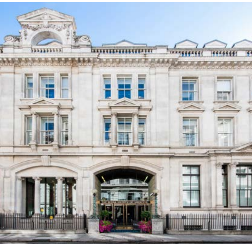
The Royal Society of Medicine