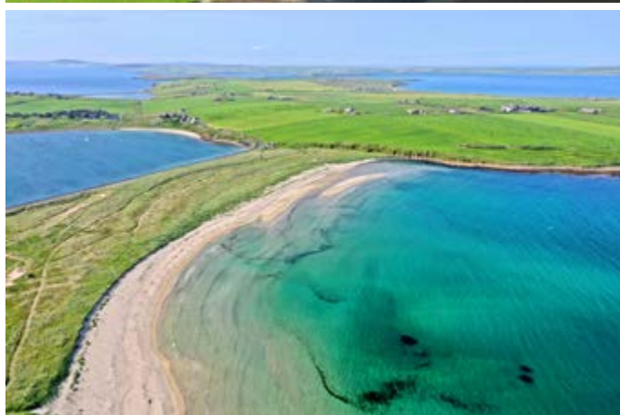
Shetland ponies (top); Jarshof, Shetland ; Earl's Palace, Orkney ; The Churchill Barriers, Orkney (above)