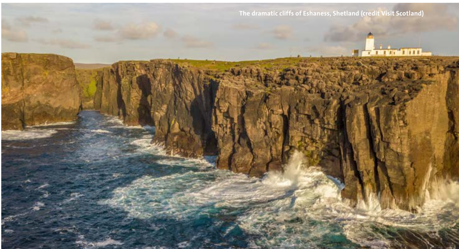
The dramatic cliffs of Eshaness, Shetland

The itinerary is subject to change according to local conditions.