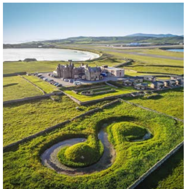
Sumburgh Hotel Shetland

There are flights to Sumburgh in Shetland and from Kirkwall in Orkney from many UK airports on Logan Air. Upon arrival there is a free transfer to the hotel (subject to availability).