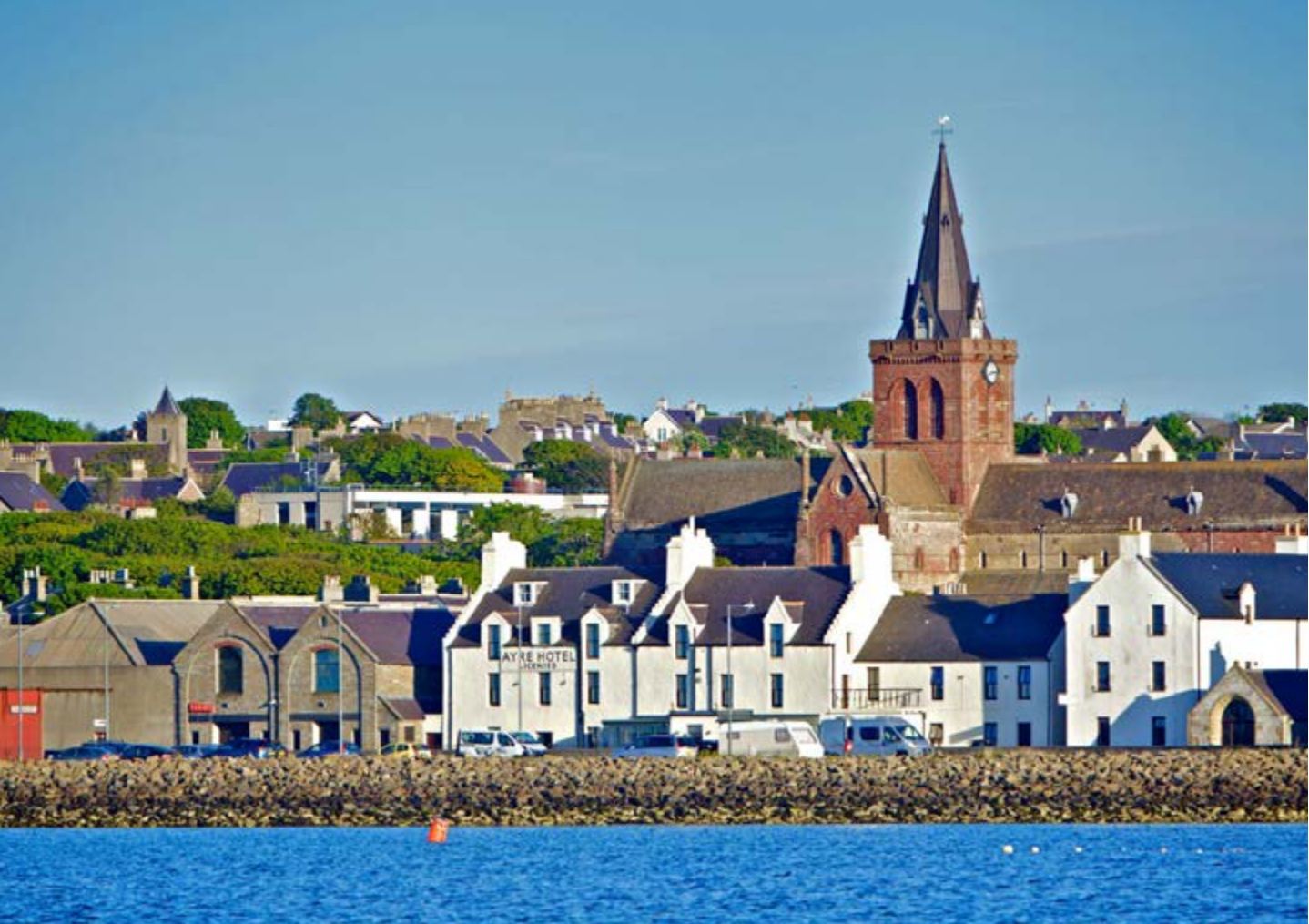
Orkney Ayre Hotel