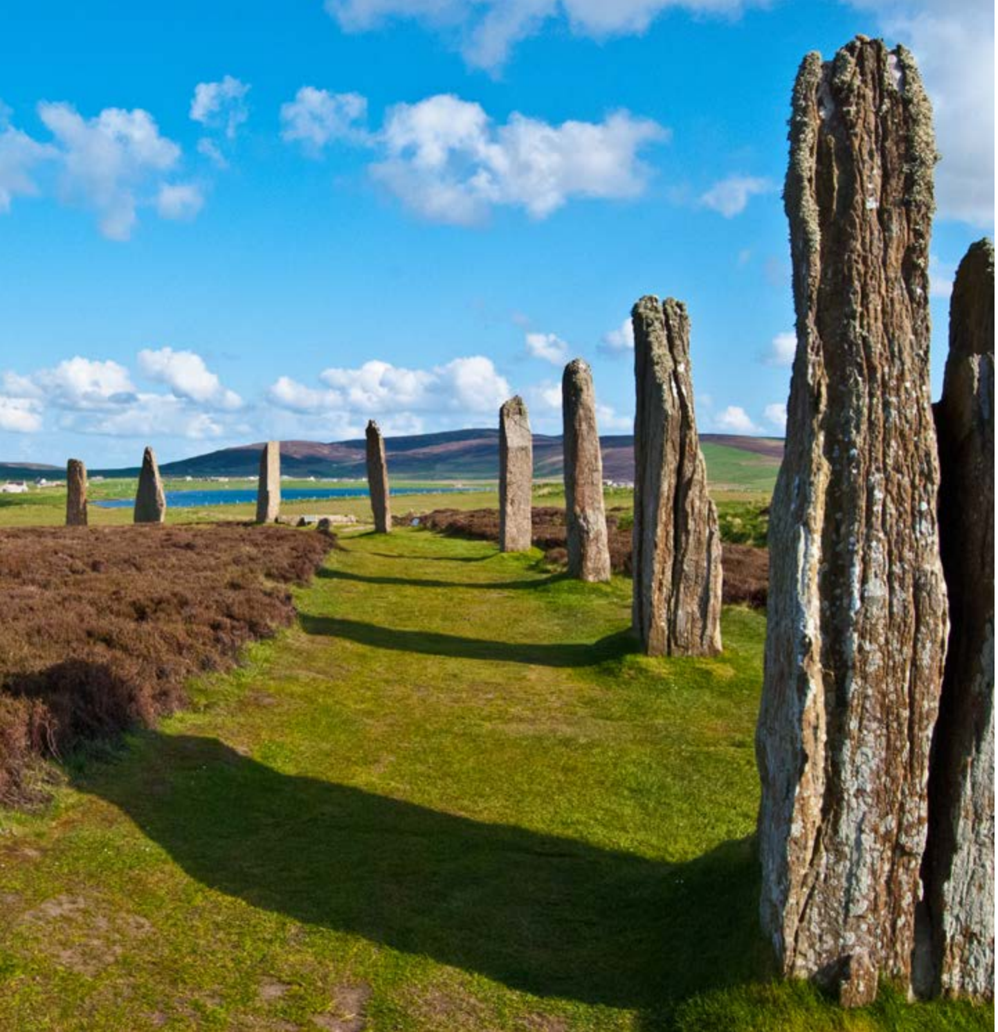
The Ring of Brodgar

Travel to the northernmost reaches of the UK through spectacular landscapes. Discover history that encompasses Neolithic times, the Bronze and Iron Ages, the Picts and the Vikings, and continues into the modern day. This tour takes you to the farthest Scottish Isles, dramatically beautiful and rich in history and culture, to experience both Shetland and Orkney in just over a week.