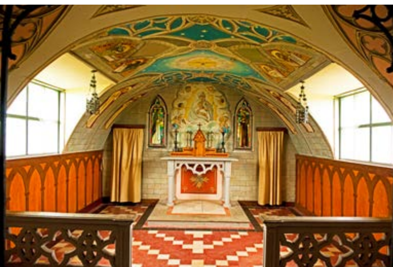
A lodberries (a hotel and houses built into the sea) in Lerwick (top); There is the option to take the Northlink ferry to Orkney; Visit Skaill House, Orkney's finest 17th century mansion; The Italian Chapel (above)