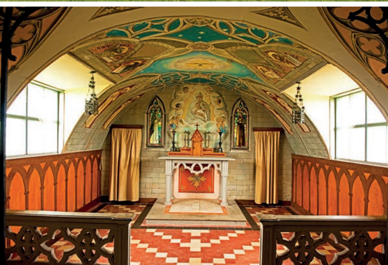
A lodberries (a hotel and houses built into the sea) in Lerwick (top); Monument to the Shetland Bus, Susi Richardson, 2021 Tour; Visit Skail House, Orkney's finest 17th century mansion; The Italian Chapel (above)

The cost of the tour sharing a twin or double room $3,304