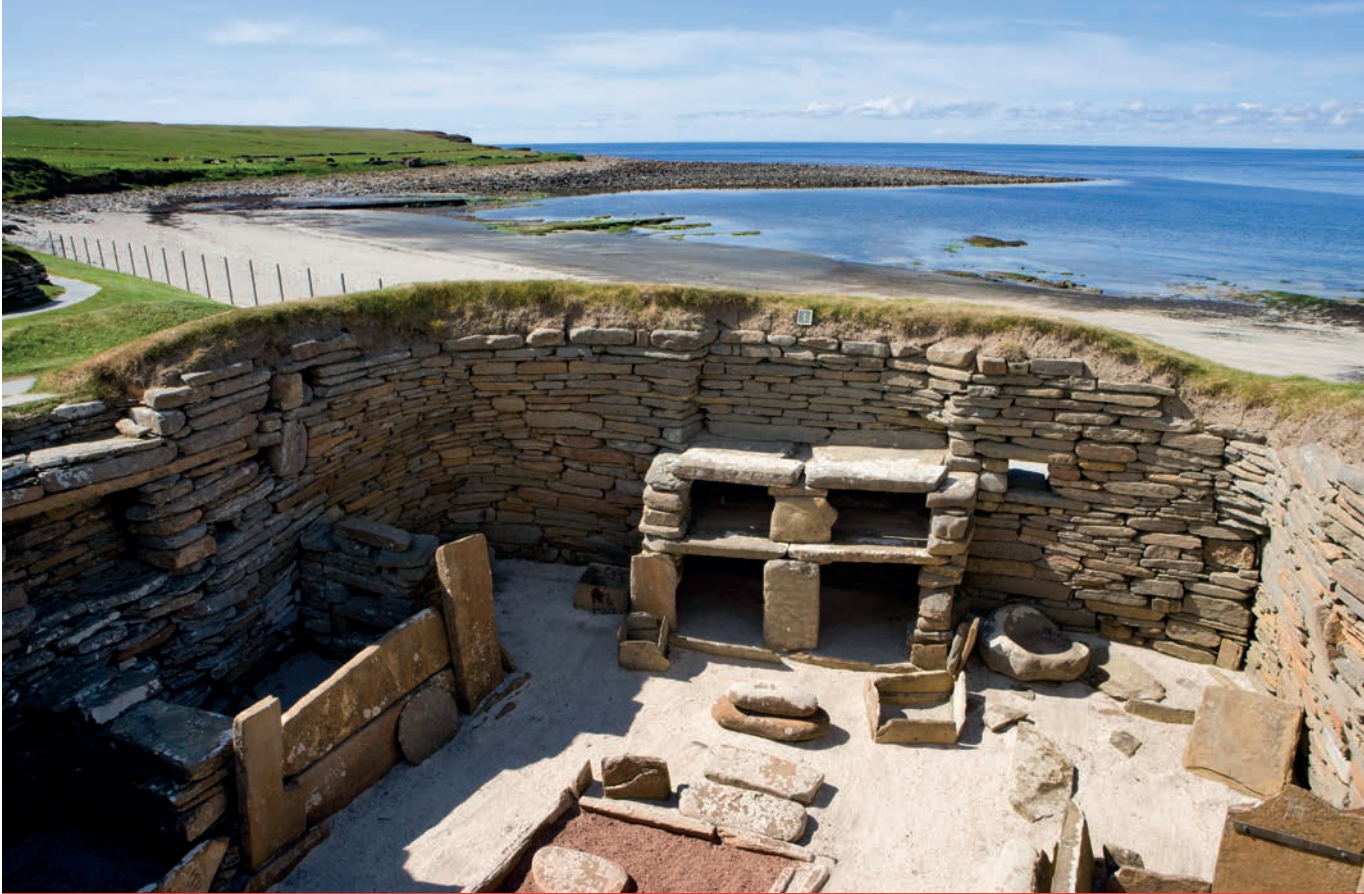
Skara Brae, Orkney