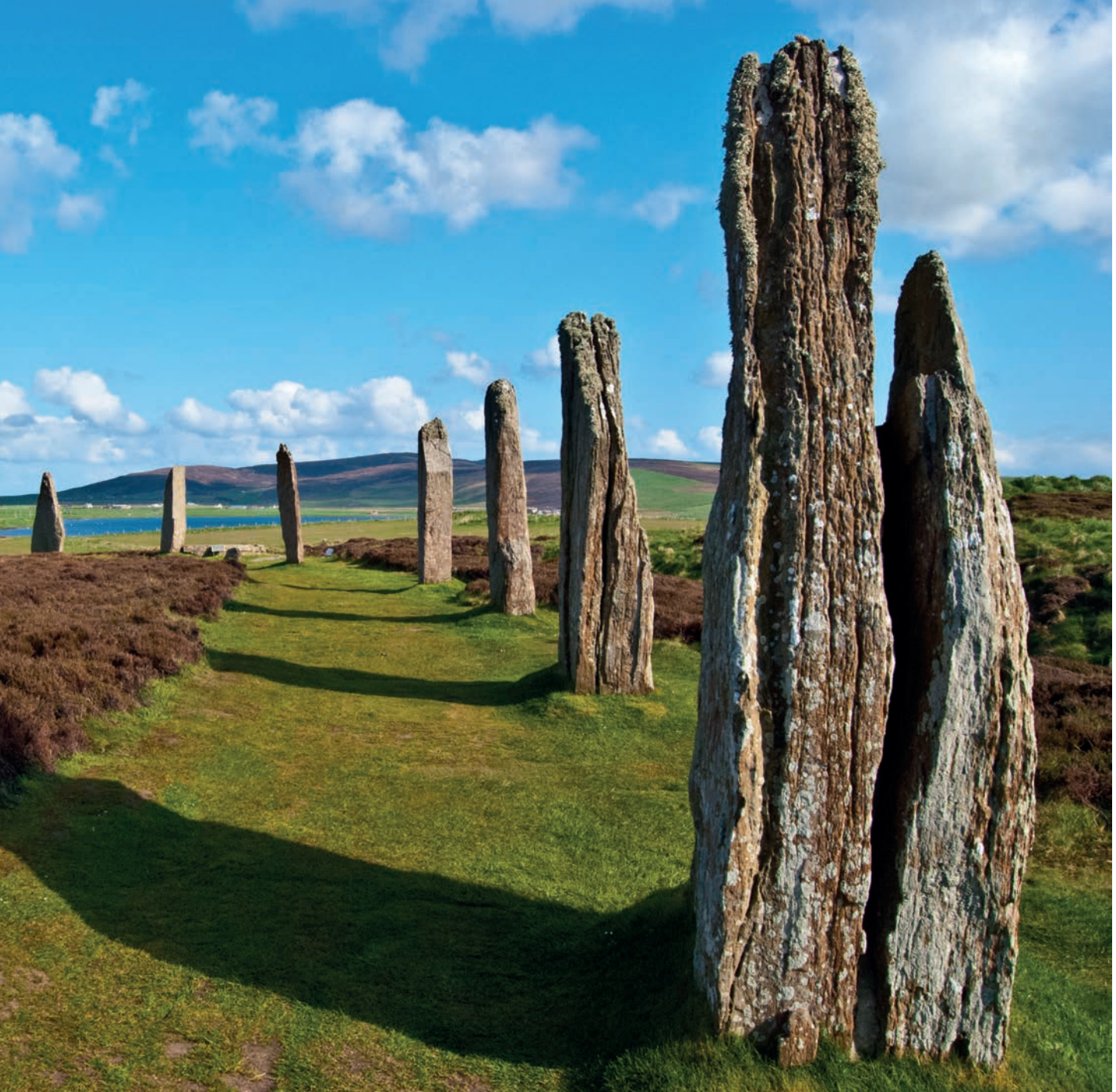
The Ring of Brodgar

Travel to the northernmost reaches of the UK through spectacular landscapes. Discover history that encompasses Neolithic times, the Bronze and Iron Ages, the Picts and the Vikings, and continues into the modern day. This tour takes you to two of the farthest Scottish Isles, both dramatically beautiful and rich in history and culture, allowing you to experience both Shetland and Orkney in just over a week.