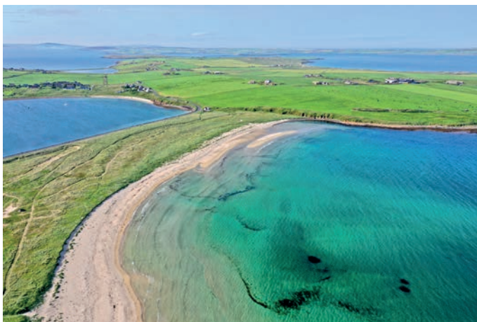
Shetland ponies (top); Jarshof, Shetland ; Earl's Palace, Orkney ; The Churchill Barriers, Orkney (above)