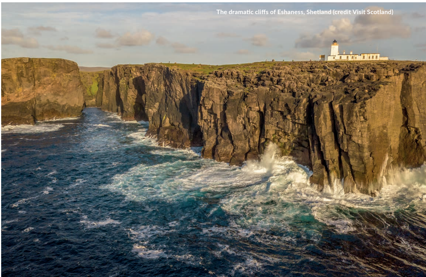
The dramatic cliffs of Eshaness, Shetland

All itineraries are subject to change according to local conditions.