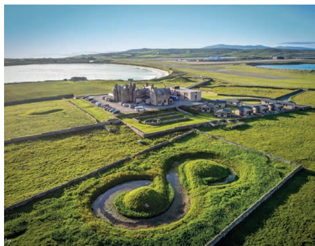
Sumburgh Hotel Shetland

There are flights to Sumburgh in Shetland and from Kirkwall in Orkney from many UK airports on Logan Air. Upon arrival there is a free transfer to the hotel (subject to availability). Please contact us for assistance in booking the Logan Air Flights.