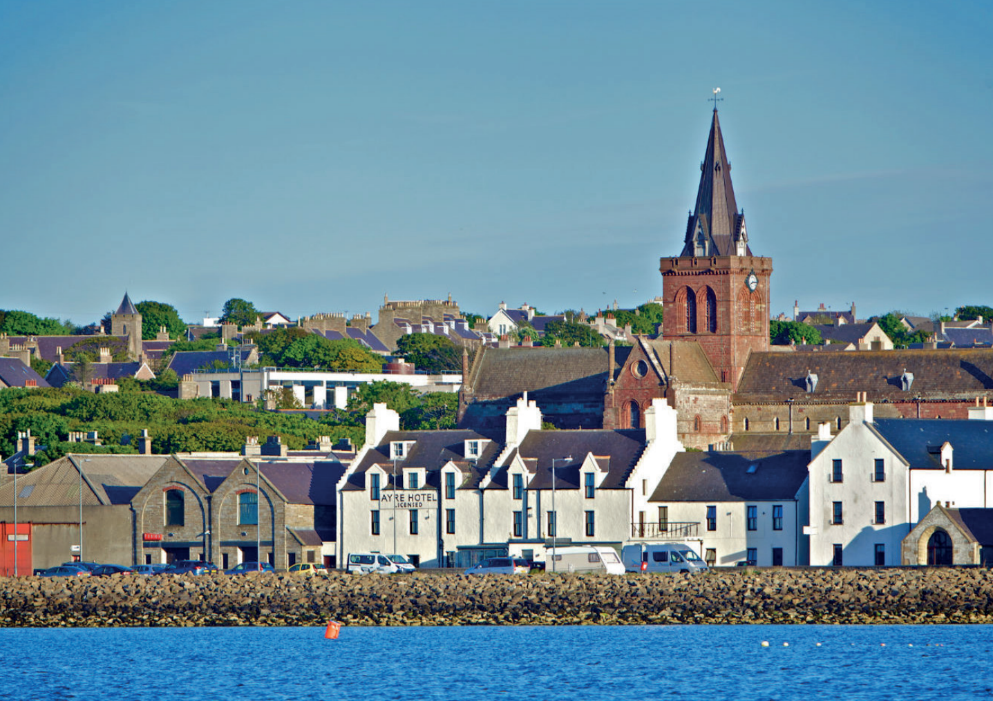
Orkney Ayre Hotel