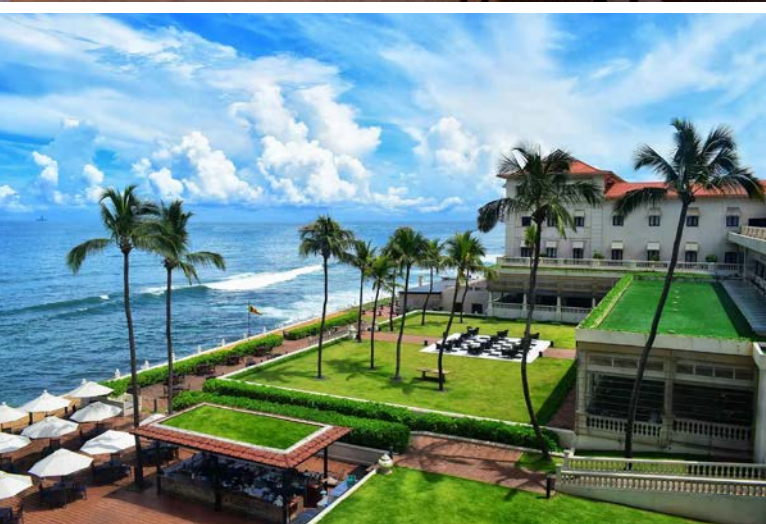
The seafront pool at Galle Face Hotel, Colombo (top); The Merchant Fort Galle Hotel, Galle; Evening on the terrace, Cinnamon Citadel, Kandy; Galle Face Hotel, Colombo (above)

The cost of the tour is USD $4,144 per person sharing