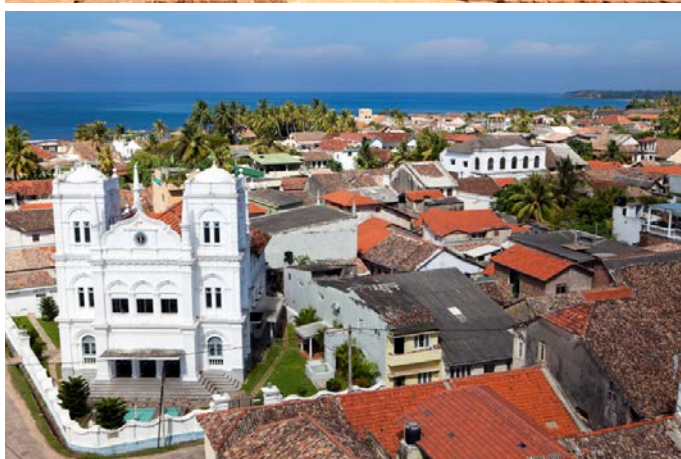
A blue whale off the coast of Sri Lanka (top); 'Celestial Maidens' fresco in Sigiriya; Lion Rock at Sigiriya; Galle (extension) (above)