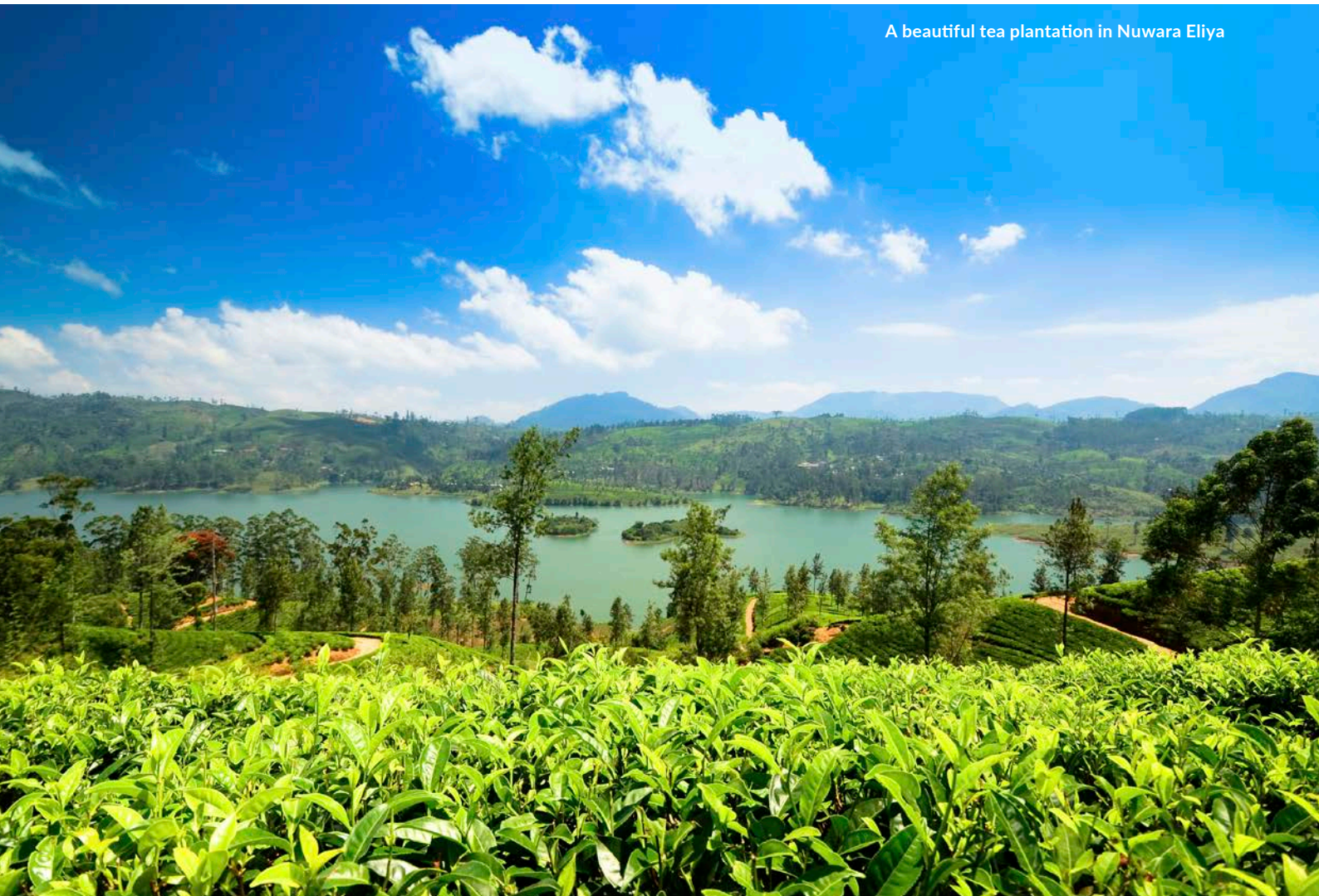
A beautiful tea plantation in Nuwara Eliya