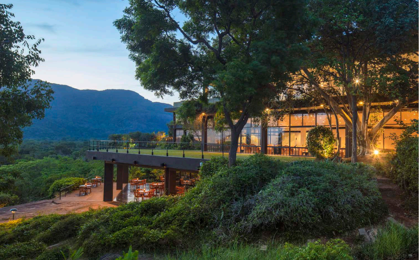
Heritage Kandalama (Sigiriya)