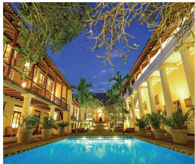
The pool at Merchant Fort Galle (Galle)

A boutique hotel with elegant décor, warm and attentive service and laidback charm. It has a superb location in the heart of World Heritage Site of Fort Galle and provides spacious, light-filled and comfortable rooms. Its warm, contemporary style is offset with historic touches throughout.