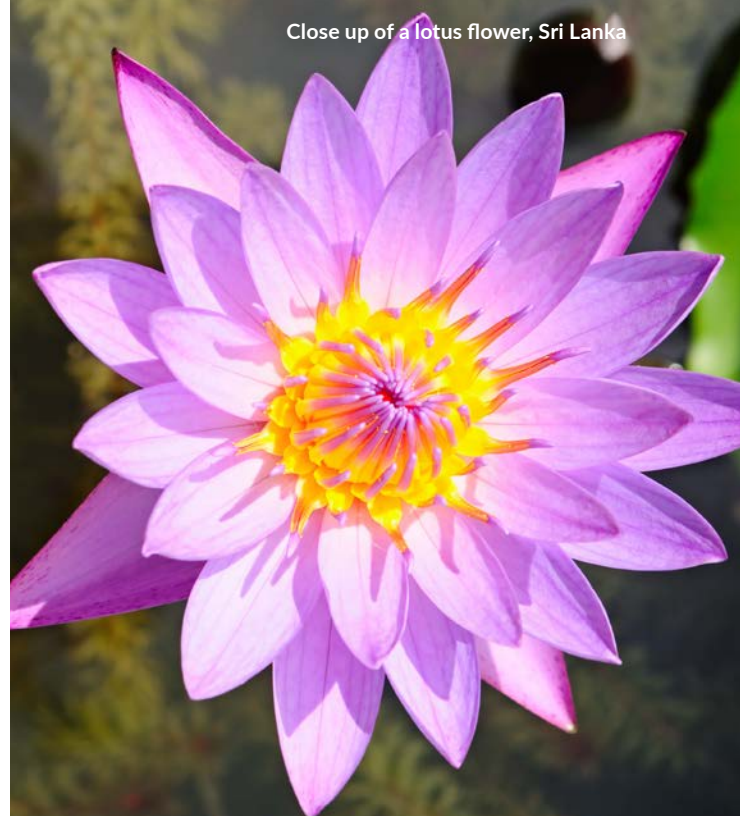
Close up of a lotus flower, Sri Lanka