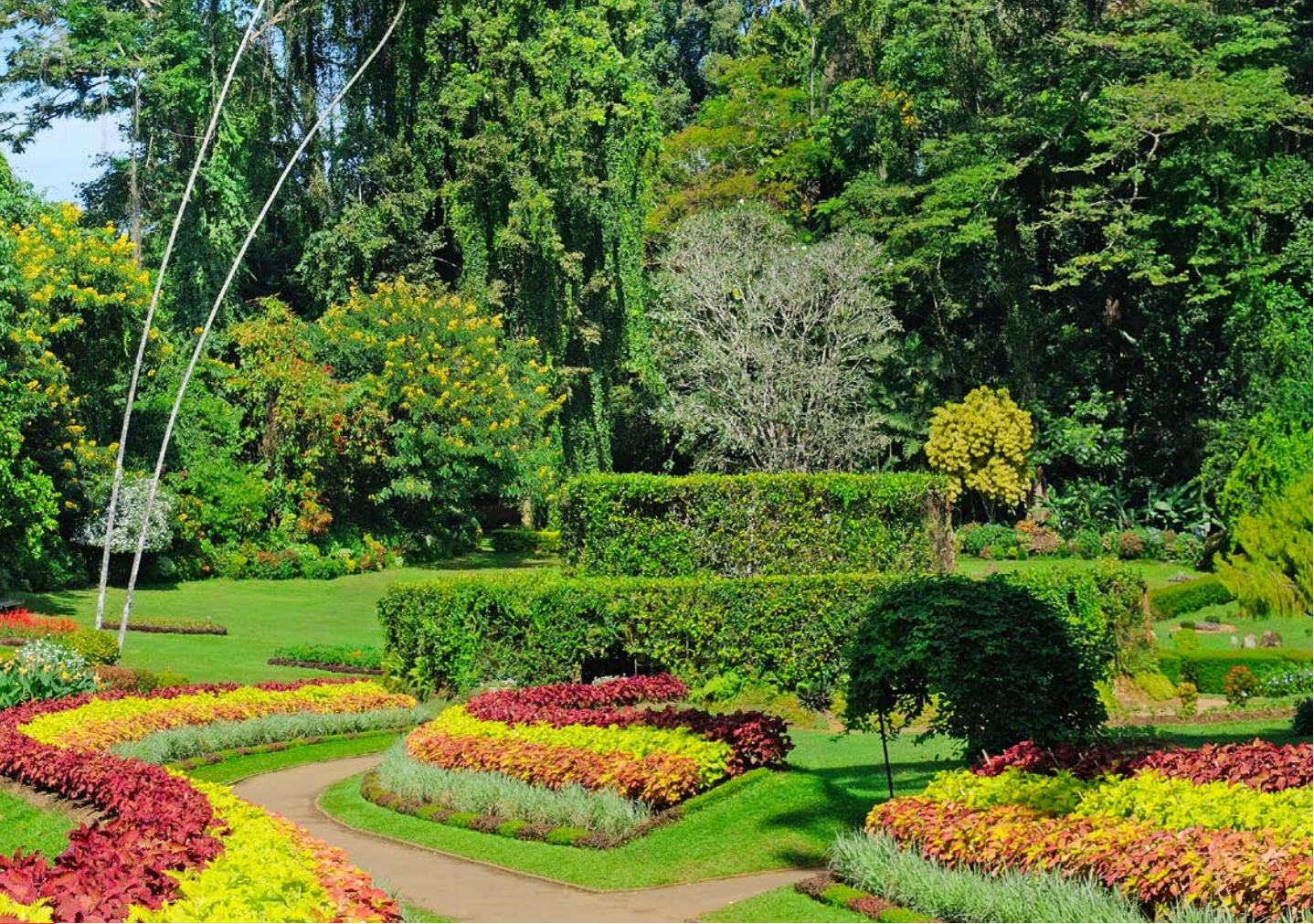
Peradeniya Botanical Gardens, Kandy