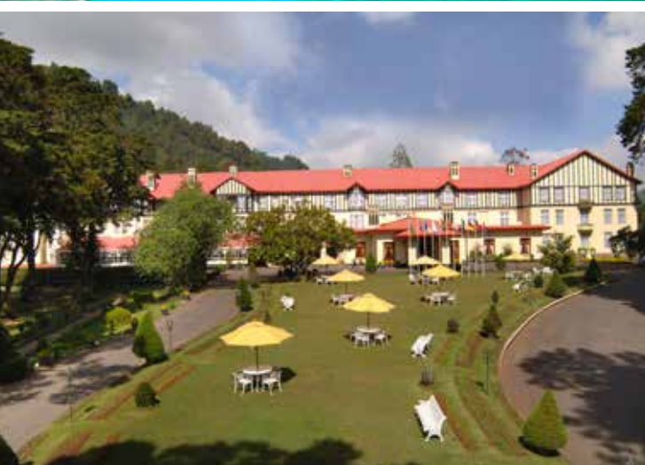
Galle Face Hotel, Colombo (top); Cinnamon Lodge, Habarana; Cinnamon Citadel, Kandy; Grand Hotel, Nuwara Eliya (above)