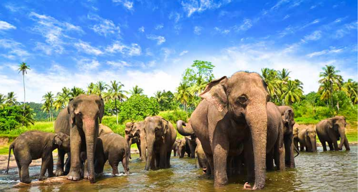
Elephants in Habarana

Welcome to Sri Lanka, a small island crammed full of treasures, with no fewer than eight UNESCO World Heritage Sites. It offers mystical ruins, jungles, gleaming white tropical beaches, national parks with huge herds of elephants and mouthwatering cuisine. Its seas are home to dolphins, turtles and the largest colony of blue whales on the planet.