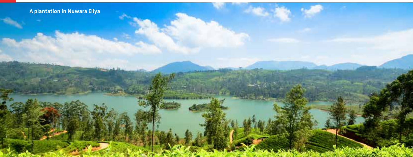
A plantation in Nuwara Eliya

Next day depart for the airport or take the three- night extension to Galle, driving along the beautiful coastline to this atmospheric colonial walled city, which boasts the best-preserved sea fort in Asia. Explore its narrow streets, city walls and secluded courtyards and mansions at your leisure, as well as visiting the Geoffrey Bawa Gardens (see itinerary for details).