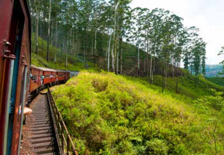
Take the train from Kandy