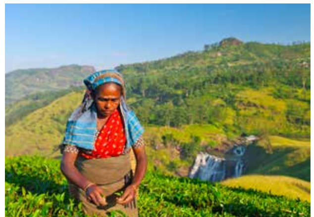
Koneswaram Temple, Trincomalee (top); A tea picker (above)