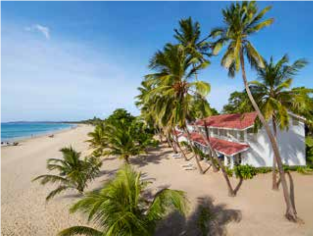
Your hotel in Trincomalee

morning for spectacular jungle views. After descending, visit a nearby village and its school before enjoying a typical Sri Lankan lunch. Return to the hotel and spend the rest of the afternoon at leisure.