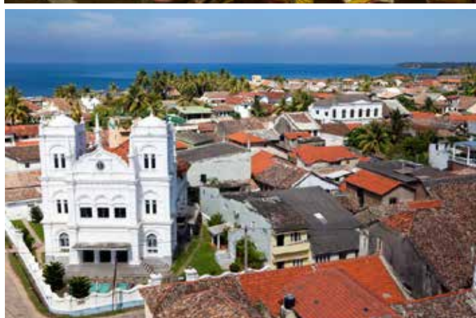
Traditional stilt fishermen (top); A blue whale; Dambulla Caves; A view of Galle - extension (above)