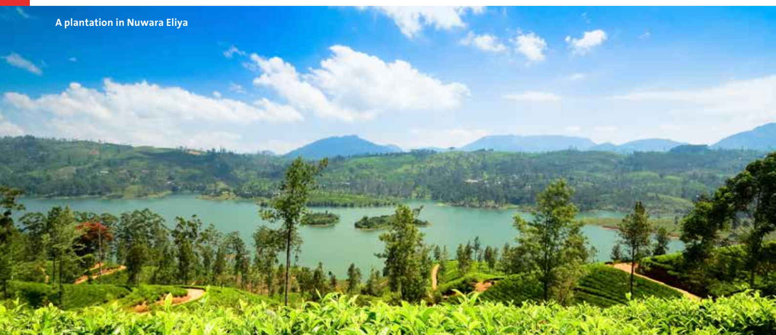
A plantation in Nuwara Eliya

The following morning visit the beautifully landscaped war cemetery in Kandy before continuing to the Royal Botanical Gardens of Peradeniya. See crops such as coffee, tea, nutmeg, rubber and quinine, visit its excellent orchid house and medicinal herbal section and see the former headquarters for the Allied forces