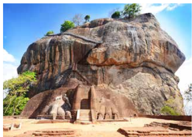
Lion Rock, Sigiriya

Next day head out to the legendary sky citadel of Sigiriya, possibly the most spectacular site in Sri Lanka. Built in the 5th century on top of a vast 200m granite rock, the rock fortress is famous for its 'Lion Rock' and its 'Celestial Maidens' frescoes. Climb up in the cool early