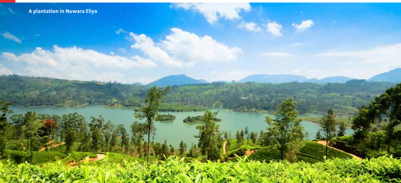
A plantation in Nuwara Eliya

Next day depart for the airport or take the three night extension to Galle, driving along the beautiful coastline to this atmospheric colonial walled city, which boasts the best-preserved sea fort in Asia. Explore its narrow streets, city walls and secluded courtyards and mansions at your leisure, as well as visiting the Geoffrey Bawa Gardens (see itinerary for details).