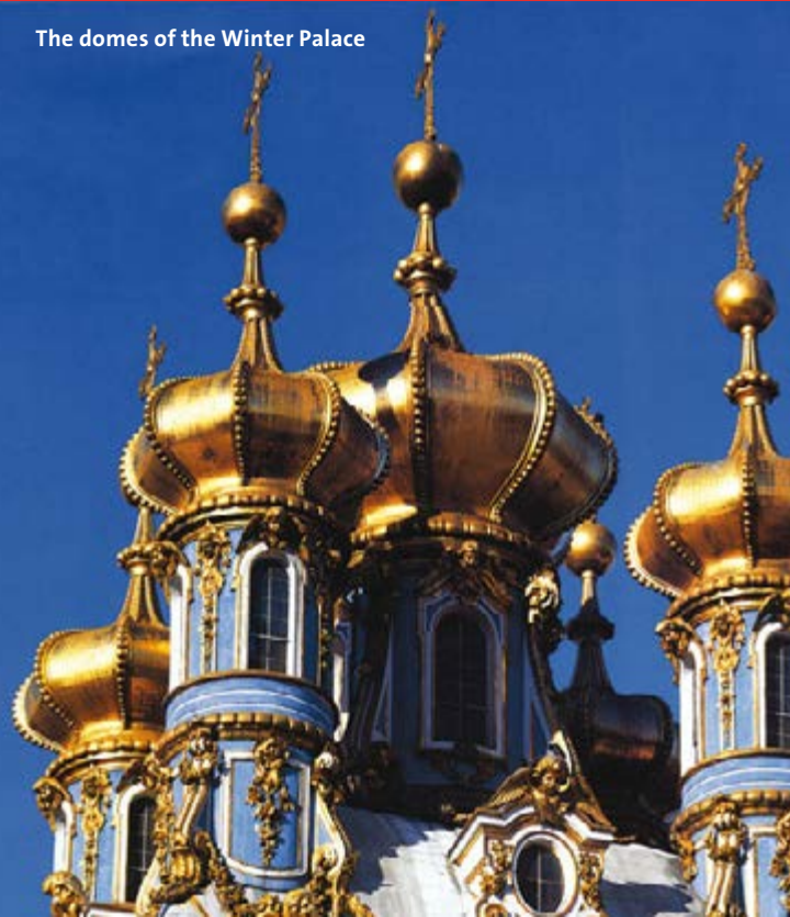
The domes of the Winter Palace

There will be opportunities to visit the ballet and/or classical performances. Performances will be confirmed closer to the time and tickets may be bought in advance once the programme is known.