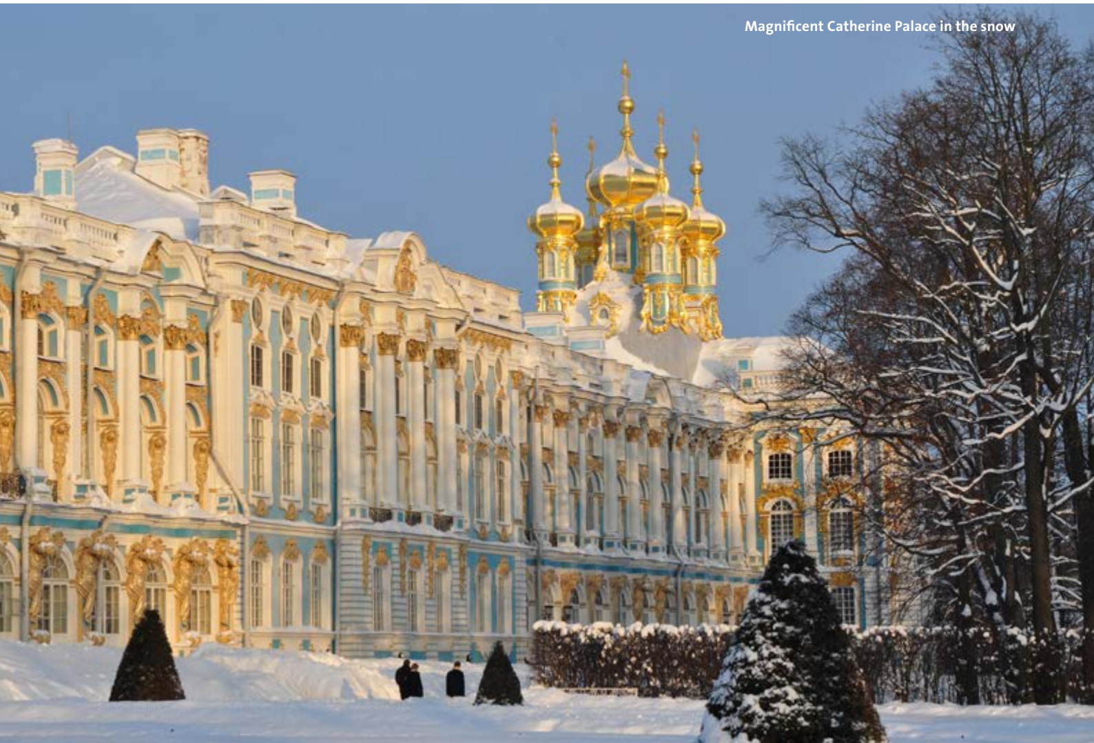
Magnificent Catherine Palace in the snow

has shown her compliance with government and industry COVID-19 guidelines, has a Risk Assessment in place and ensures social distancing including using a phone app when providing tour commentaries.