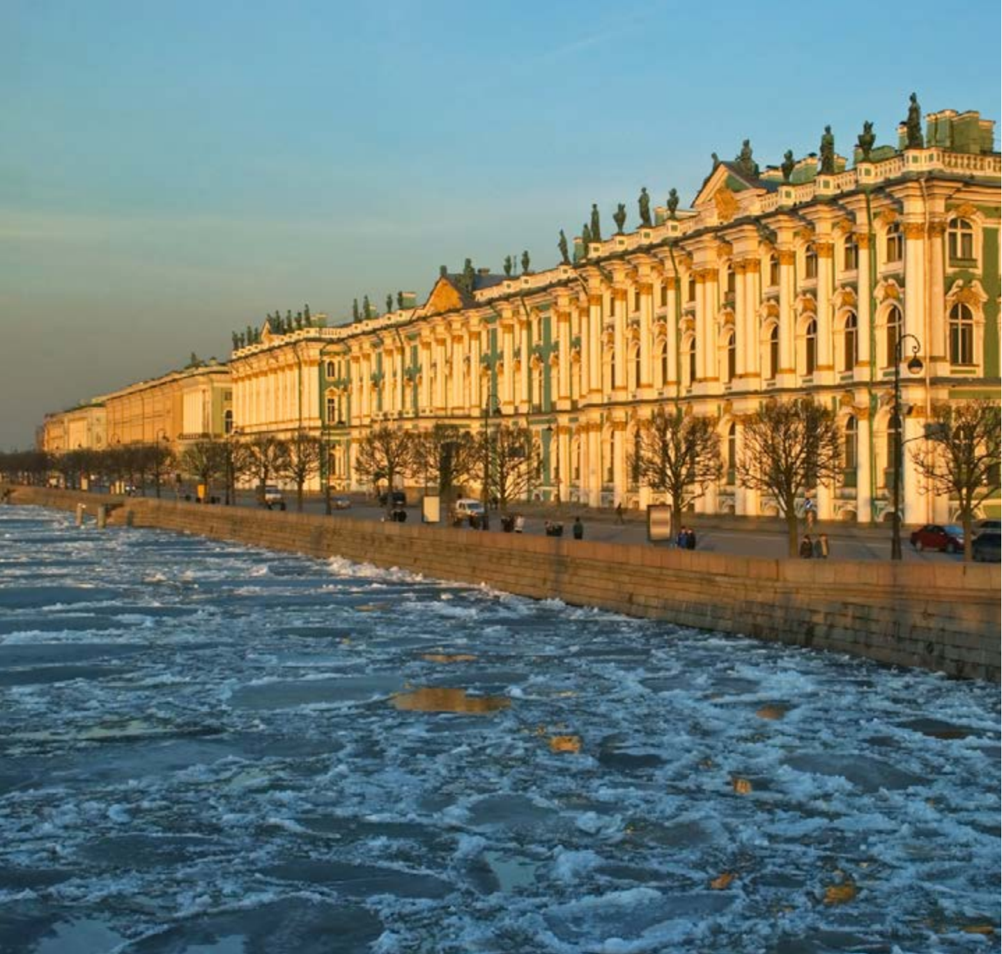
The great Hermitage Museum overlooking the frozen River Neva

The great city of St Petersburg is a byword for grandeur and opulence. Built in 1703 by the westward looking Peter the Great as a symbol of Russia's growing status, it went on to become the Romanov's magnificent showcase capital. It lost its status as capital after the revolution, but some might argue in name only; St Petersburg still feels every bit the imperial city with its historic heart largely frozen in time.