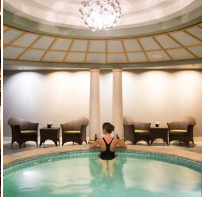
L'Europe restaurant (left); The hotel spa (above)