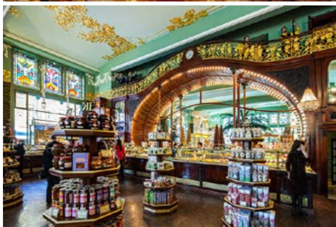
Peter and Paul Fortress (top); The exterior of Belmond Grand Hotel Europe; Inside the Hermitage; Lunch at the beautiful Eliseyev Emporium (above)