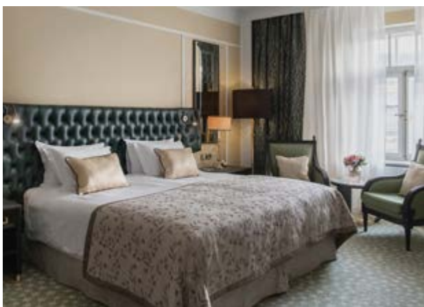
A hotel room

A truly grand historical hotel, the beautiful Belmond Grand Hotel Europe has enchanted Russia's high society for over a century from its prime location on Nevskiy Prospekt. Its magnificent interiors and architecture lend it a stately ambience which is punctuated by Art Nouveau flourishes, particularly in its gorgeous L'Europe restaurant, which is Russia's oldest continuously serving restaurant. The hotel has played a central role in the life of the city for 140 years and is an iconic building; particularly magical in the heart of winter when snow lies outside and a warm welcome awaits within. This luxury hotel provides four restaurants and bars – including the city's only dedicated Caviar Bar - a fitness centre with spa, sauna and plunge pool, and a beauty salon.