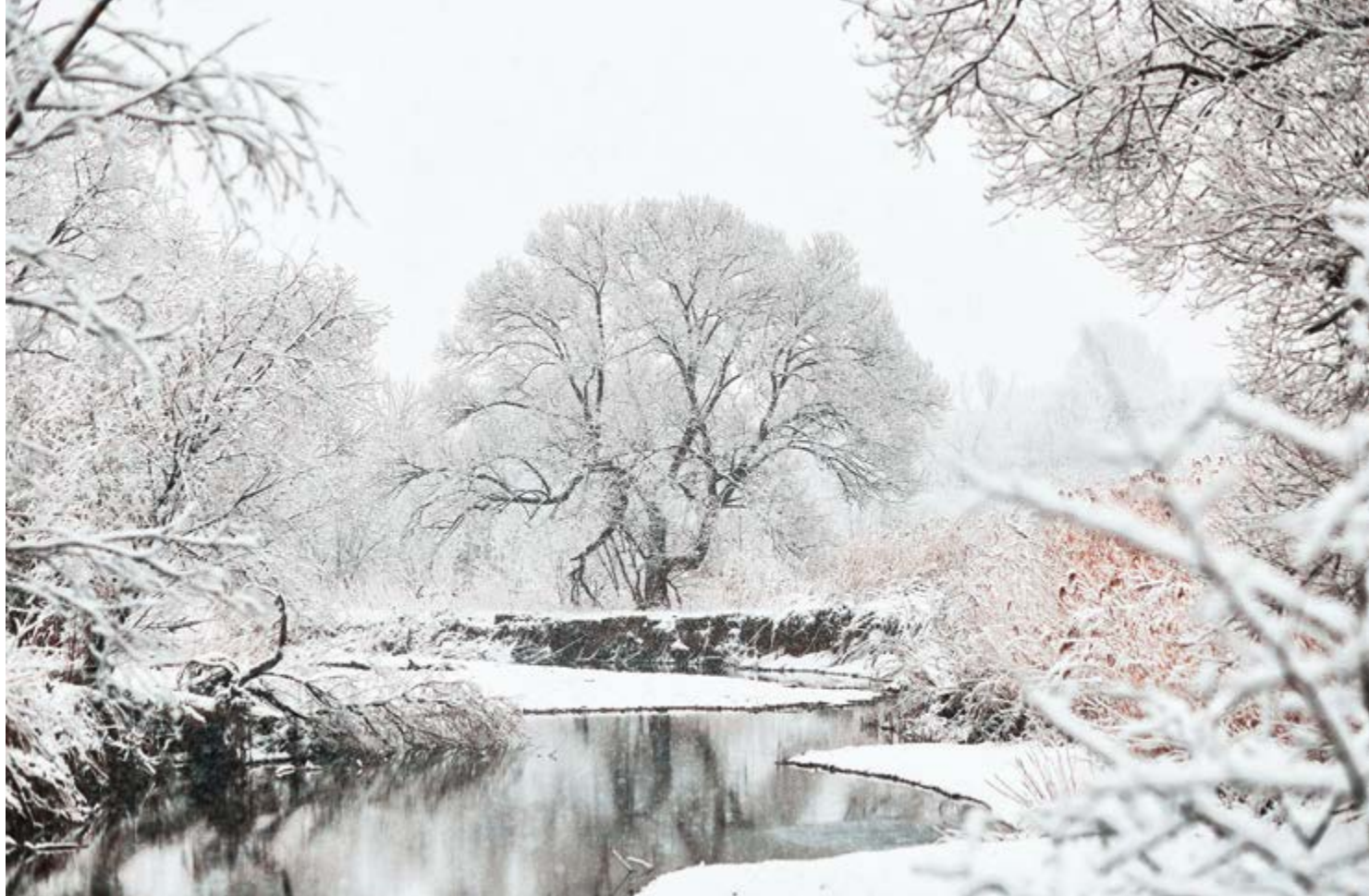
A winter park in St Petersburg