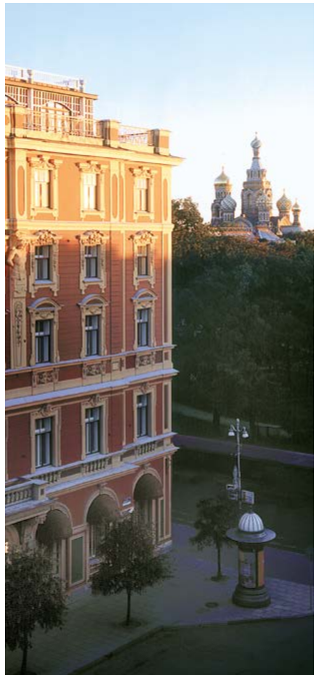
The exterior of the hotel with views of the Church of the Spilled Blood