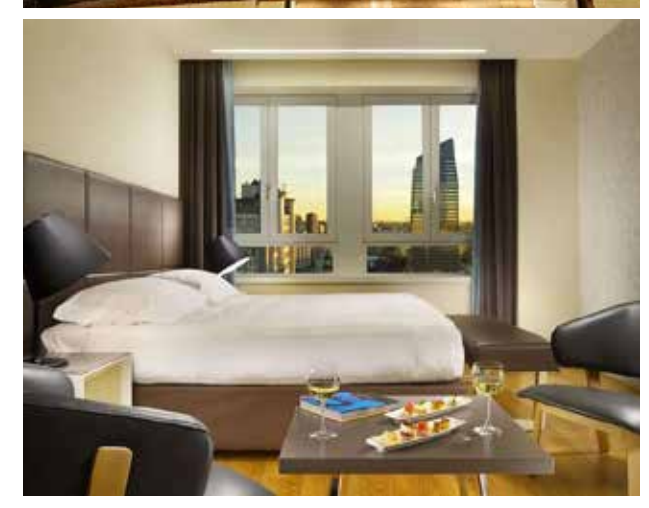
See Leonardo's famous 'The Last Supper" fresco (top); The outside of the UnaHotel Century Milan; A room in the UnaHotel (above)