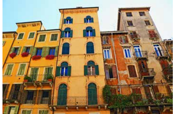
'Vertical gardens' near your hotel in Milan (top); Santa Maria della Grazie, home of the famous "Last Supper"; High fashion in Milan; Wander through Piazza delle Erbe, Verona (above)