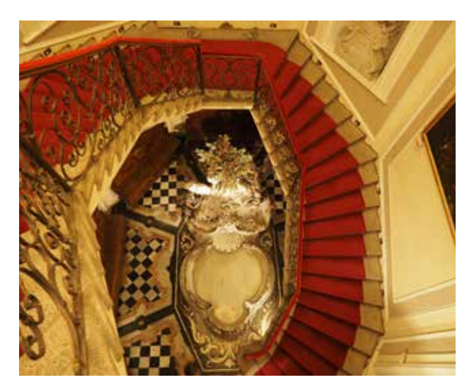
Poldi Pezzoli Museum

a Visconti fortress and later home to the mighty Sforzas, the rulers of Milan, who transformed it into a magnificent ducal palace. Today it is home to a number of museums, including the impressive Museum of Ancient Art, which you will visit. In the afternoon take a walking tour of the city and step inside its magnificent Duomo, an intricate Gothic behemoth that has soared above Milan's streets for centuries.