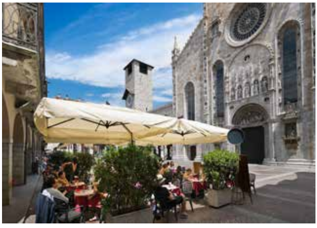
The 1st century amphitheatre in Verona (top); Street life outside Como Cathedral (above)